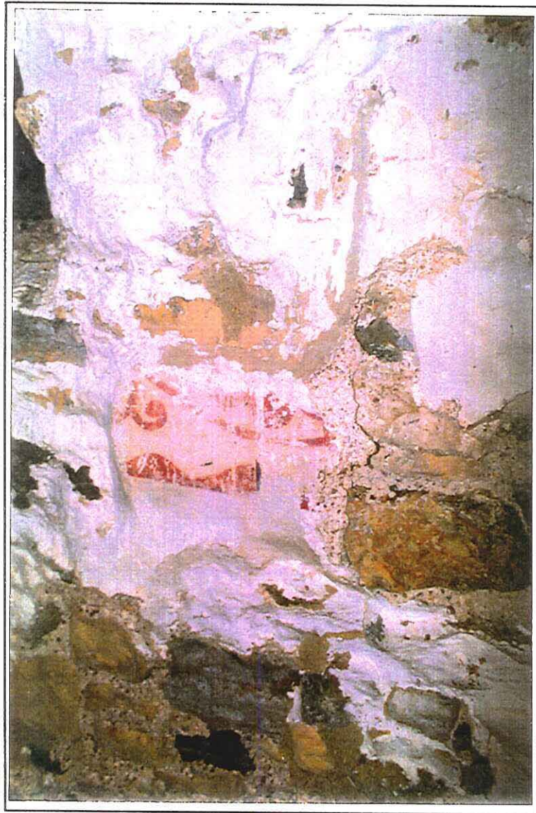
Great Hall, west wall, south end, detail painted plaster