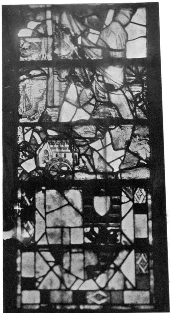
Thaxted church, Essex