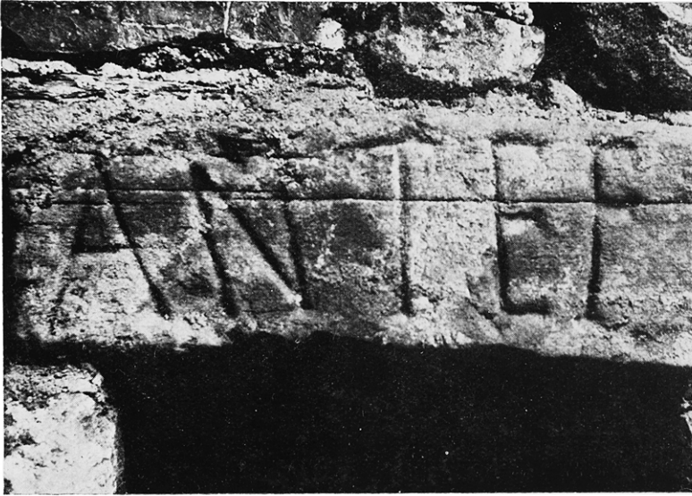
FIG. 3.—INSCRIBED STONE AT MILLOM.