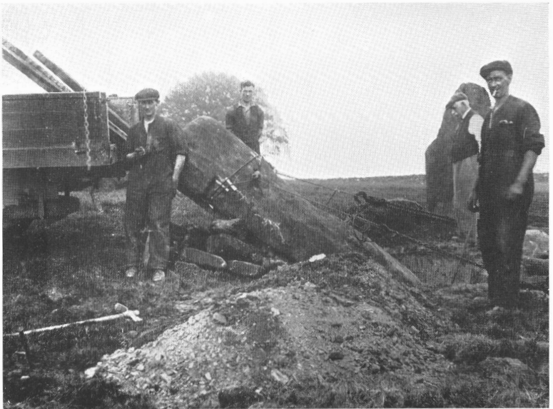
FIG. 2.—The raising of Stone No. 1 at a later stage.