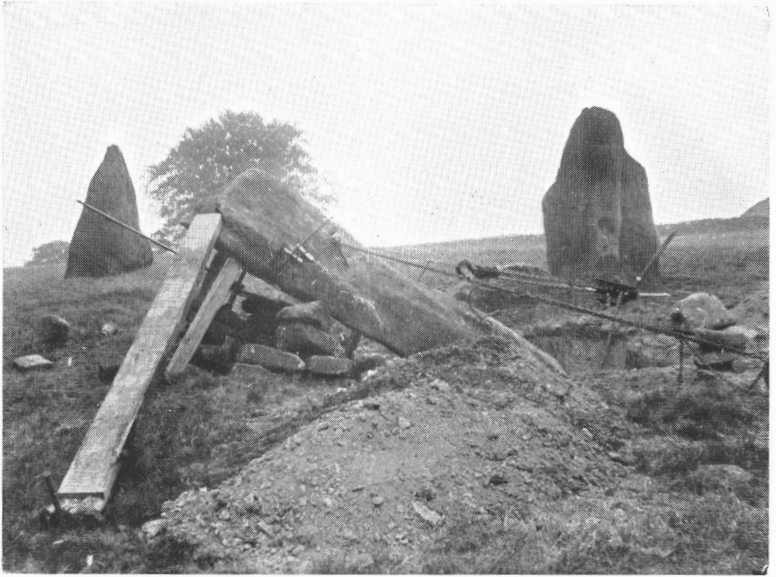
FIG. 1.—The raising of Stone No. 1.