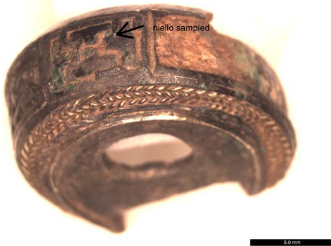
Figure 1: K242 with sample position marked. Scale bar = 5 mm