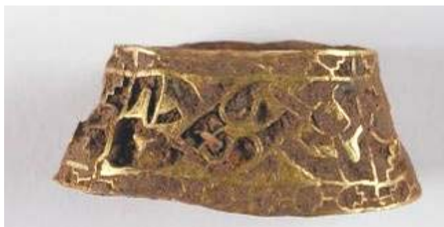
Figure 3: Gold cloisonné hilt collar with no garnet inlays. Some of the cells are filled with a black material identified as silver sulphide.

The green material which has copper as the main component is as yet unidentified. It is not clear if the green fill is a decayed inlay material, backing paste or metal corrosion, though the latter seems unlikely as the hilt collar has no copper components. K 660 is being further investigated by SEM-EDX in conjunction with conservation cleaning, to clarify the questions of its decoration.