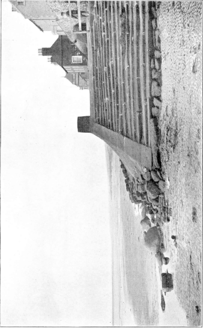
The Top Slip, Parkgate