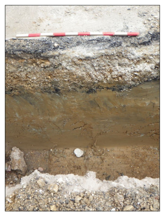
Plate 1: Representative section showing tarmac and build up layer on top of brickearth