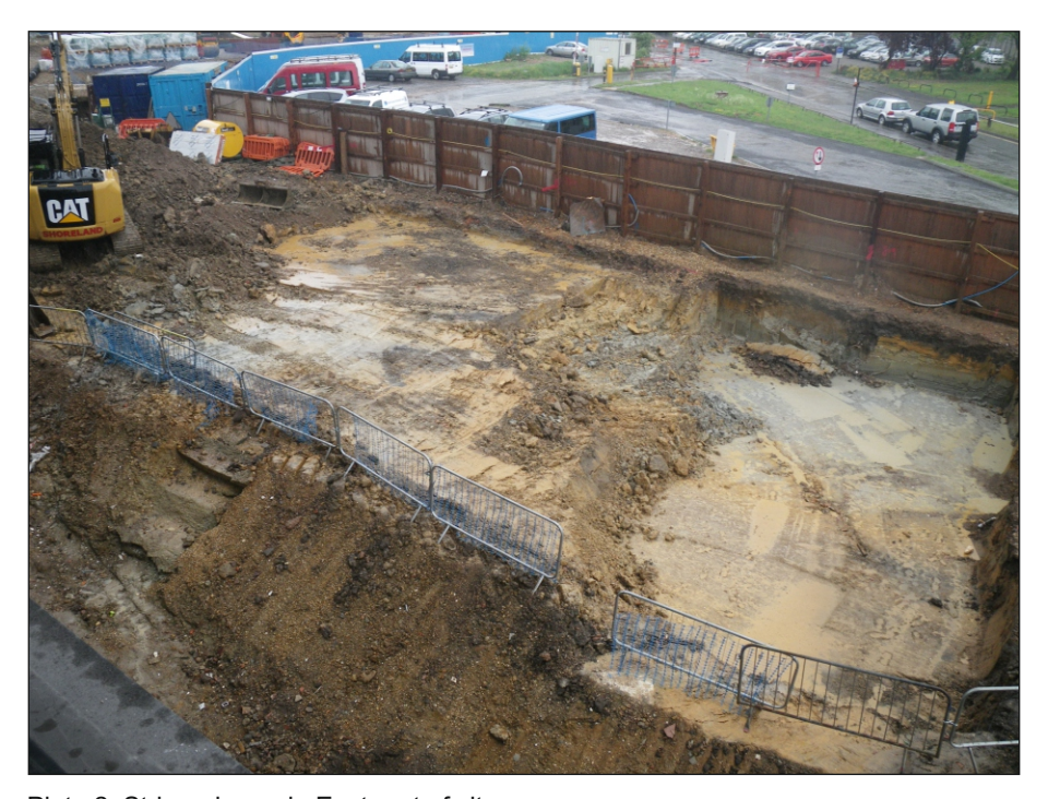
Plate 2: Stripped area in East part of site