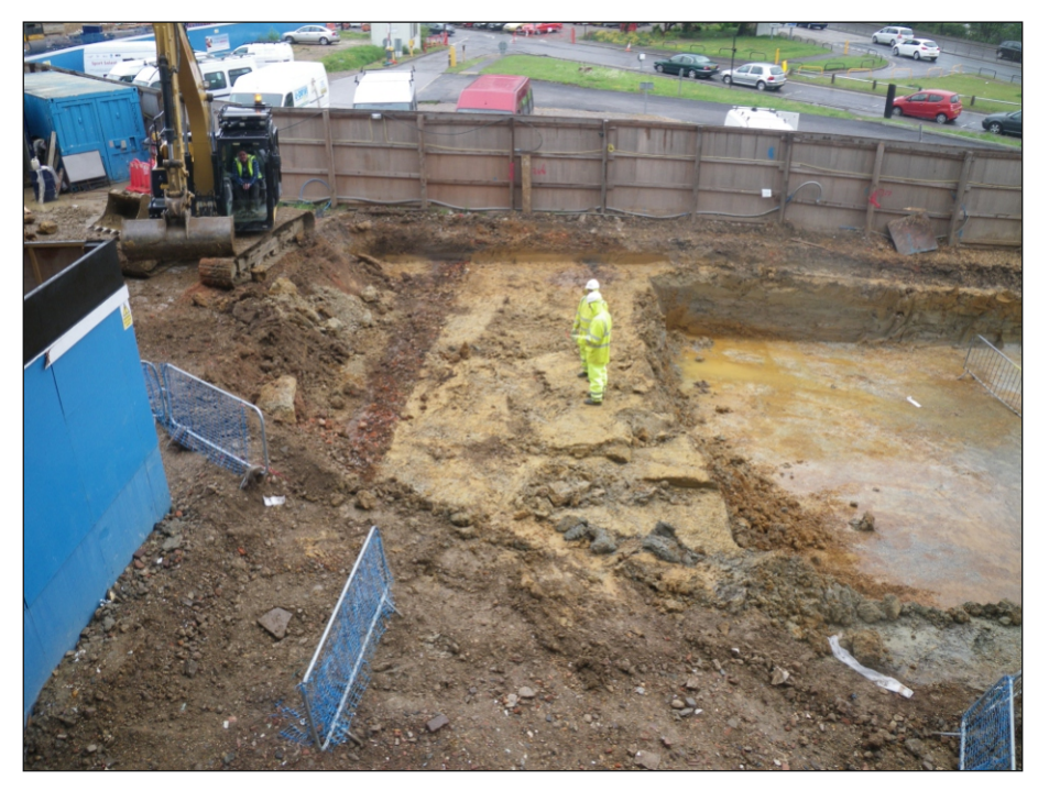
Plate 3: Ditch 1003