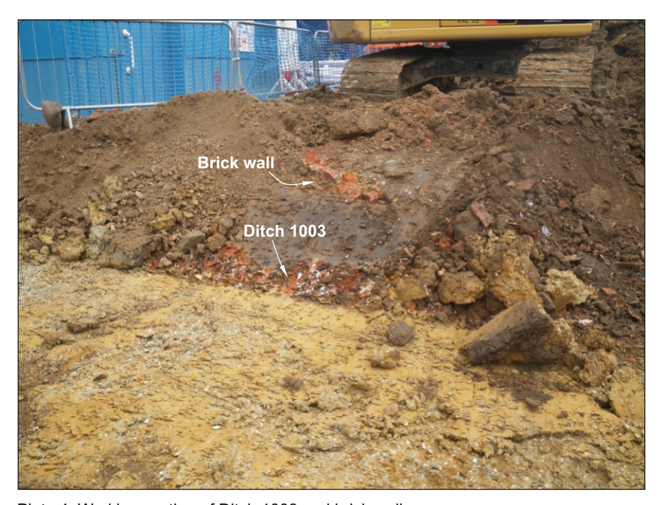
Plate 4: Working section of Ditch 1003 and brick wall