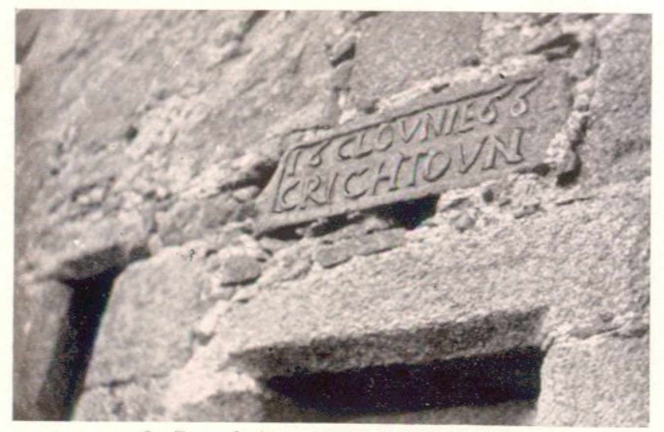
6. Carved stone panel with inscription.