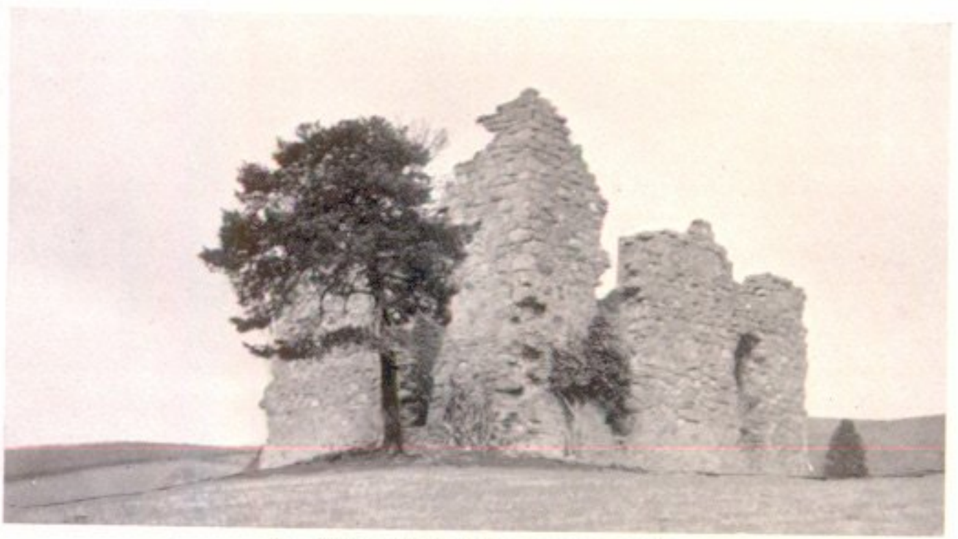
2. View from the south-east.