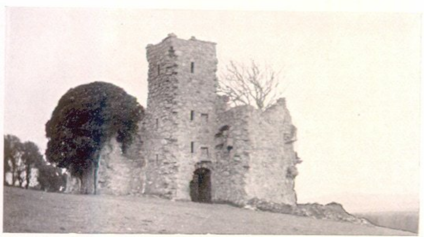
3. View from the north-west.