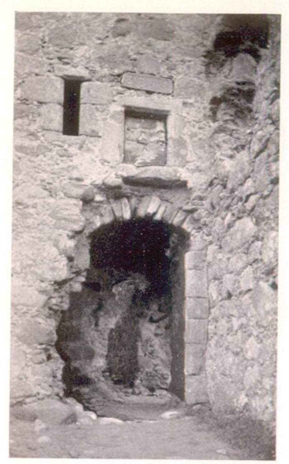
4. Entrance door with coat-of-arms recess and carved stone panel above.