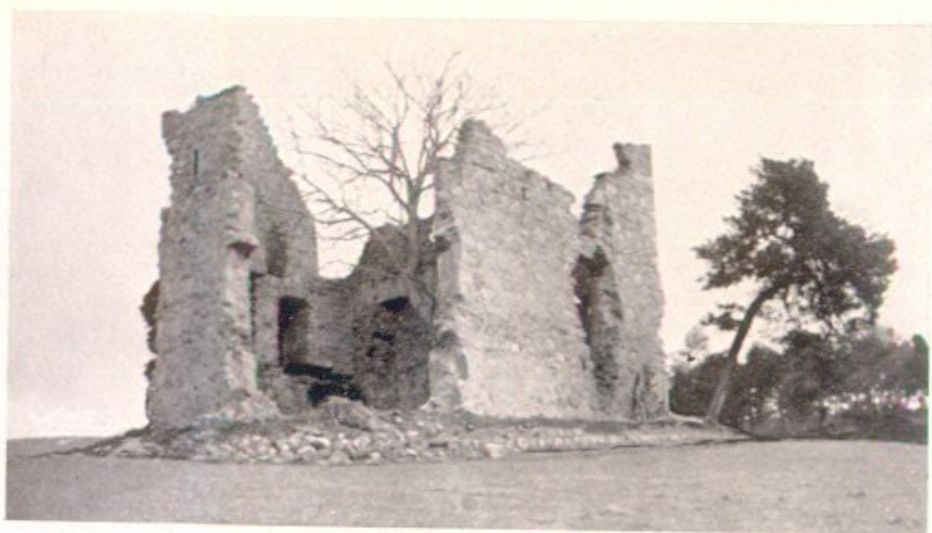
1. View from the south-west.