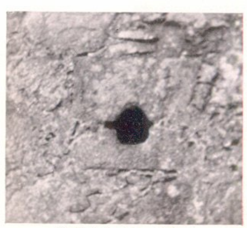
5. Detail of gun-hole.