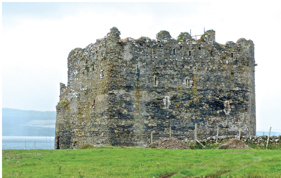
ILLUS 3 The castle from the land showing the blocked-up lancet windows