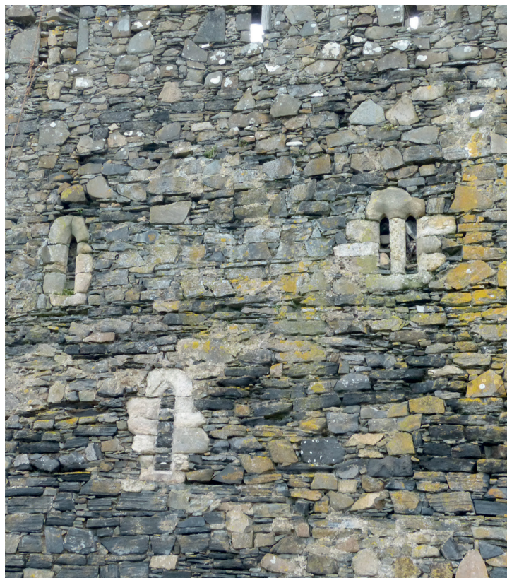
ILLUS 4 Lancet windows

that this had been MacDougall property for some considerable period' (Addyman & Oram 2012: para 2.3). The full text of the enactment is given here: