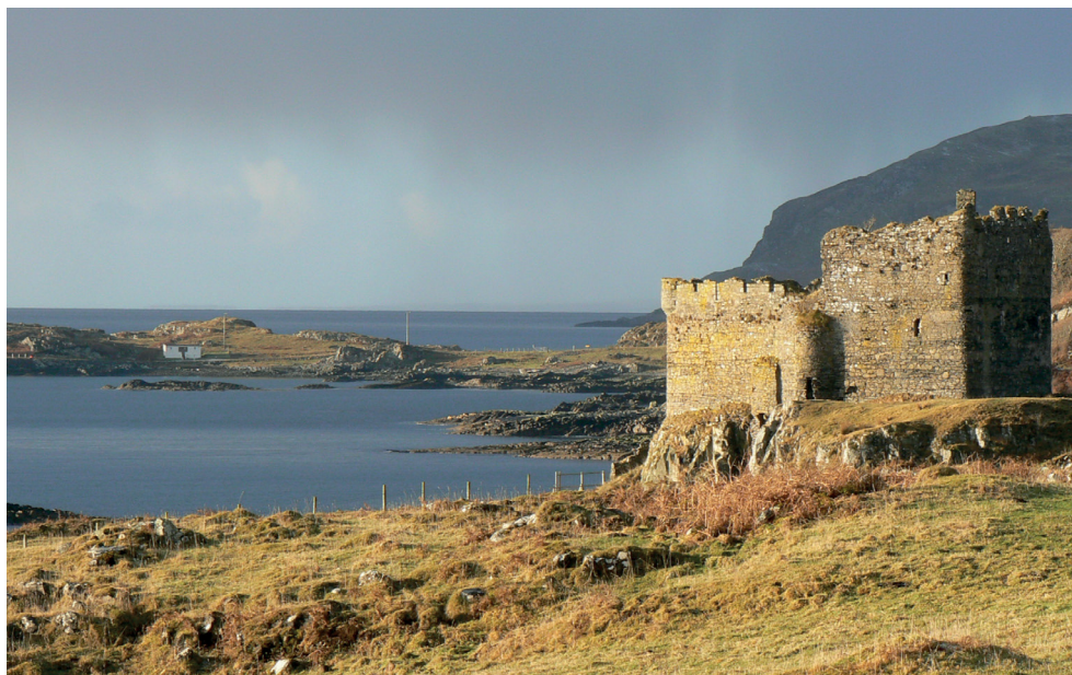
ILLUS 1 The castle looking west. Coll and Tiree are dim profiles on the horizon