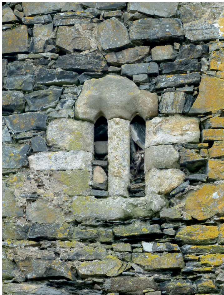
ILLUS 5 Double lancet window