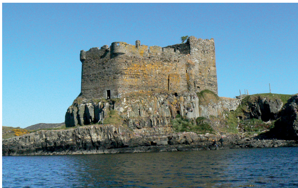
ILLUS 2 The castle on its rock, showing the sea gate and battlements with their two bartizans at the seaward angles of the curtain wall