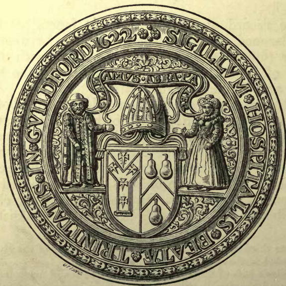
SEAL OF THE HOSPITAL OF THE HOLY TRINITY, GUILDFORD.

AUTOGRAPH OF GEORGE ABBOT, ARCHBISHOP OF CANTERBURY, ON A DEED DATED 30TH JAN. 1653, IN THE POSSESSION OF THE TRUSTEES OF THE HOSPITAL.