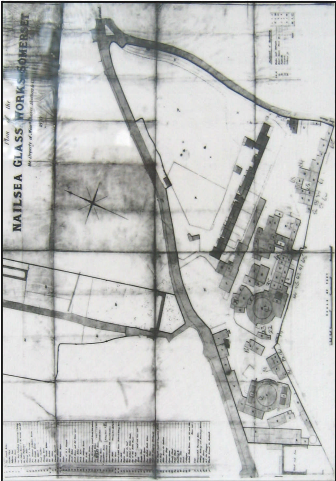
Figure 3.32: Photograph of a photograph of an another version of the 1870 plan