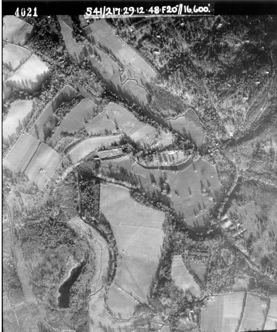
Fig. 2 - Air photograph taken in December 1948, showing the winding course of the River Wey at Waverley with the wooded countryside around. The lake of Waverley Abbey House is at the centre, and the ruins of Waverley Abbey lie by the trees to its south. The

filled in line of the anti-tank ditch can be seen crossing the open fields within the loops of the river, and, to the north, the ditch ran parallel with the river, cutting off its various smaller loops.