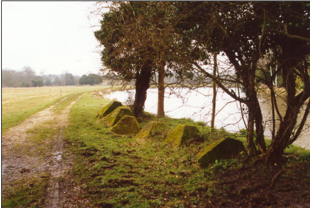
Waverley Abbey House lake. These once blocked the gap between the end of the anti-tank ditch and Waverley Lane.