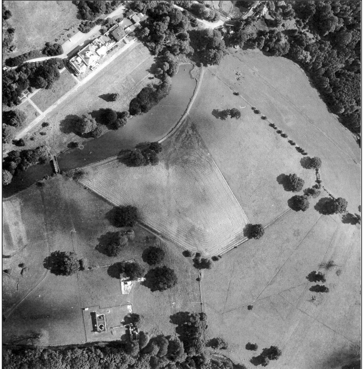
Fig. 4 - Air photograph taken in 1975. The course of the anti-tank ditch can be made out as it runs parallel with the southern edge of the Waverley Abbey House lake, turning at a sharp angle to pass to the east of the Waverley Abbey ruins [bottom centre].