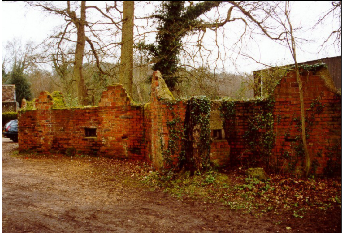
Fig. 5 - The loopholed wall [UORN 9983] pierced for rifle and LMG fire attached to an anti-tank gun emplacement [right -UORN 7207]. The castellations, formed roughly with brick and mortar, have been added to break up the line of the wall for camouflage purposes.

edge of the road, this group of defences protected the crossing of the B3001 road by the anti-tank ditch. The four roadblocks of the Stella Cottage defended locality, including one on Waverleymill Bridge, lay a few yards to the east. The defences here consisted of a large 2pdr. emplacement that survives in the garden of Stella Cottage [UORN 16756] commanding the bridge and the line of the anti-tank ditch beyond.