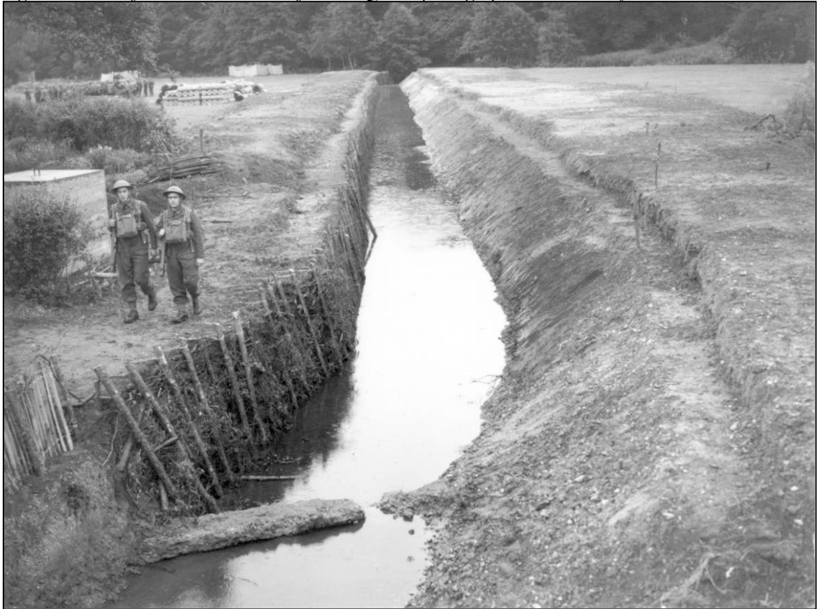
Fig. 3 - Section of the anti-tank ditch of the GHQ Line photographed on 24th July 1940: the location

is not Waverley Abbey but is somewhere in the Farnham area.