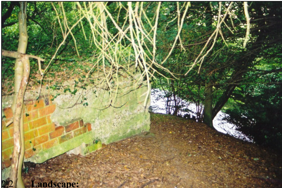
Waverley Abbey House lake. These once blocked the gap between the end of the anti-tank ditch and Waverley Lane.