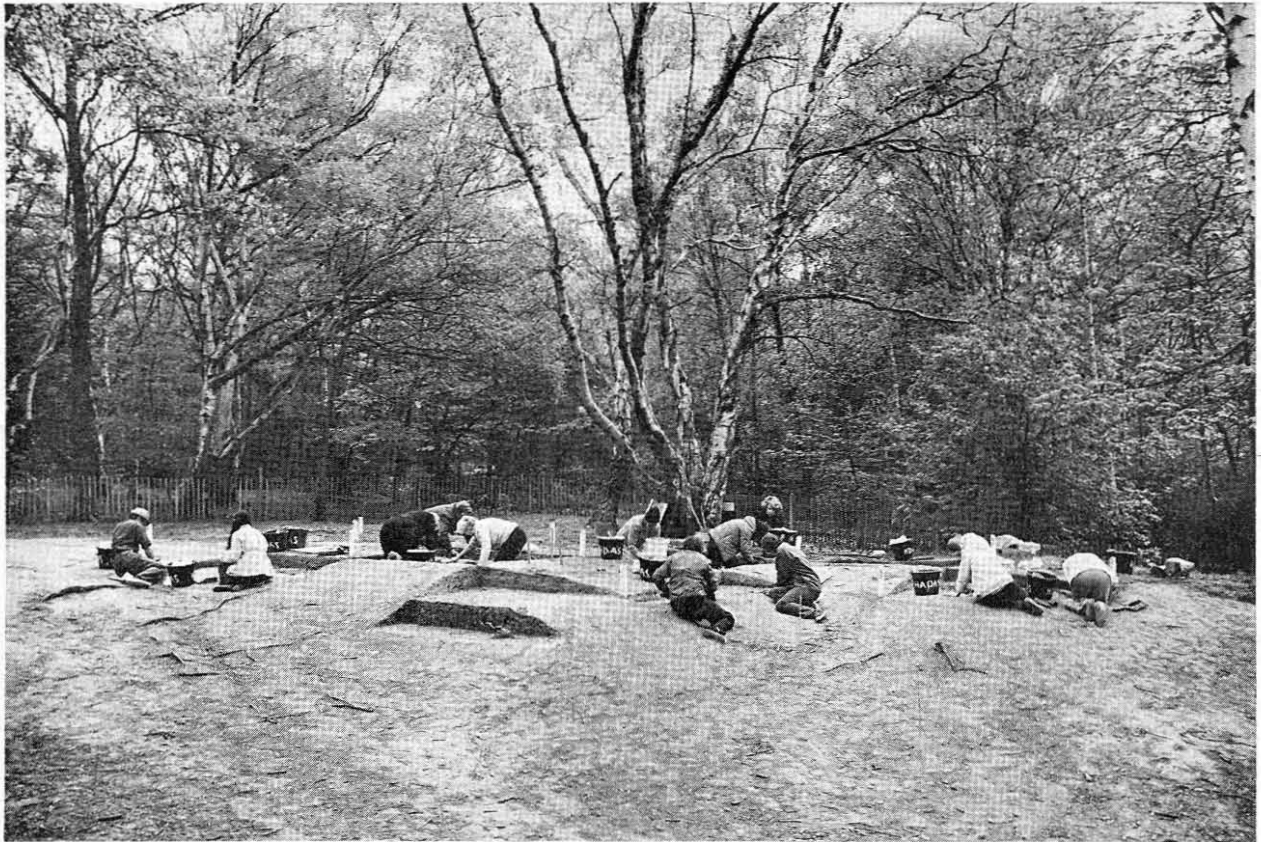
Fig. 1. West Heath dig, looking south-east.