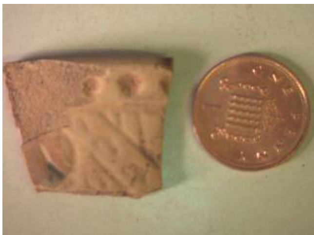
Figure 4 Unidentified Refined Whiteware

A single sherd of modern pottery was submitted. It appears to be a refined whiteware (WHITE) and is the weathered rim from a mug or cup with moulded decoration and traces of overglaze painting (Fig 4). A 19 th or 20 th -century date is likely.