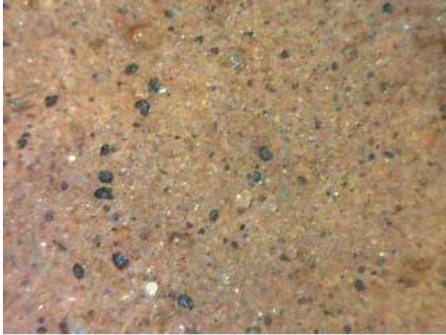
Figure 2 Crockerton ware (field of view approx 3.4mm wide)

The remaining post-medieval sherds are of South Somerset ware (SSOM). The closest source of this ware to Rode is at Wanstrow, 12 miles to the southwest of Rode but waste from that site does not include slipware and this, at least, may come from further south, for example Donyatt (Coleman-Smith and Pearson 1988), 50 miles to the southwest. There is no clear difference in fabric between the products of these two centres.