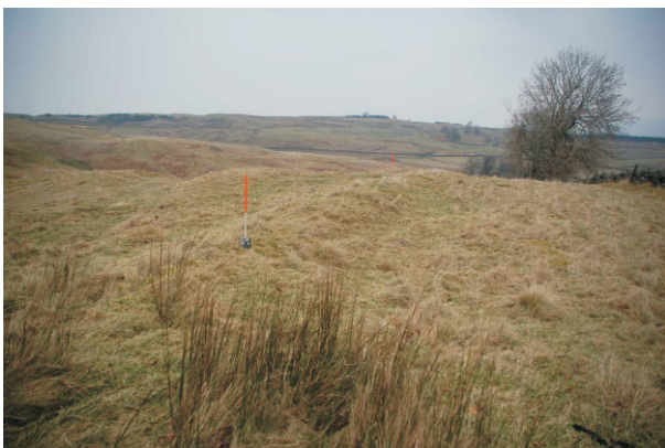
Shot of site 06 (bank)