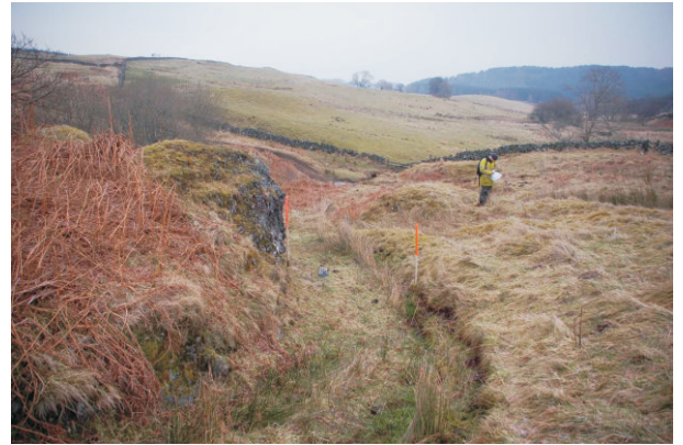
Shot of old track (03) near gullies (04)