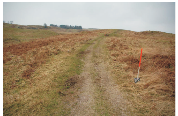
Shot taken where a modern track crosses the rig and furrow at site 09