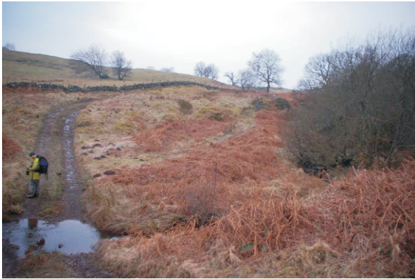
Shot looking at track (01) and gullies (04)