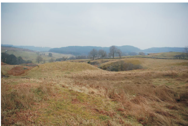
General shot looking down over the site on the NW side of the burn