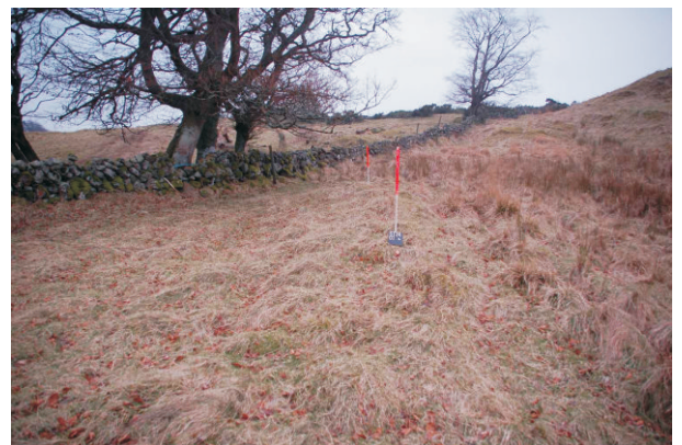
Shot of site 07 (bank)