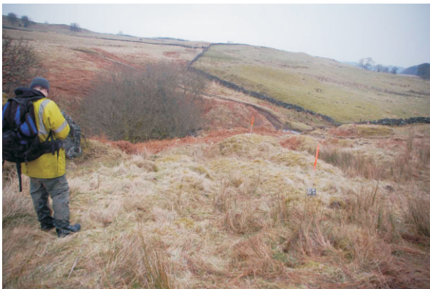
Shot recording gullies (04)