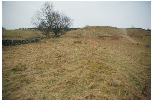
Shot of site 06 (bank)