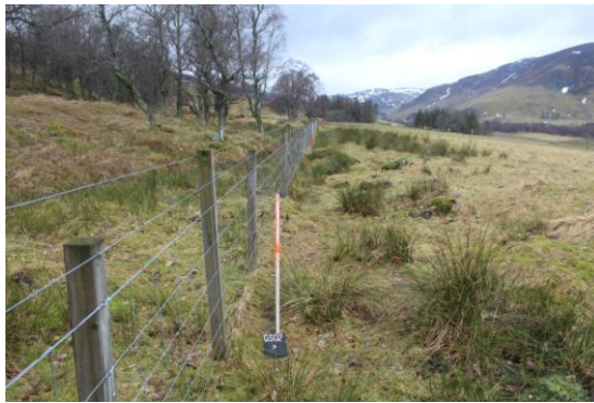
Wire fence, S site boundary