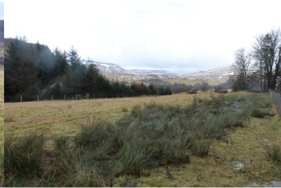
Ar Dachaidh and boulder cluster