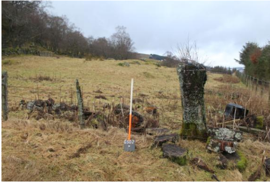
Site from E boundary