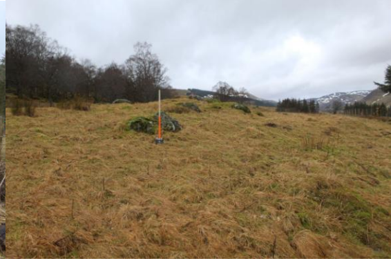
Boulder cluster, centre of site