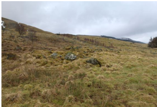
W end of pipeline corridor