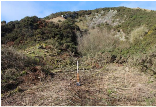
Shed location (02), in front of quarry