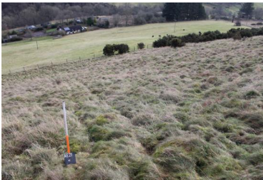
Drumcairn Farm, from above track