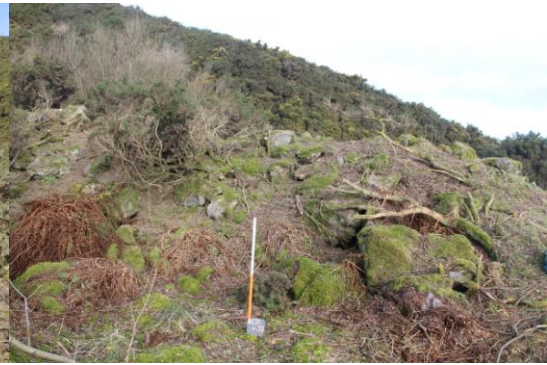
Blast rubble mounds in quarry (03)