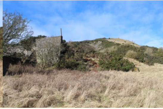
Quarry buildings and hillfort