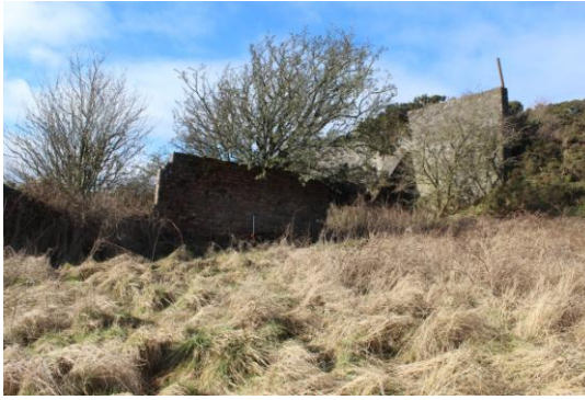
Quarry buildings (01)