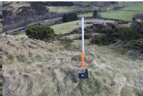
View above quarry from hillfort