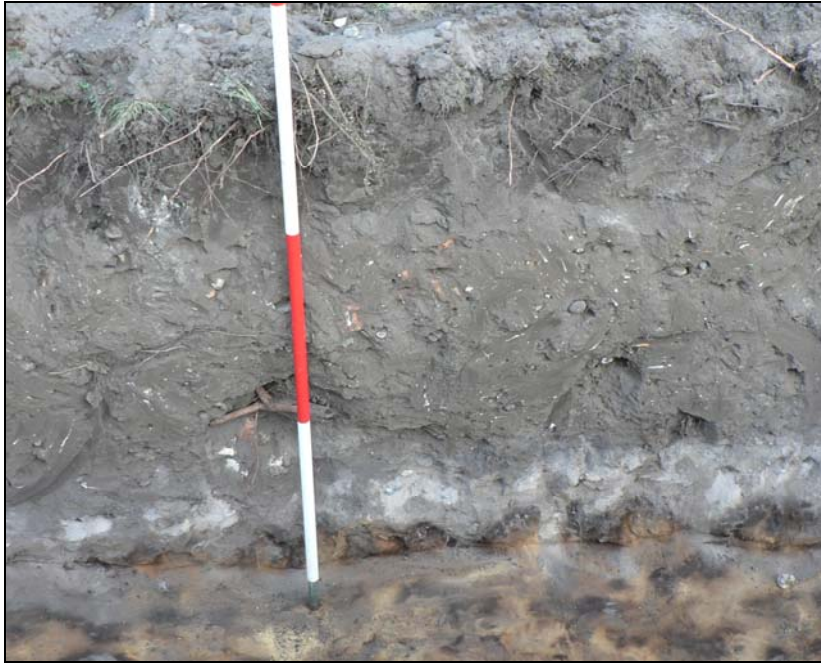
Deposit profile with upper dumped material, original topsoil & subsoil/leached sand subsoil at base