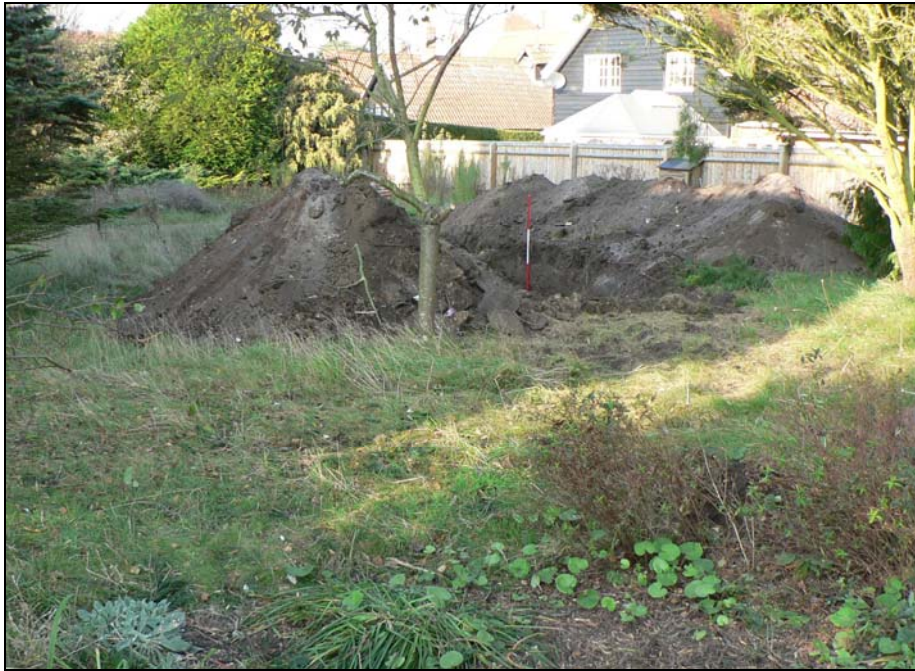
General view from south-east