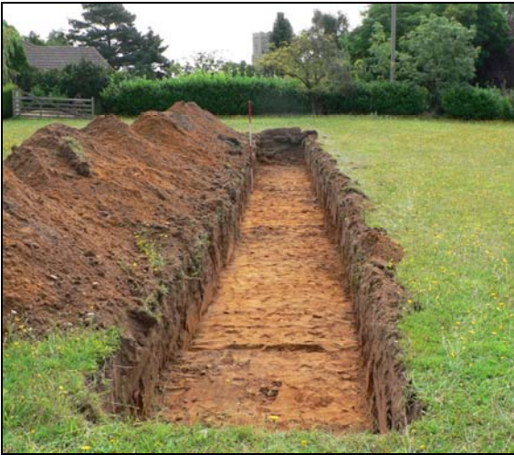
Trench from west (church in background)