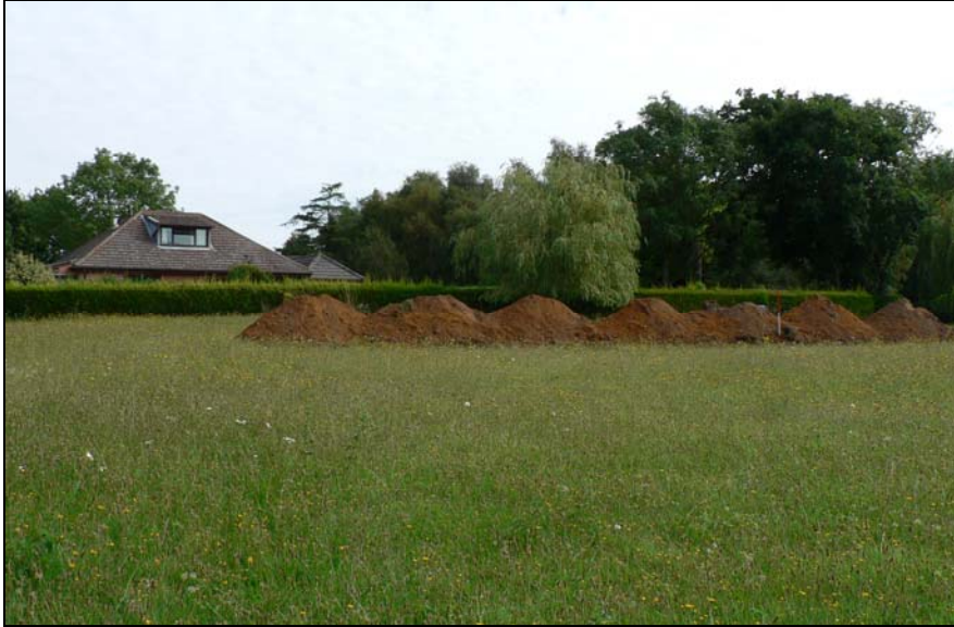
General view from south