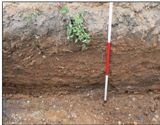
General deposit profile