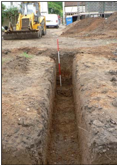
Central foundation trench from west