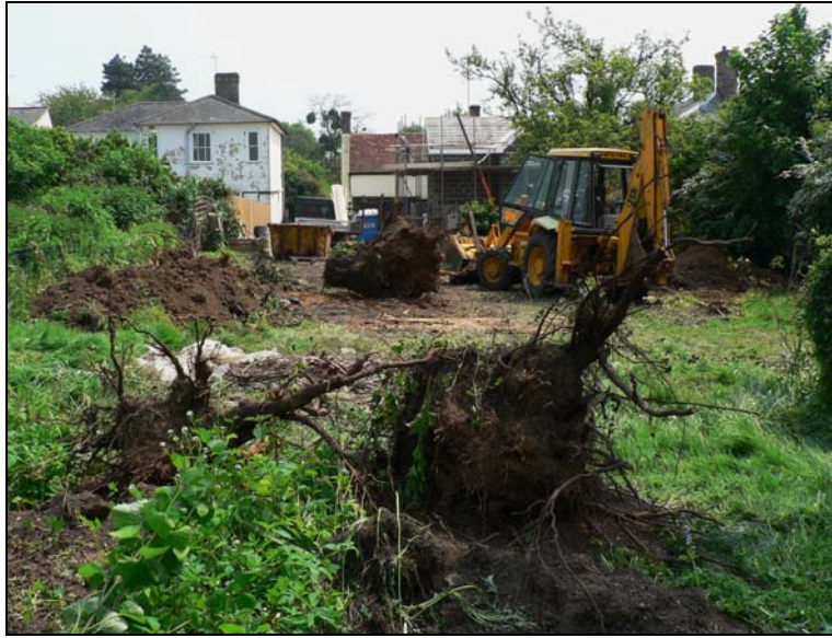
Site from north-west looking towards the High Street