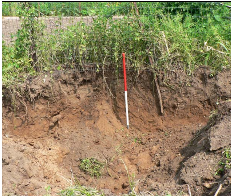
Removal of tree stump