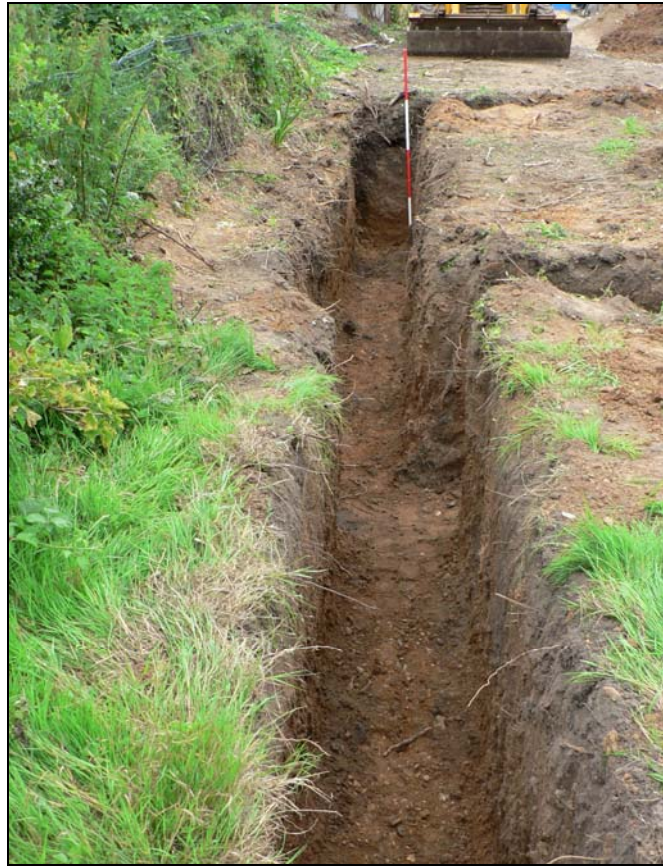
Northern foundation trench