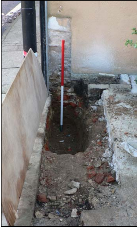
Eastern trench from west (fully exc.)