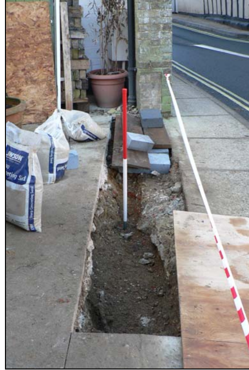
Western trench from east (fully exc.)