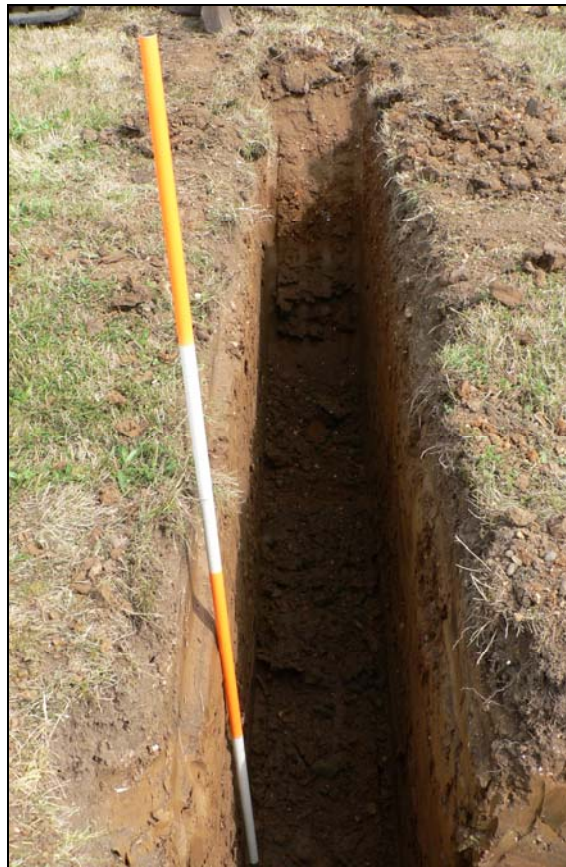
Central trench from south