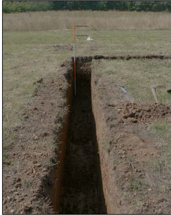
Southern foundation trench from east