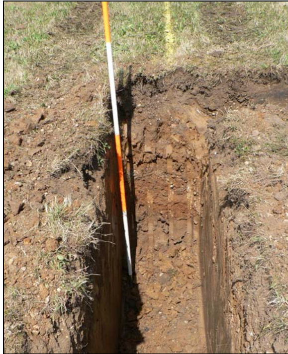
Deposit profile at north-western corner of foundations