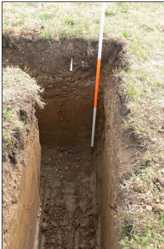
Deposit profile mid way along southern side