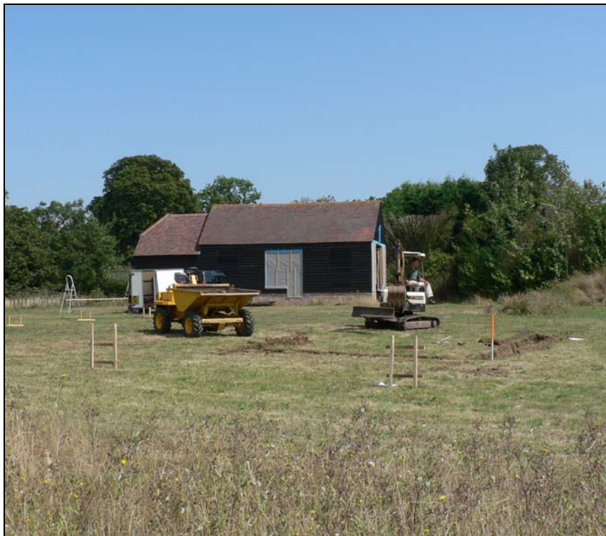
General view from south-west