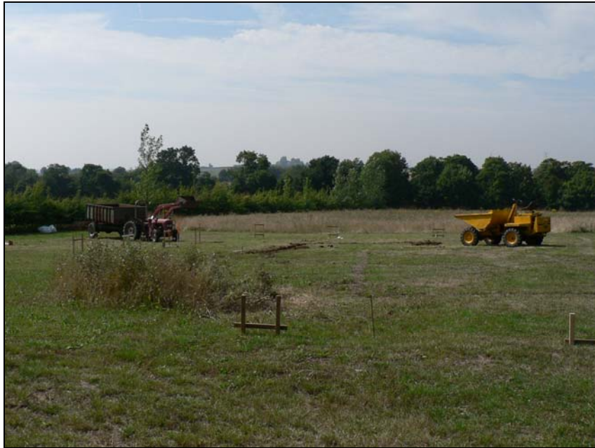
General view from north-east looking towards the Asheldham Brook