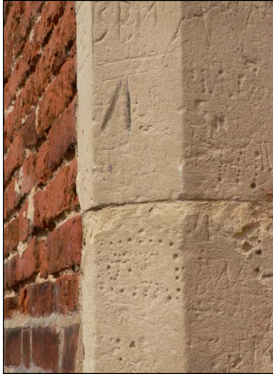
Graffiti on lower part of western door jamb