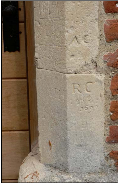
Graffiti on eastern door jamb