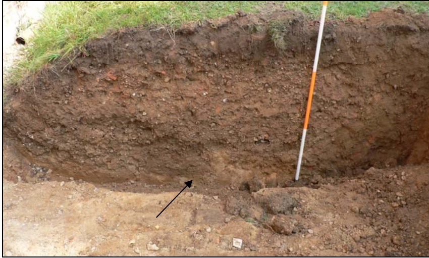
Eastern section of raft foundation with grave cuts in lower part (arrowed)