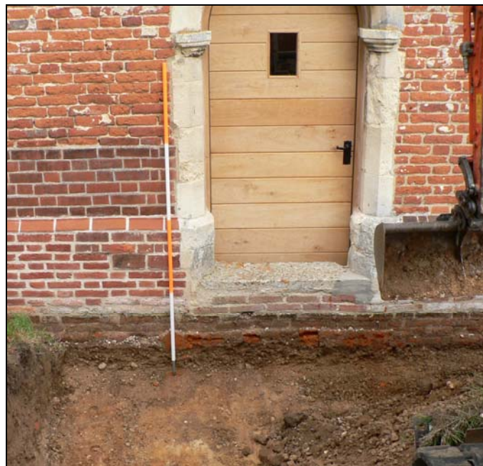
Detail of blocking at base of south door (re-opened later 20 th C)