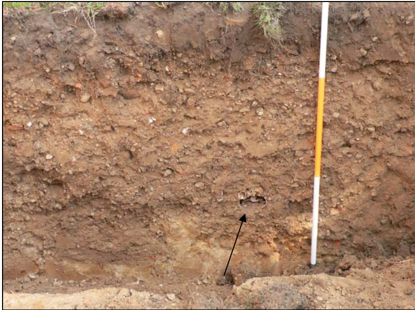
Eastern section with arrow to skull revealed