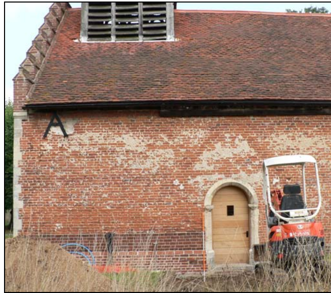
Area of former south porch from south (note roof line indication for demolished porch)