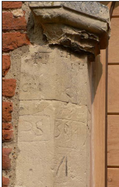
Graffiti on upper part of western door jamb