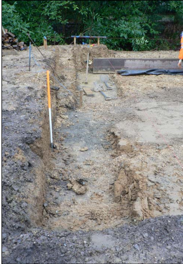
Western side of raft foundation from south