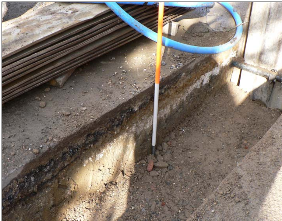
Service trench crossing road to the east of the new build area