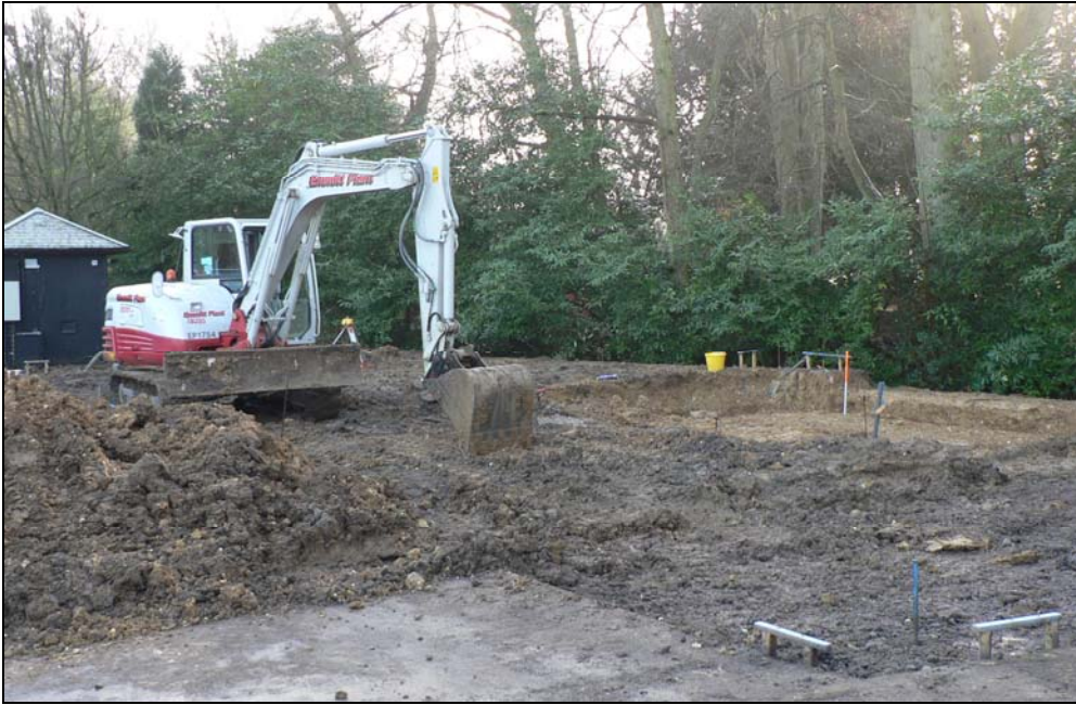
General view from south-east