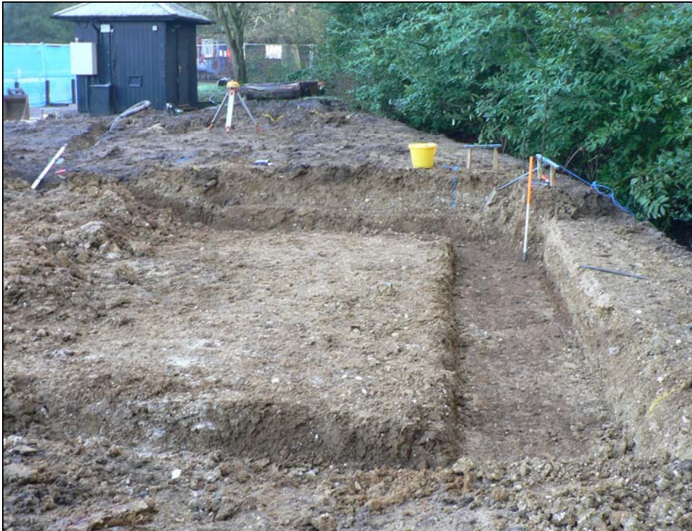
Raft foundation with deeper toe on northern side of build area from east