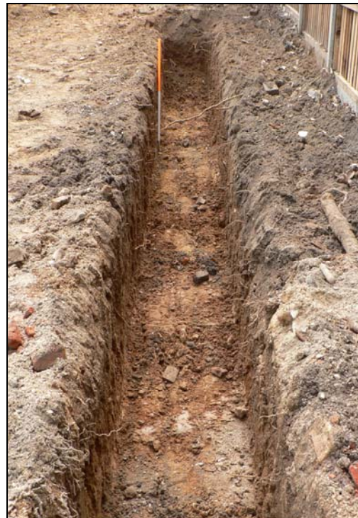
Western trench from north