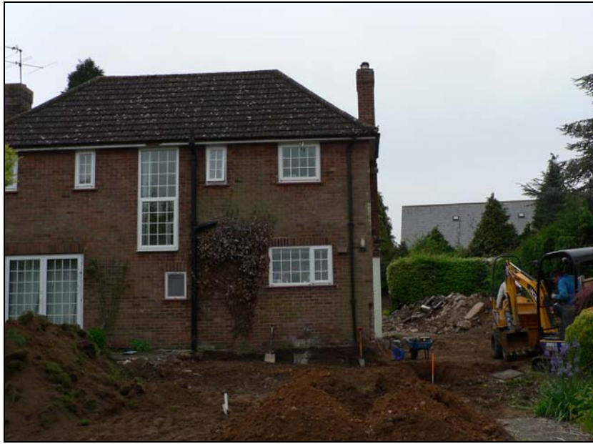
Site from north