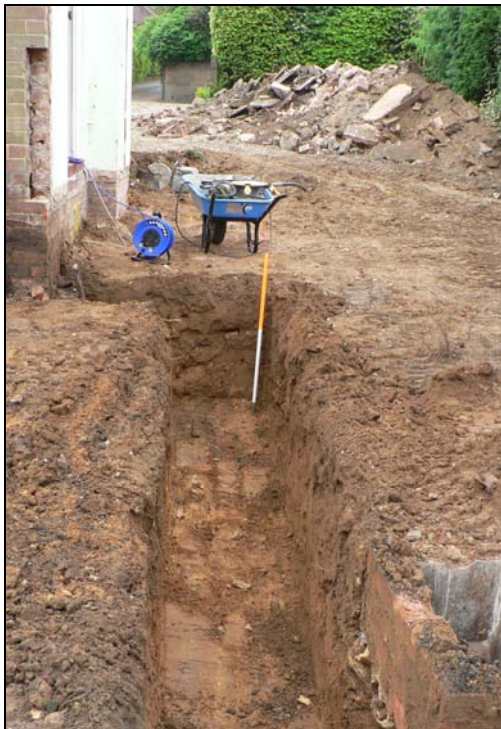
Eastern trench from north