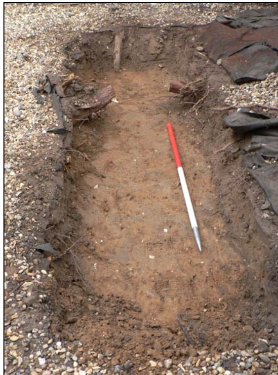
Northern trench from west