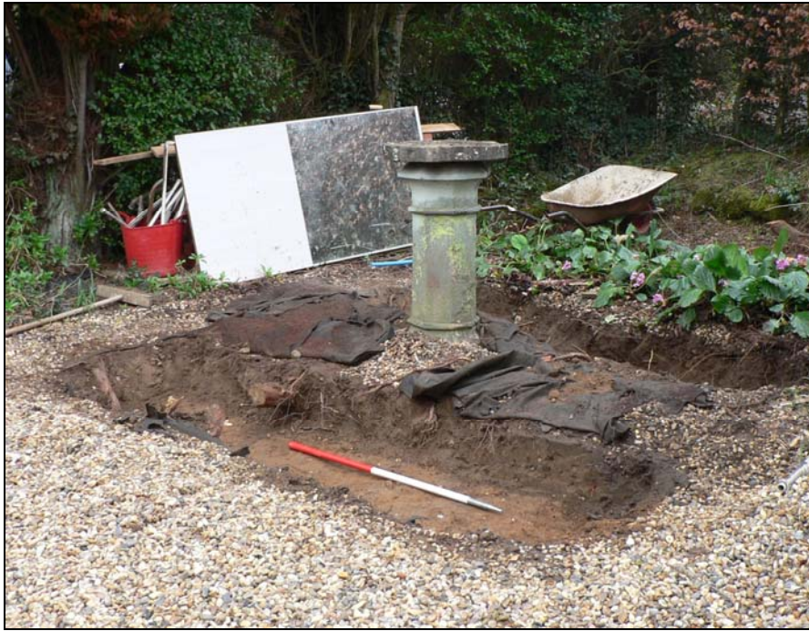
General view of garage site from northwest