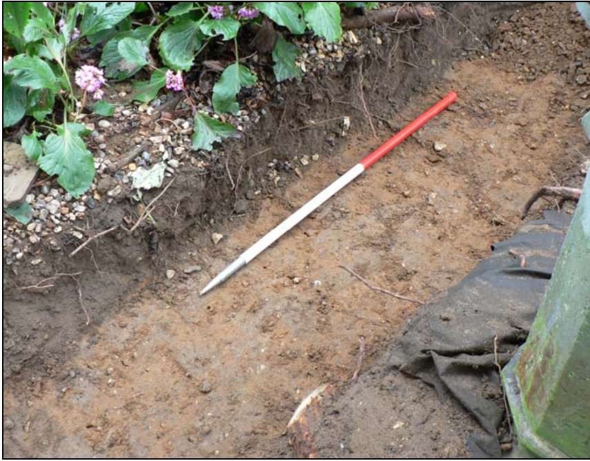
Southern trench from northeast