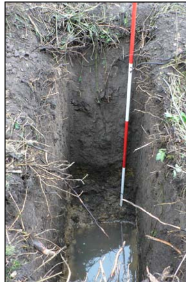
Southern test pit