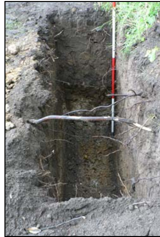
Northern test pit