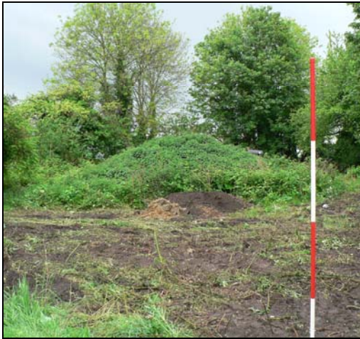
General view from south