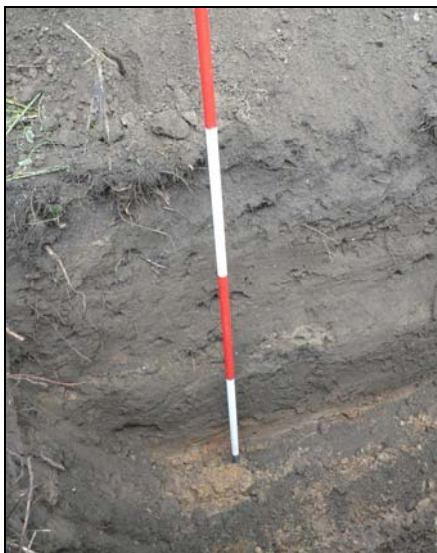
Central test pit