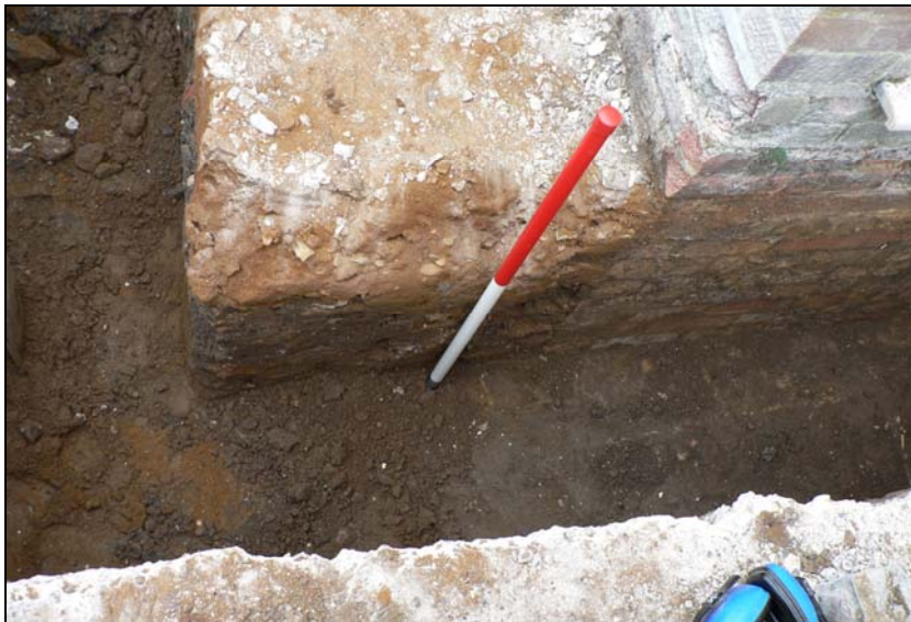
Foundation trench from north-east