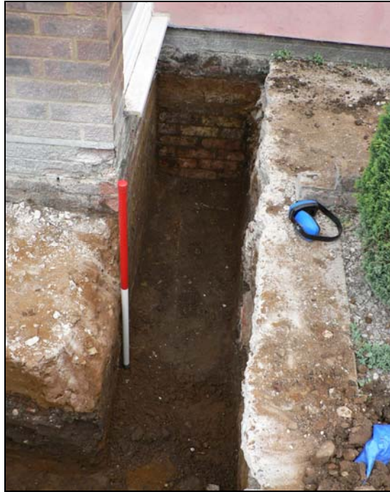
Foundation trench from east