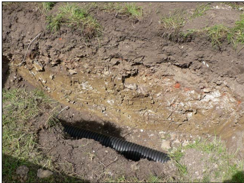
Trench deposit profile in paddock to west of Dairy House