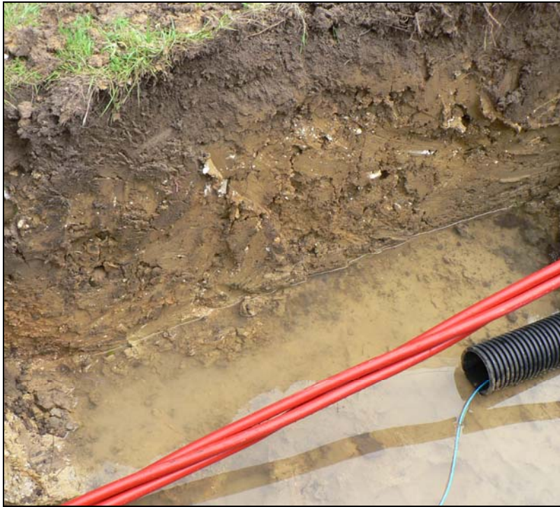
Trench deposit profile at southern end of scheme