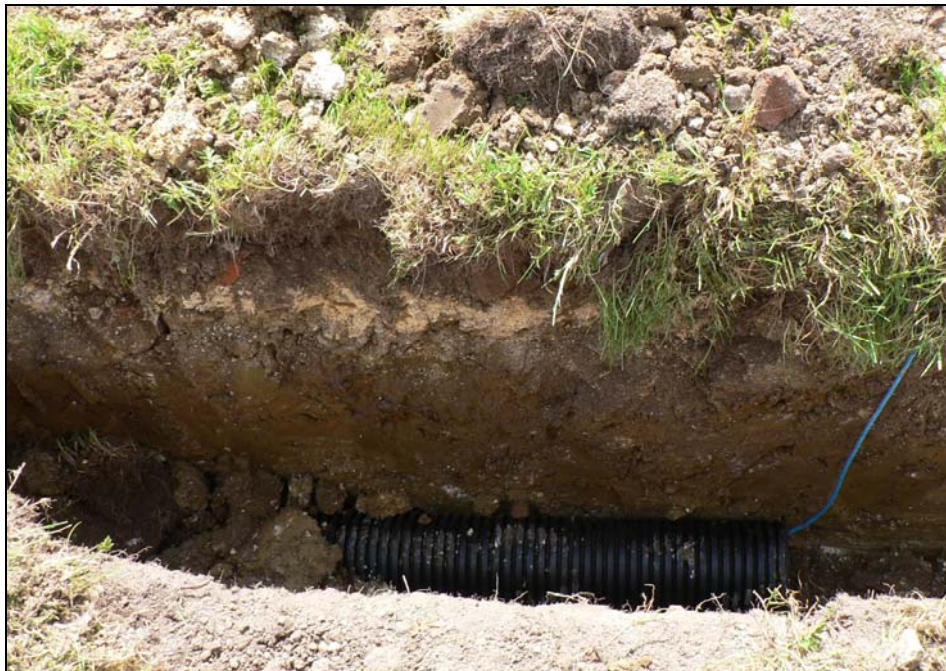
Trench deposit profile south of Dairy Cottages (with layer in section below topsoil)