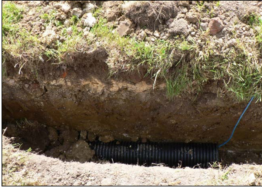
Deposit profile behind Dairy Cottages with chalk deposit