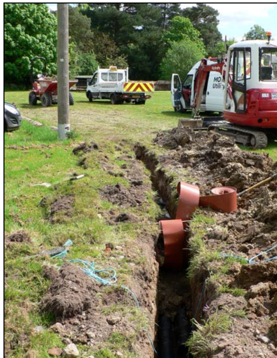
Trenching behind Dairy Cottages