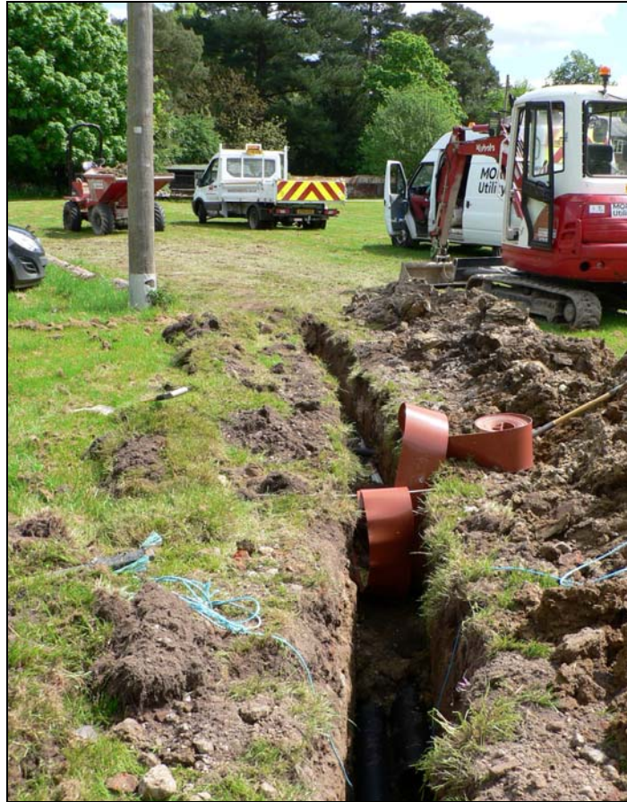
Trenching south of Dairy Cottages