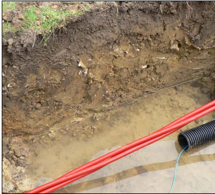
Deposit profile at southern end