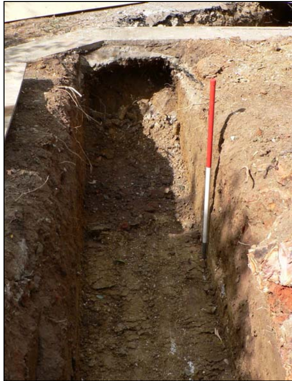
Trench from west