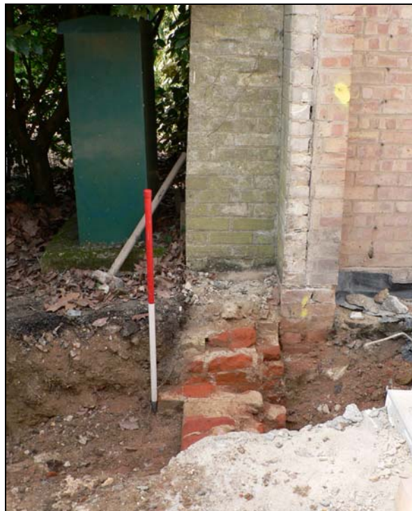
19 th century wall foundation from northeast on former garden boundary wall alignment with eastern wall to former mid 20 th century garage block to right