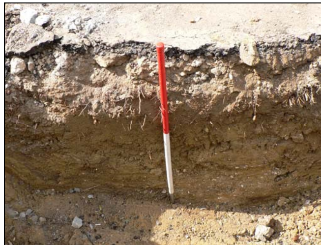
Trench deposit profile