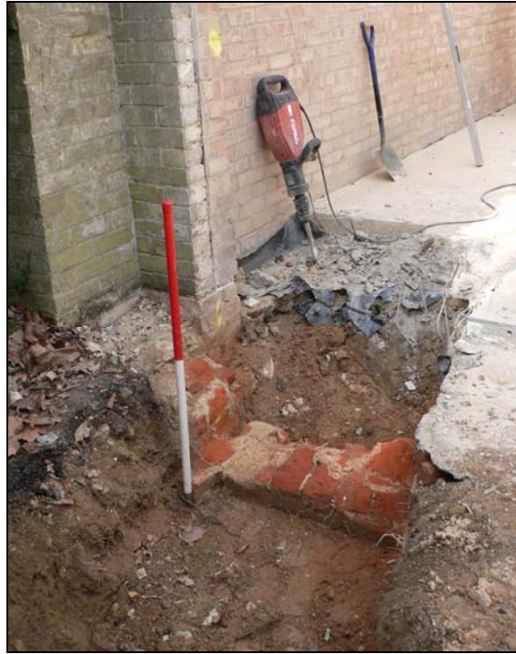
19 th century wall foundation from northwest just outside east wall of former mid 20 th century garage block