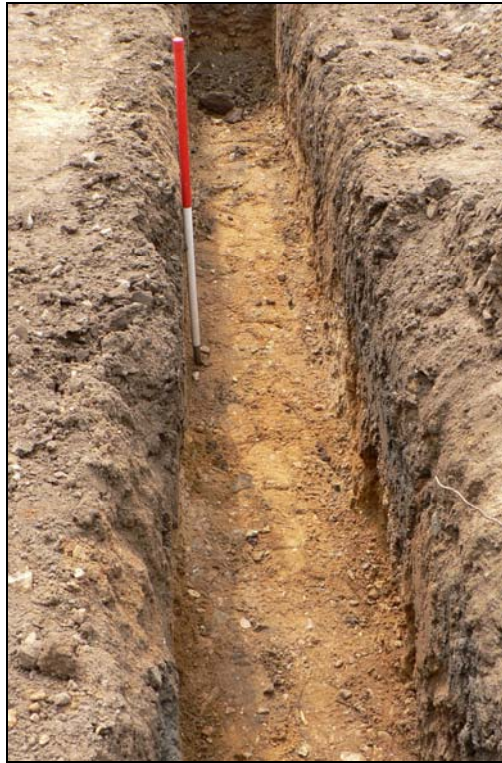
Southeastern foundation trench from south