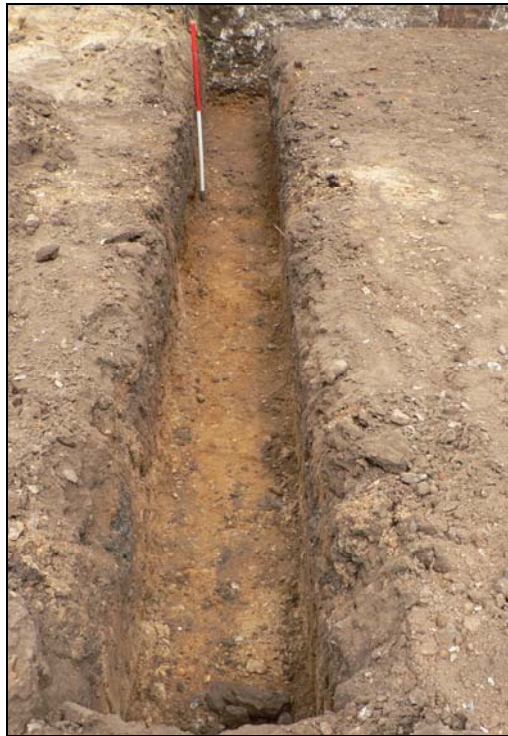
Southwestern foundation trench from east