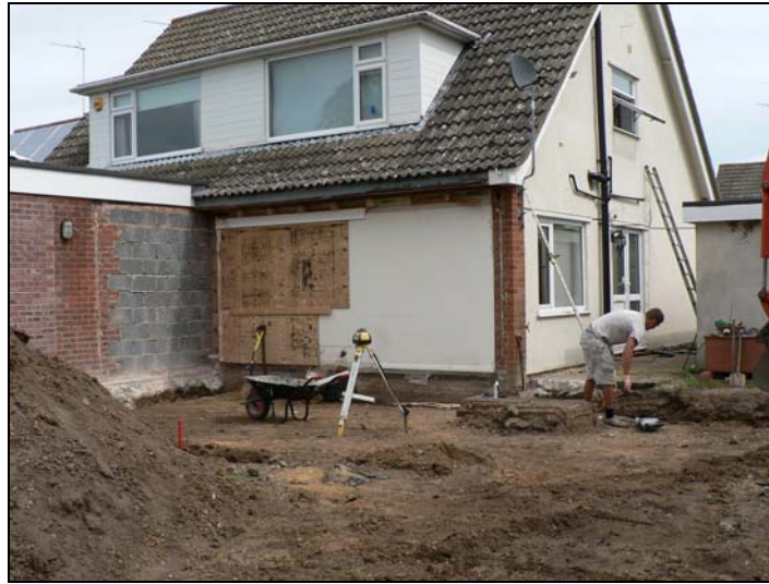
General view from southeast