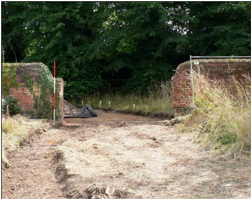
Wall blocking removed from north