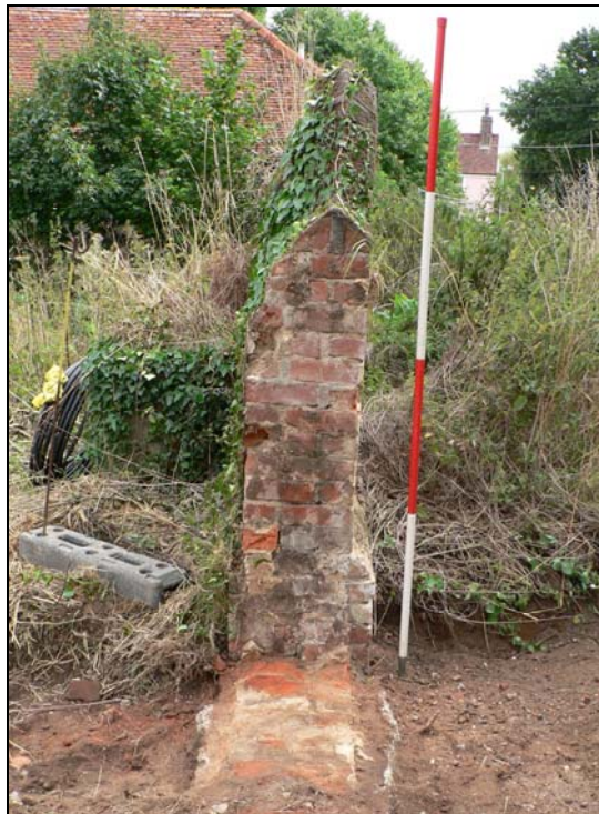
Western end of wall after removal of blocking