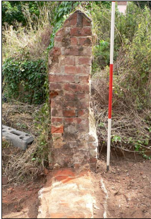
Eastern end of wall after removal of blocking