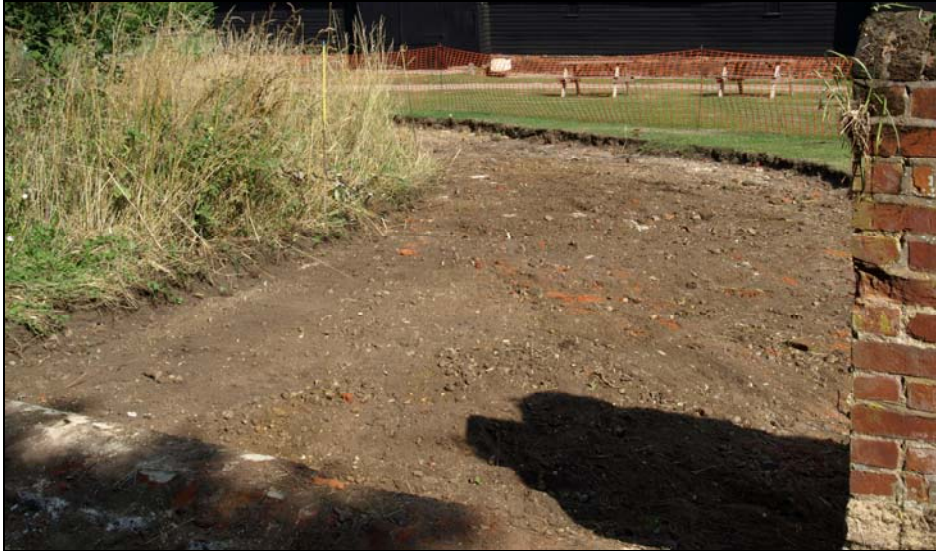
Soil stripped track area to north of wall