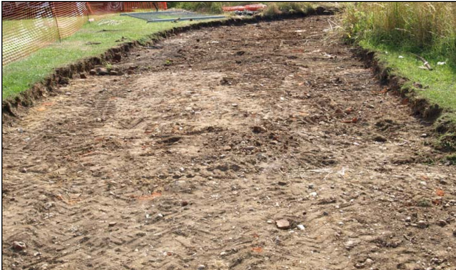
Central part of soil stripped track in yard from west