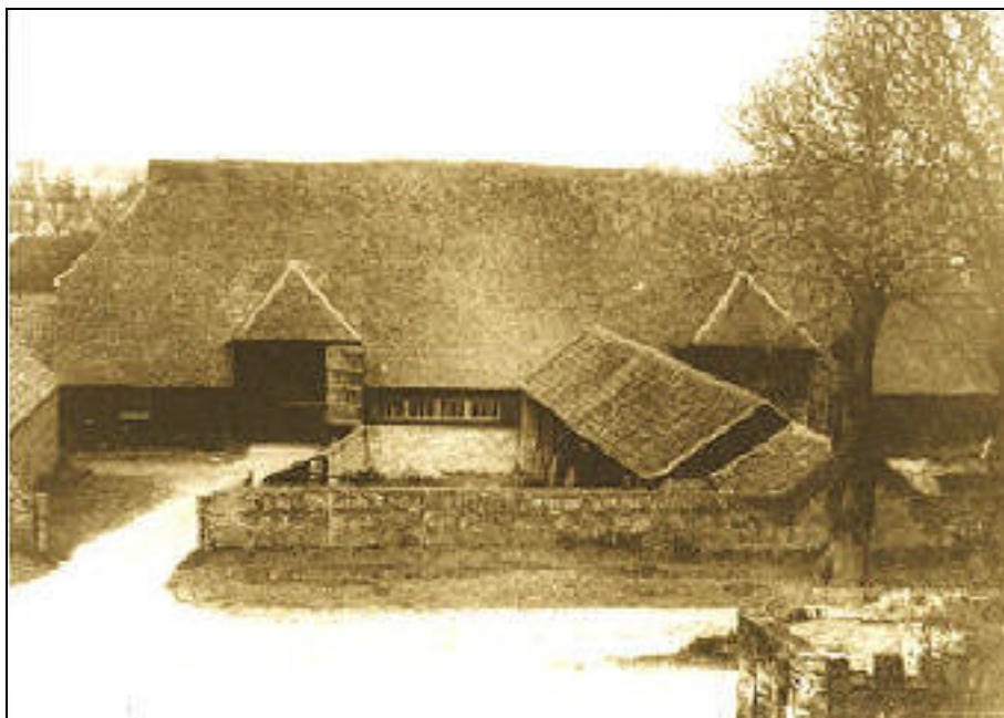
Frontispiece: Grange Barn from south in the late 19 th /early 20 th century period showing the now demolished range of farm buildings to the left of the tree