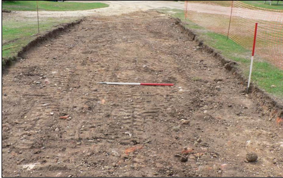
Western end of soil stripped track from east