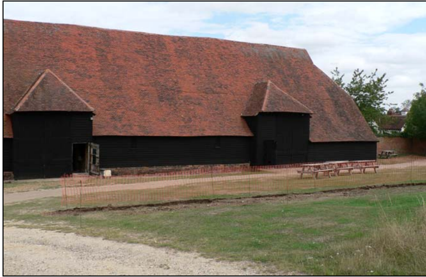
General view of barn from southwest