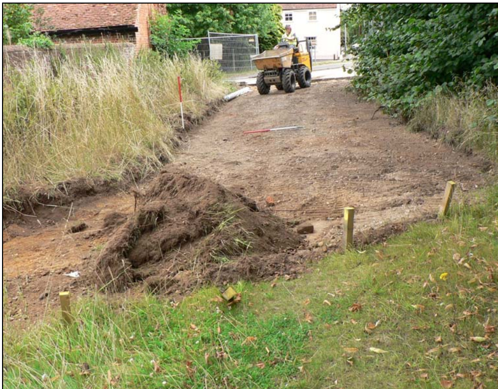
Soil stripped track area to southeast and outside yard wall