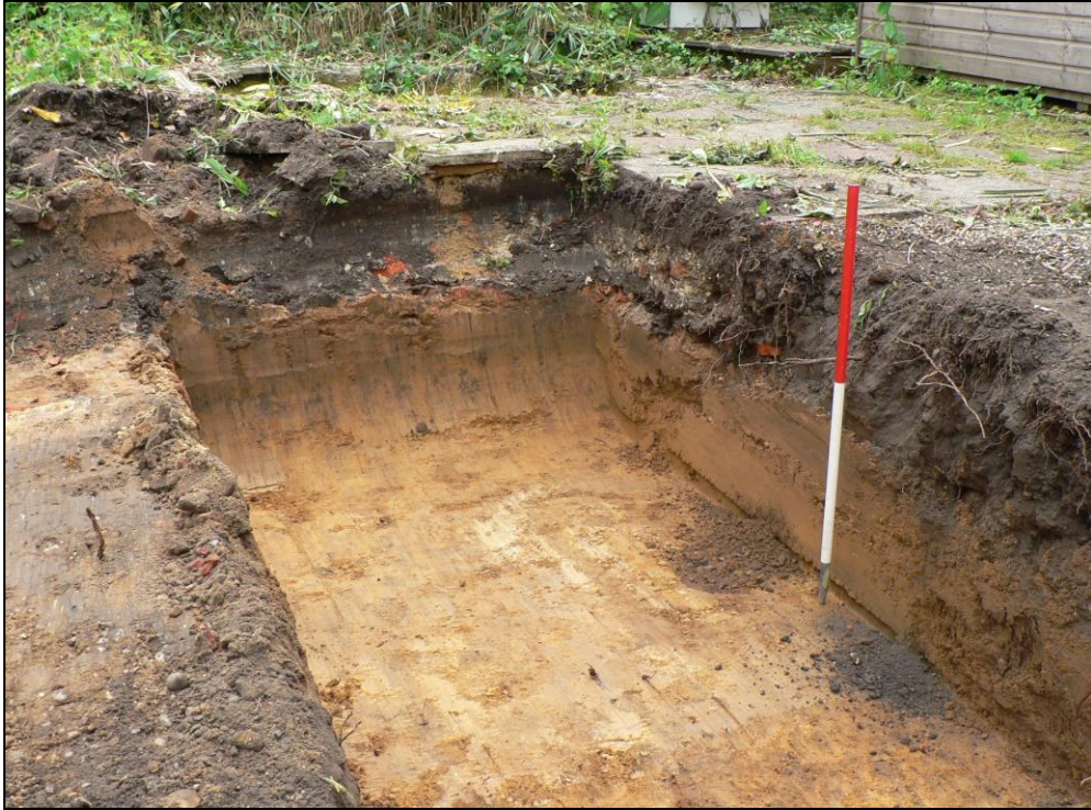
Trench deposit profile with brick foundation debris at base of topsoil