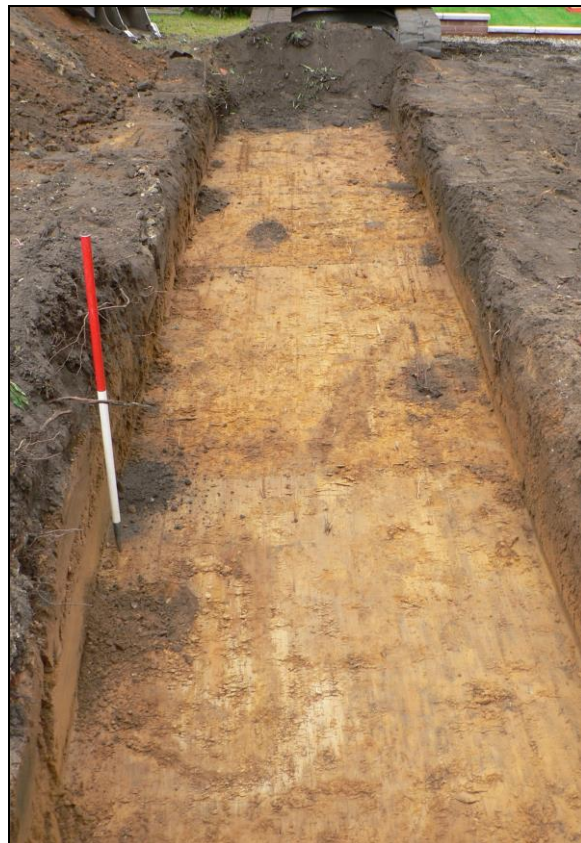
Trench to rear of new dwelling from east