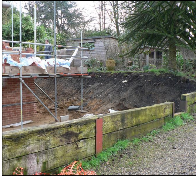
General view from southwest with exposed edges around terraced area