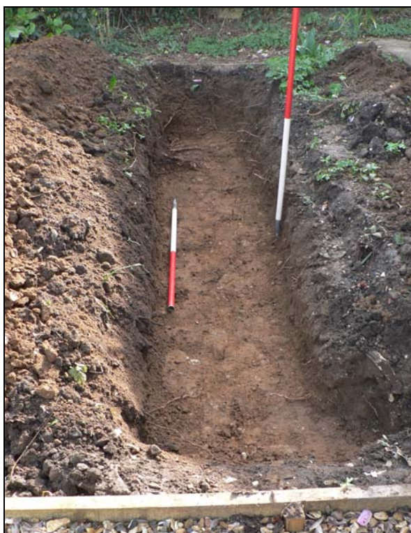
Trench from west