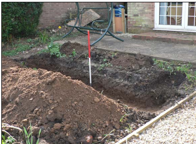
General view of evaluation trench for eastern extension from northwest