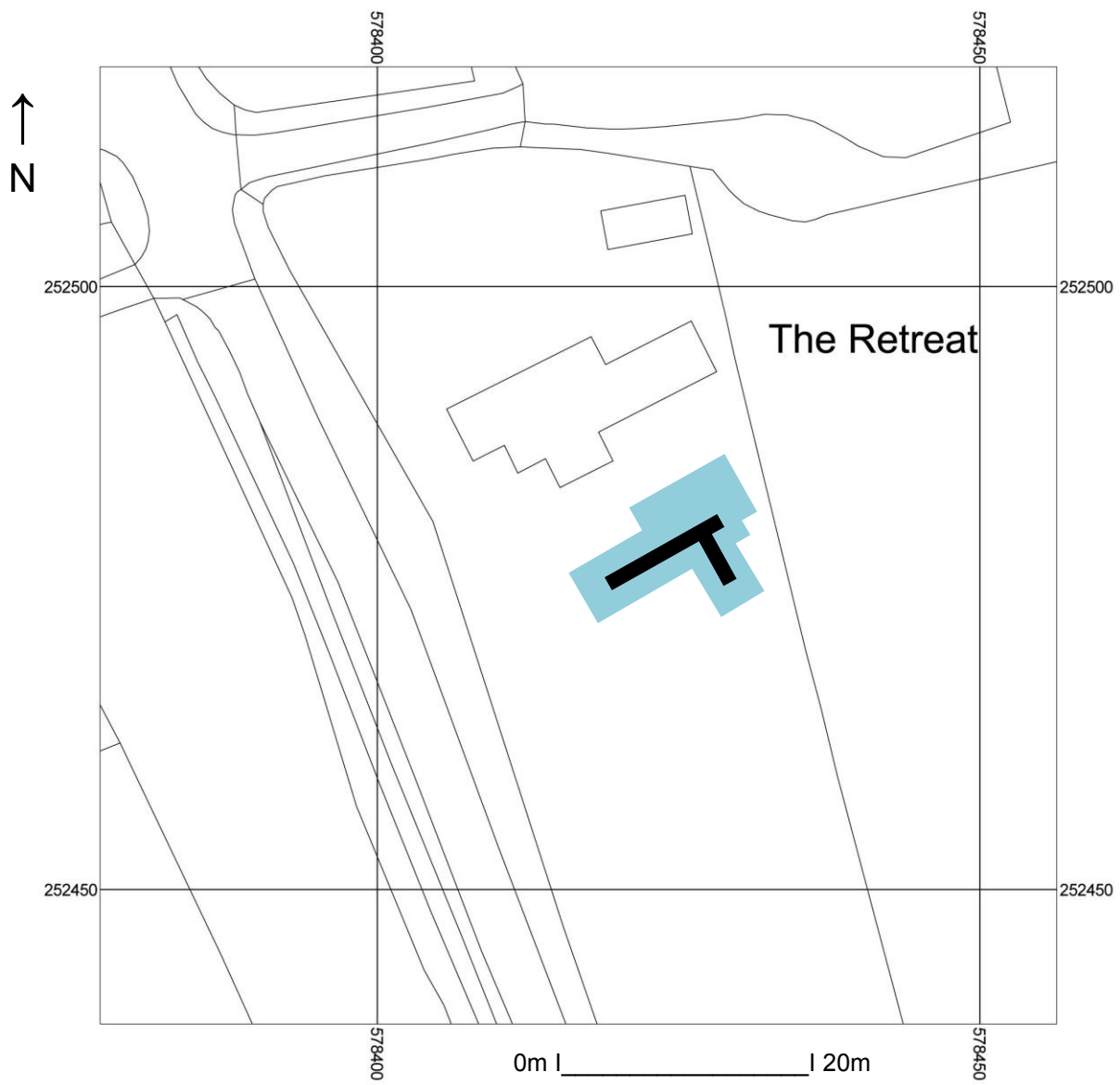
Fig. 2: Location of evaluation trenches (light blue- new dwelling footprint)