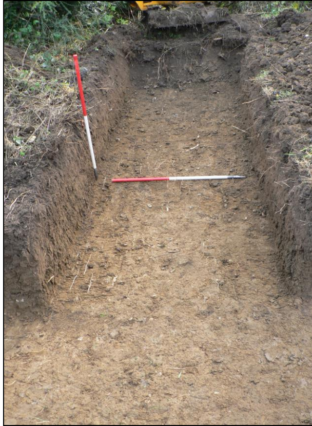
Short trench from south