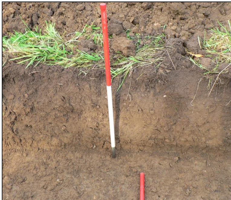
Trench deposit profile