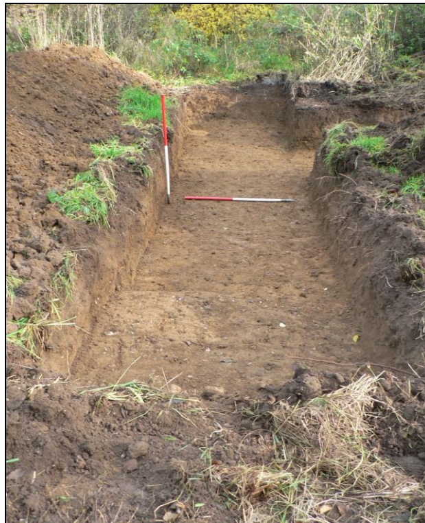
Long trench from west