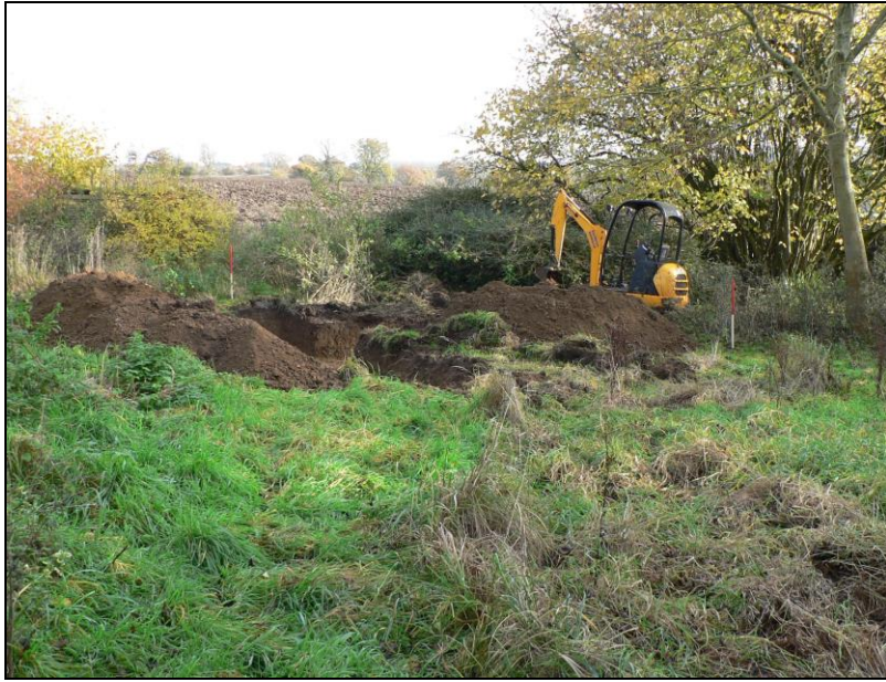
General view from northwest