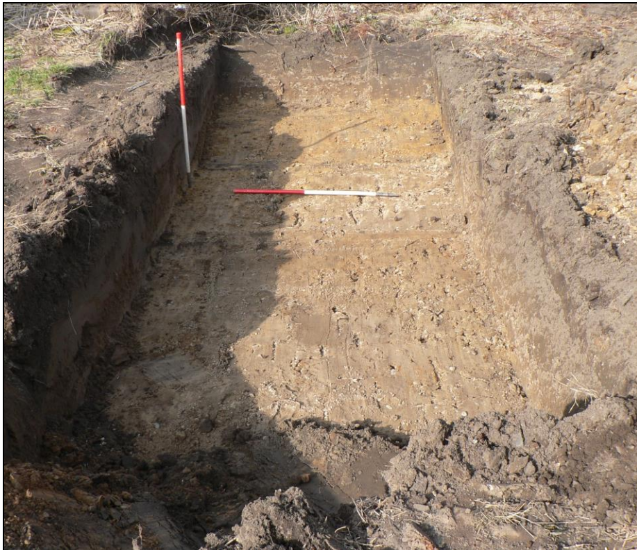
Trench 6 from south