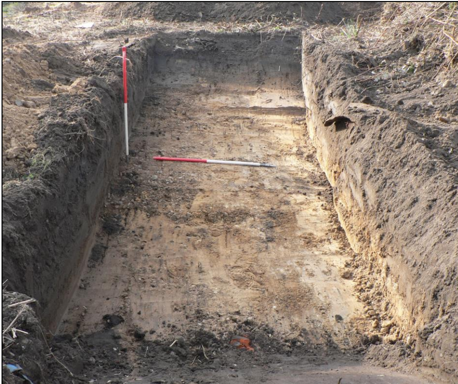
Trench 10 from west