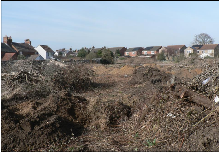
General view from southeast