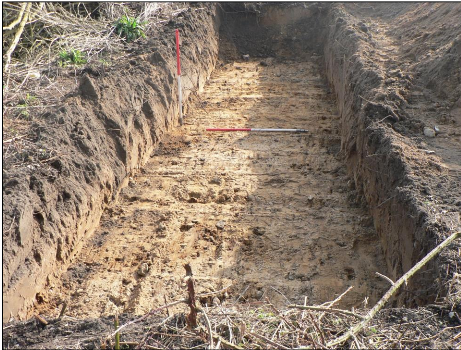
Trench 8 from south