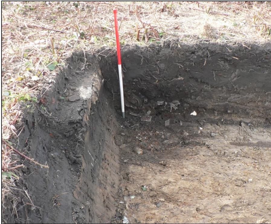
Pit in SW corner of trench 1 (20 th C date)