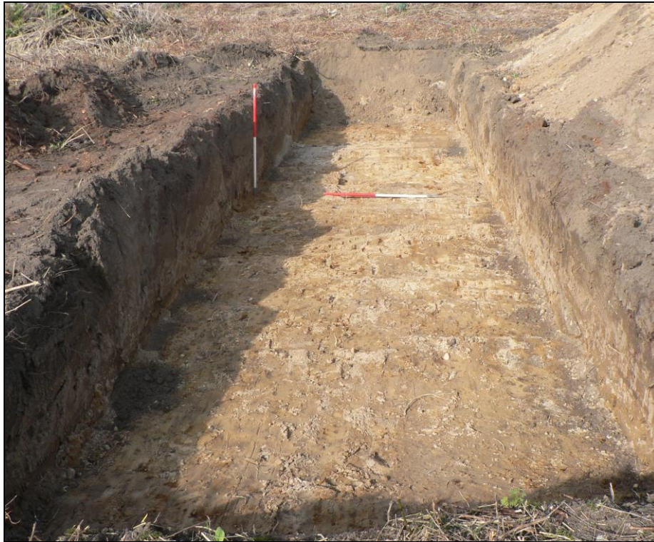
Trench 3 from south