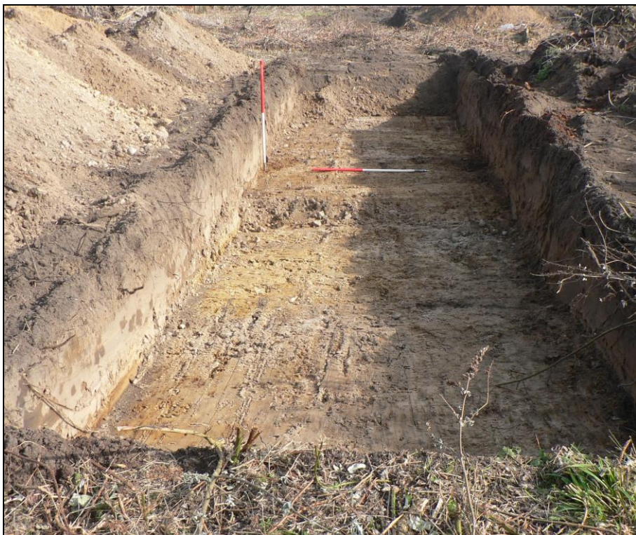
Trench 2 from east