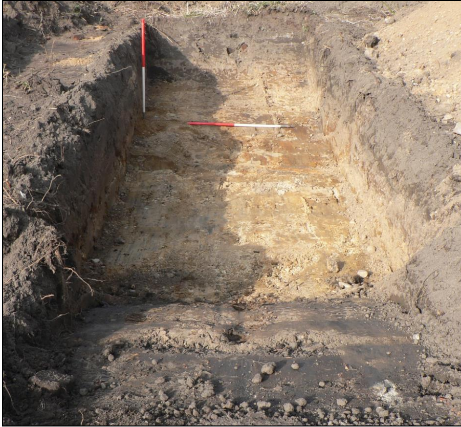
Trench 5 from east