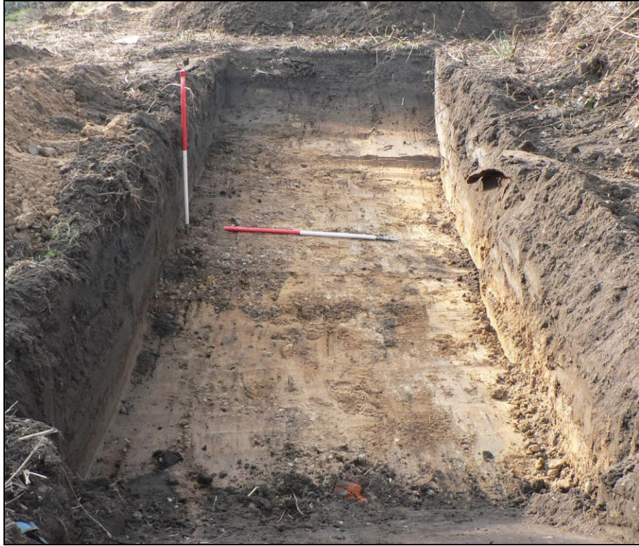
Trench 7 from east