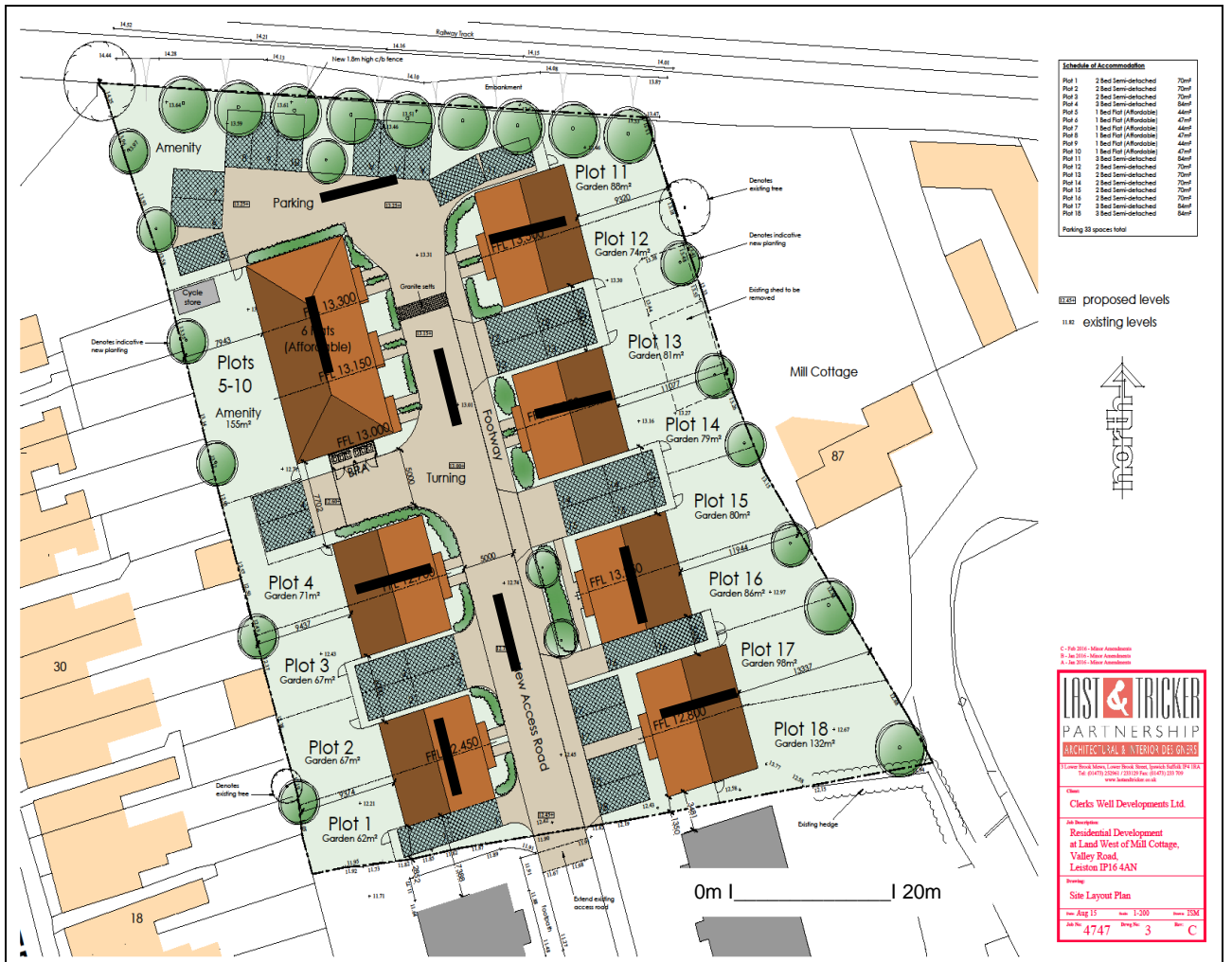
Proposed location of trial trenches (10 x10m)