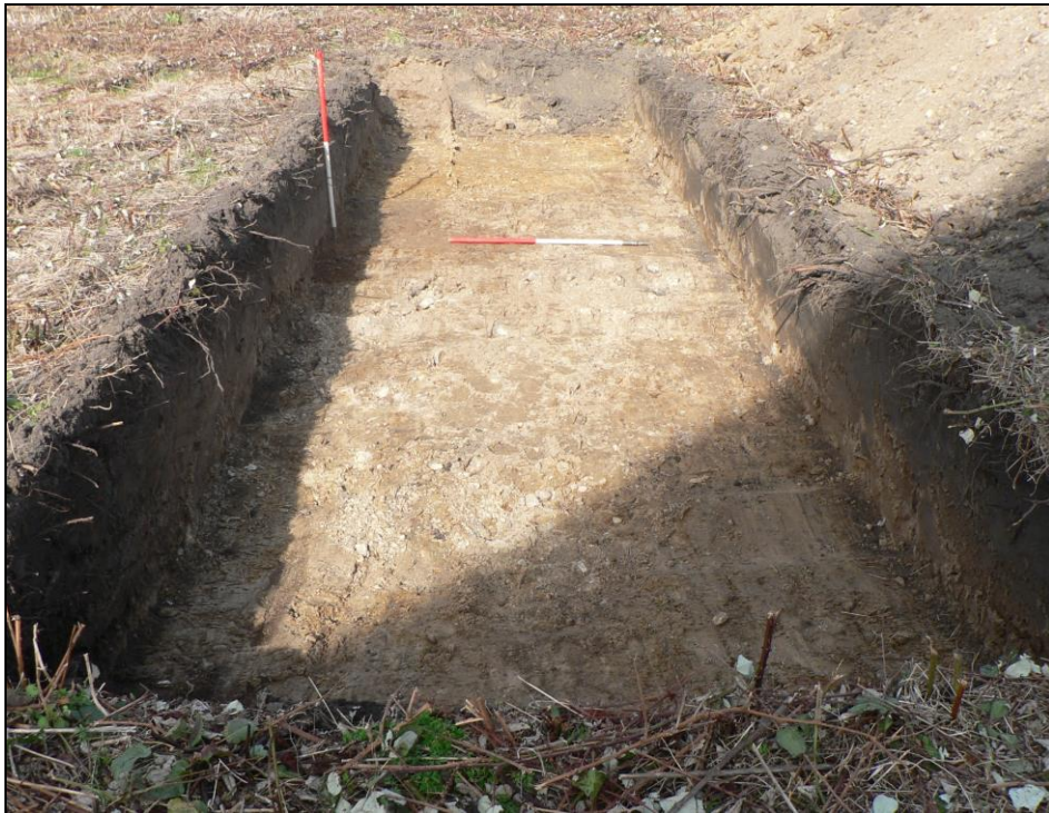
Trench 1 from south