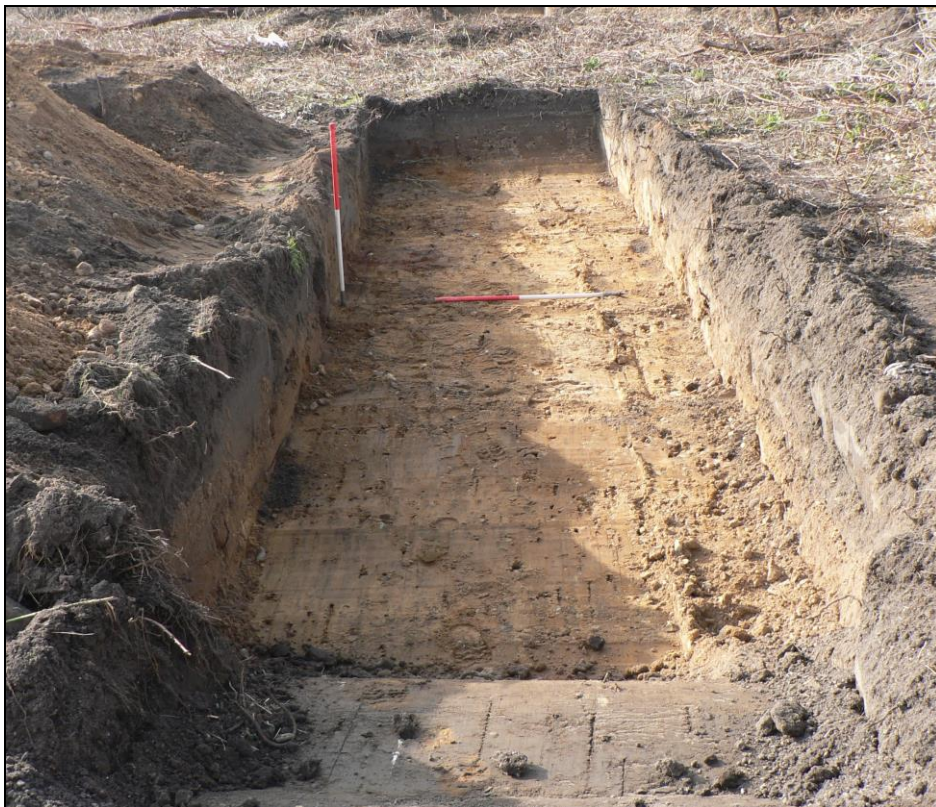
Trench 4 from east