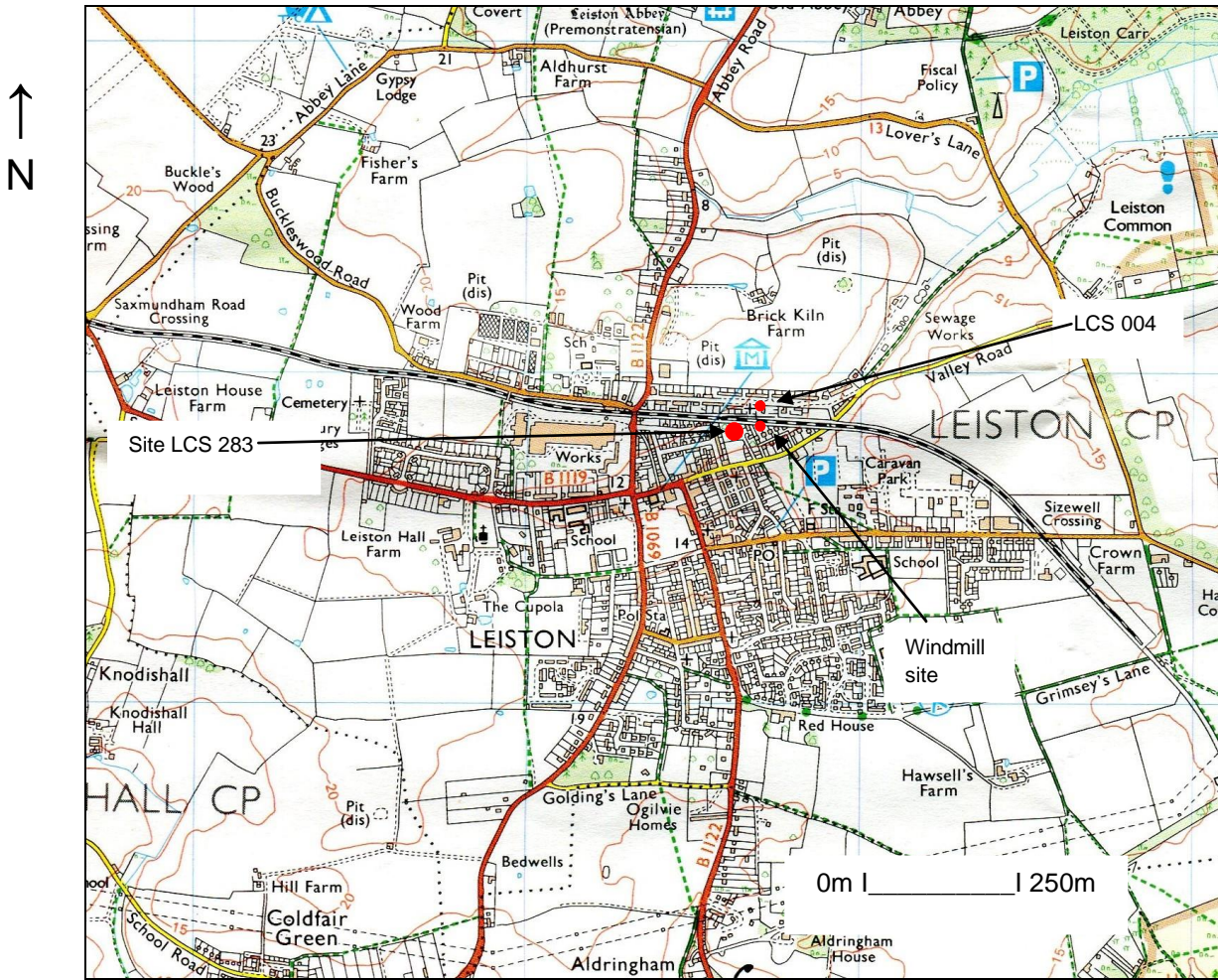
Fig. 1: Site location