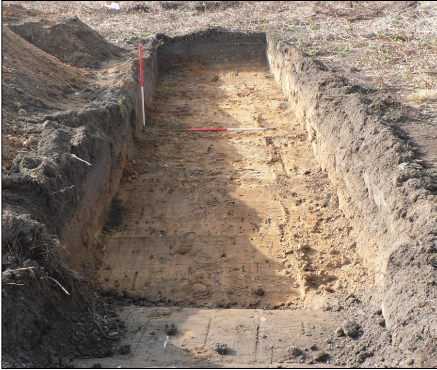
Trench 9 from south