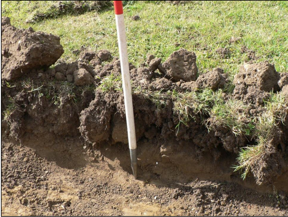
Trench 5 deposit profile