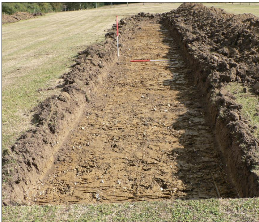
Trench 2 from west