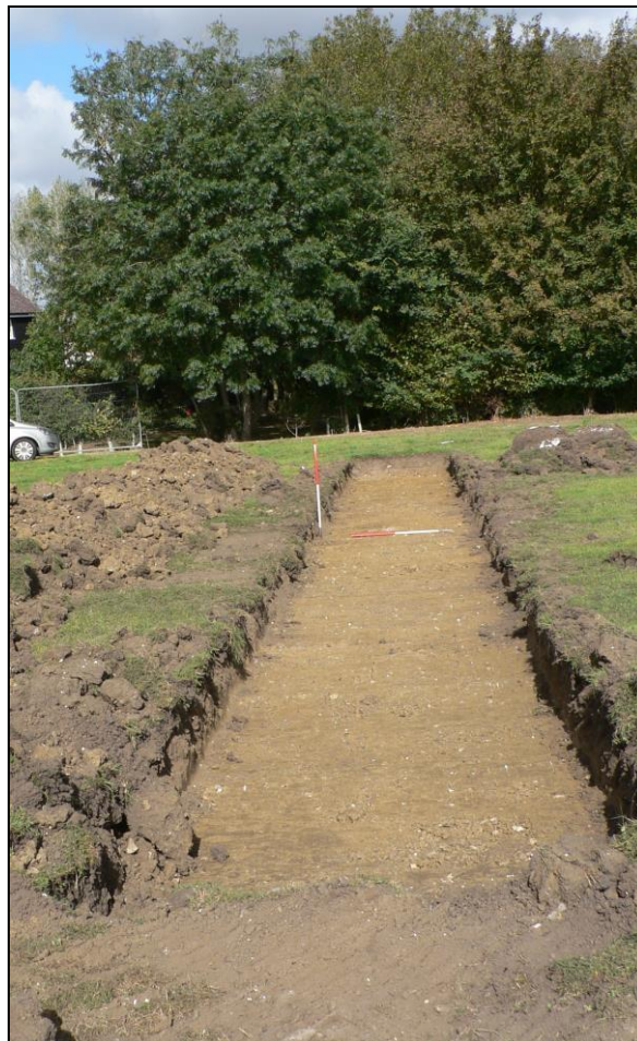
Trench 1 from south