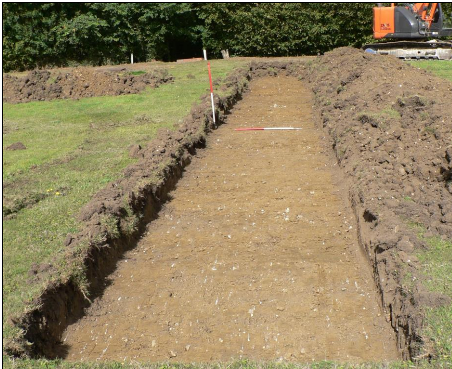
Trench 5 from south