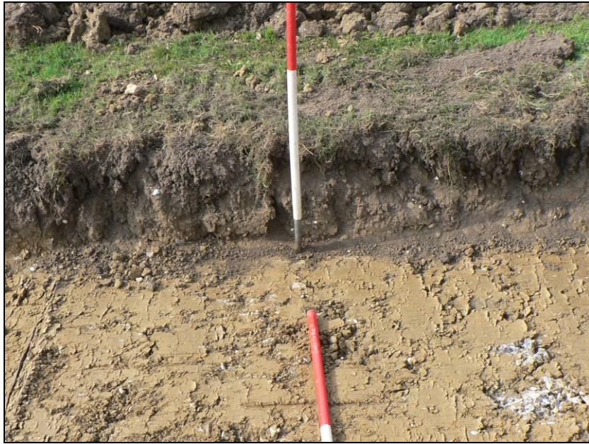
Trench 1 deposit profile