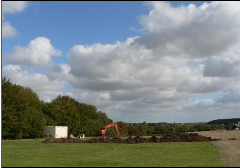
General view from southwest