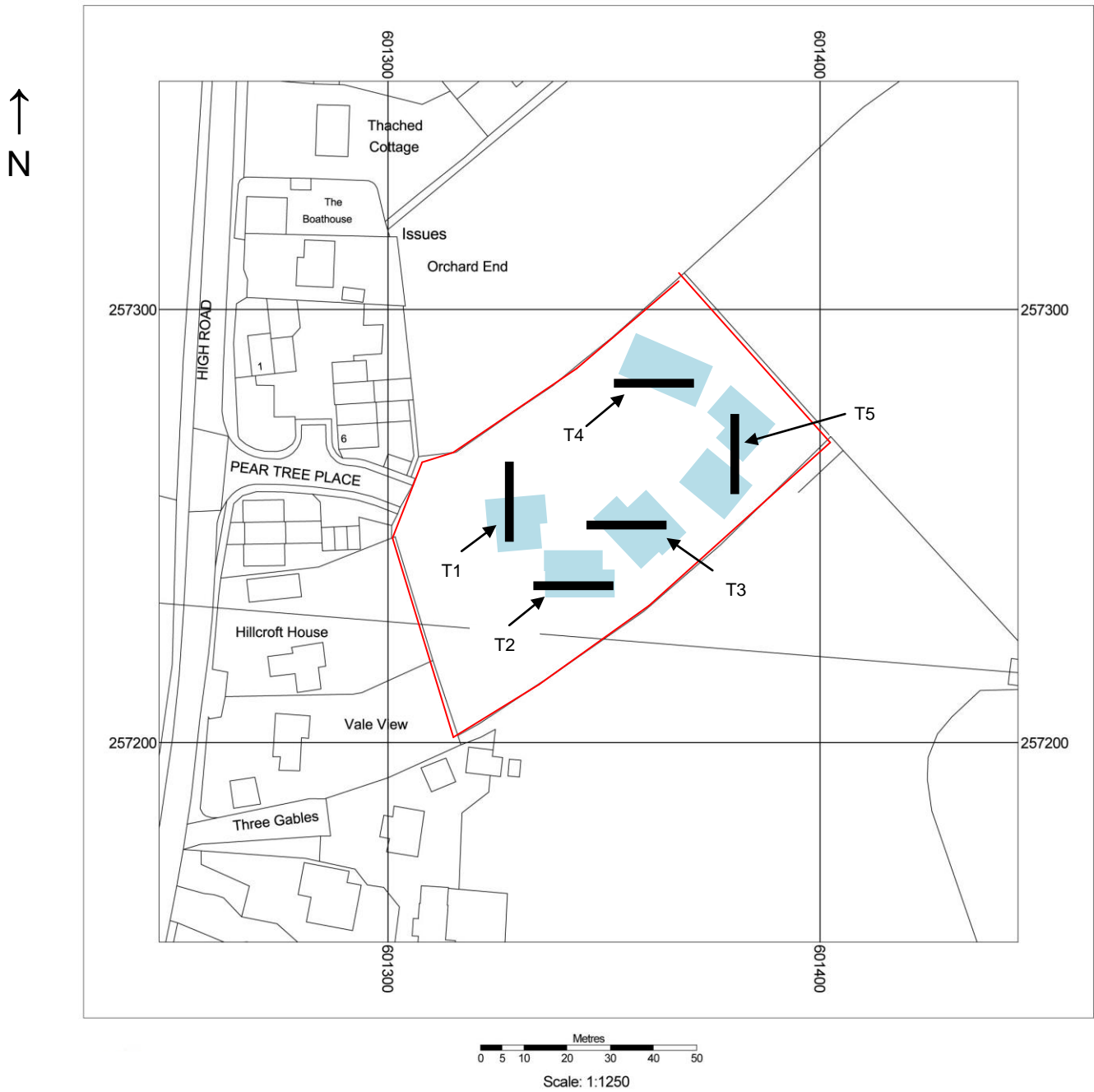
Fig. 2: Location of evaluation trenches (light blue- planned new footprint areas)