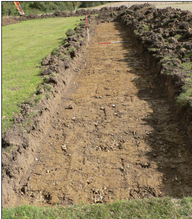
Trench 3 from west