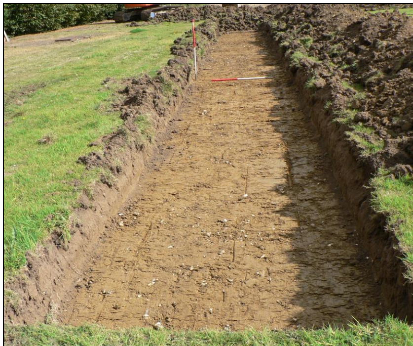
Trench 4 from west