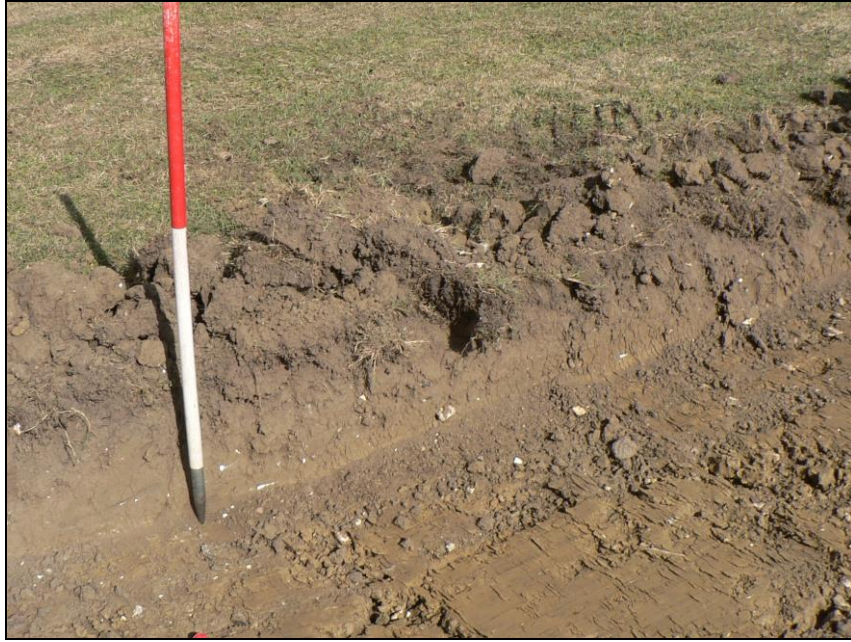
Trench 2 deposit profile