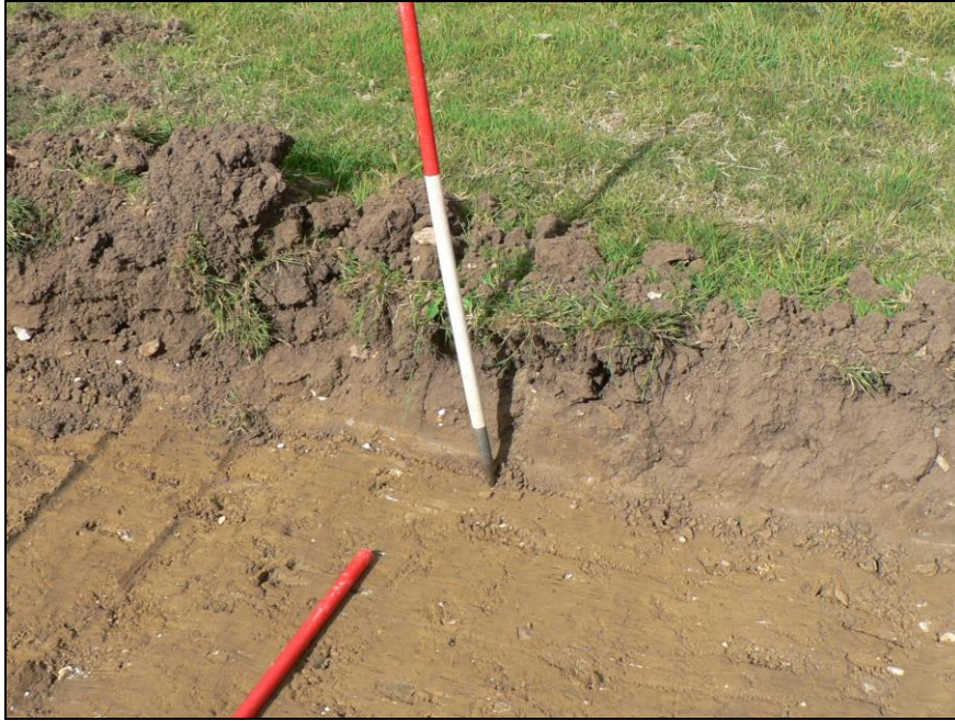
Trench 4 deposit profile