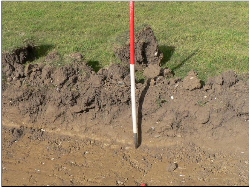
Trench 3 deposit profile