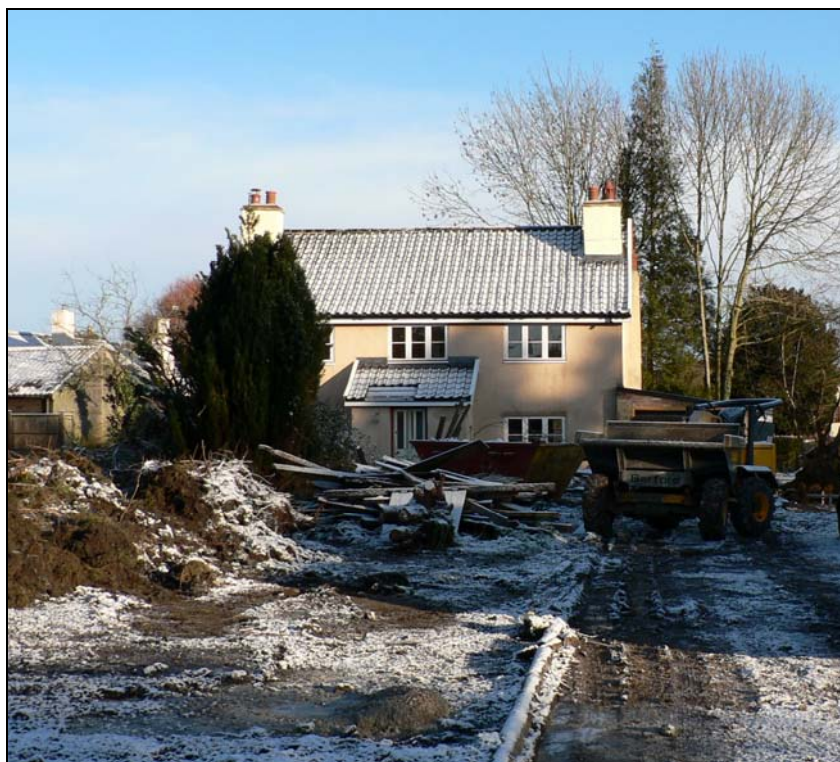
Orchard Cottage from south