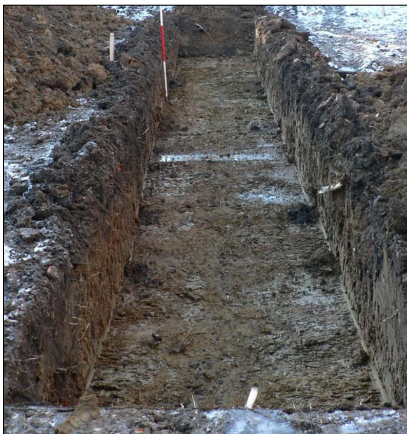
Trench from north