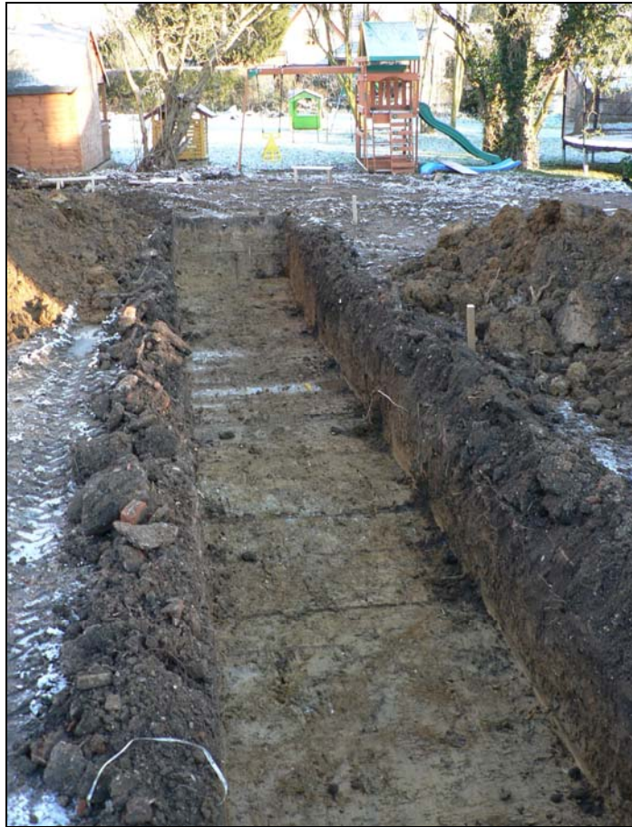
Trench from south