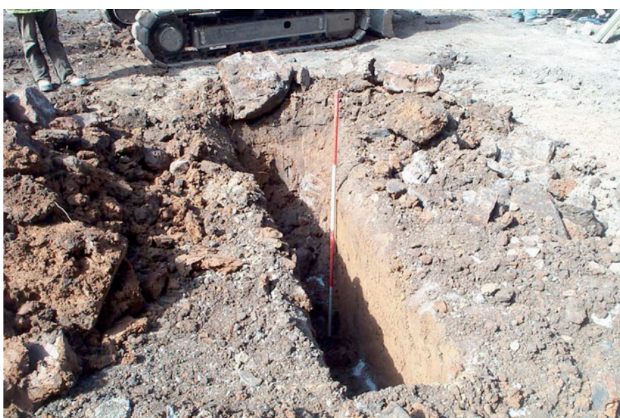
Plate 6: Test Pit 6 – south facing section.