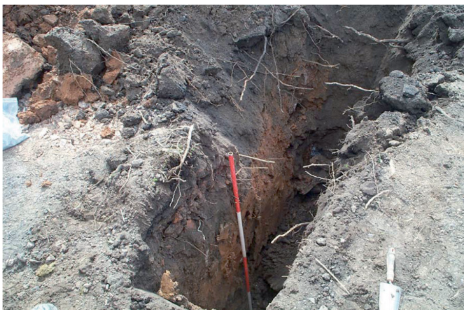
Plate 5: Test Pit 5 – west facing section.