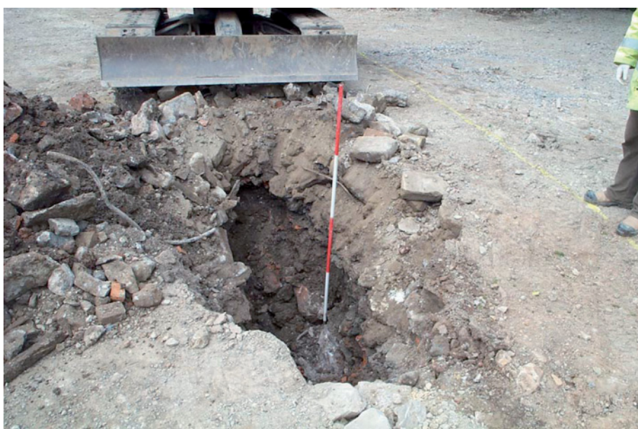
Plate 3: Test Pit 3 – south facing section.