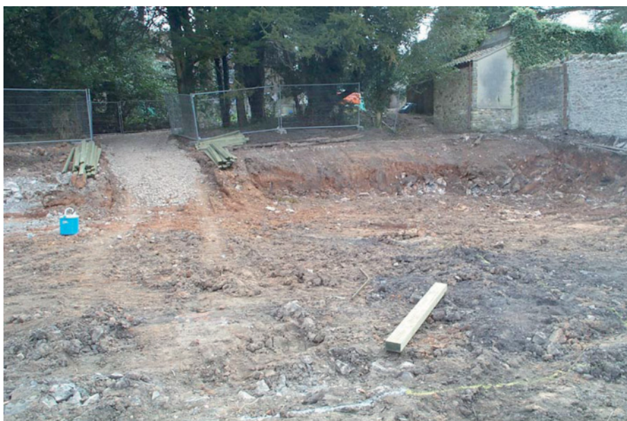
Plate 10: Block B – south half of area