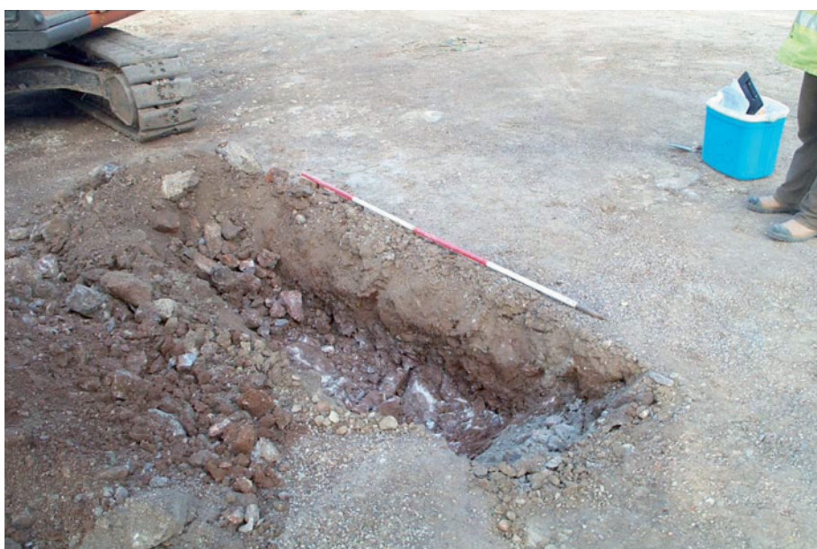
Plate 2: Test Pit 2 – southeast facing section.