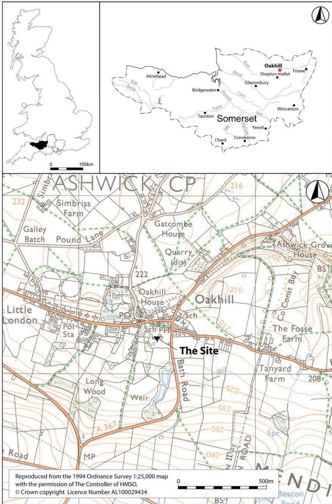
Figure 1: Site location map