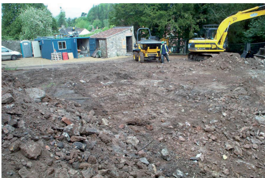
Plate 9: Block A – west end of area