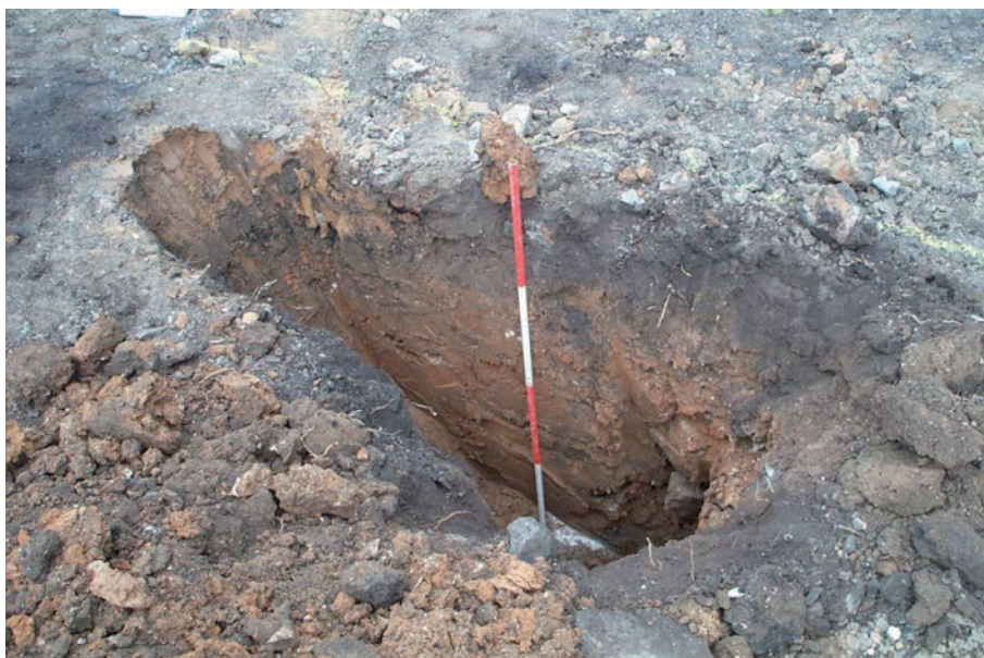
Plate 4: Test Pit 4 – south facing section.