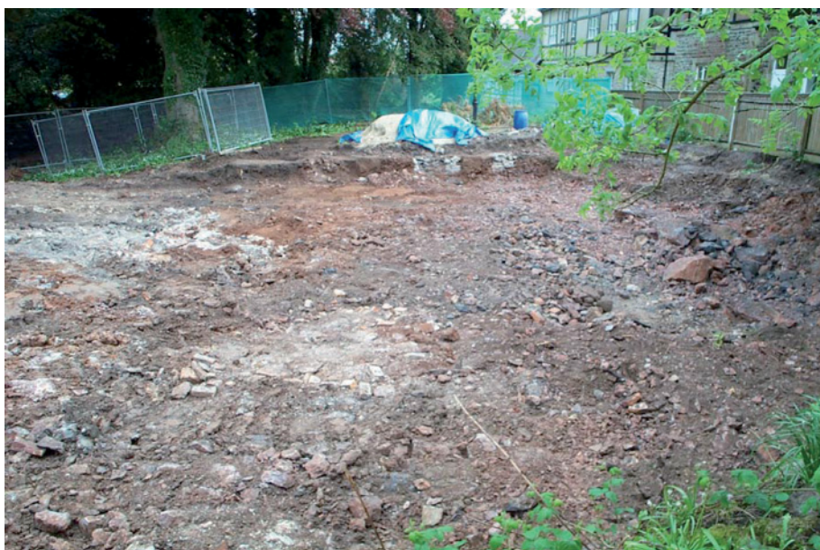
Plate 7: Block A – east end of area