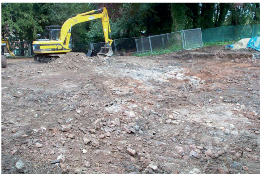
Plate 8: Block A – centre of area