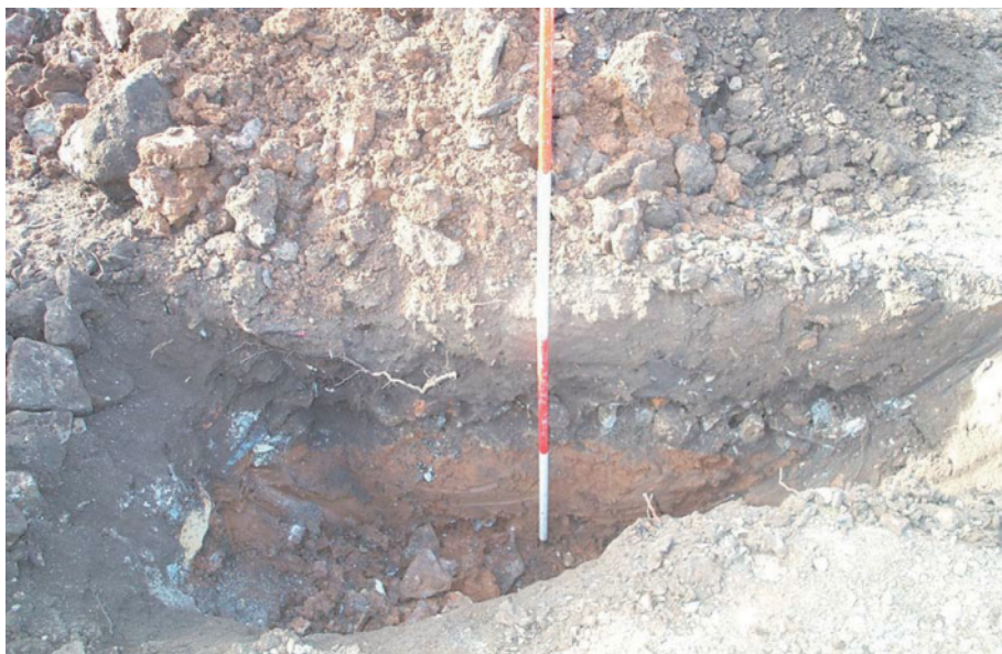
Plate 1: Test Pit 1 – north facing section.