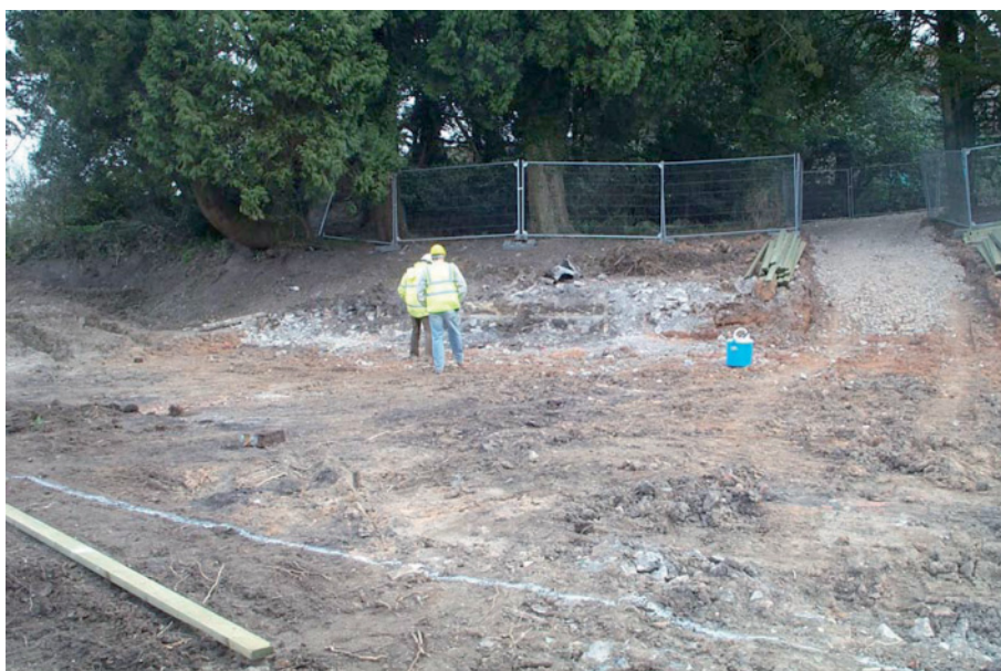
Plate 11: Block B – north half of area