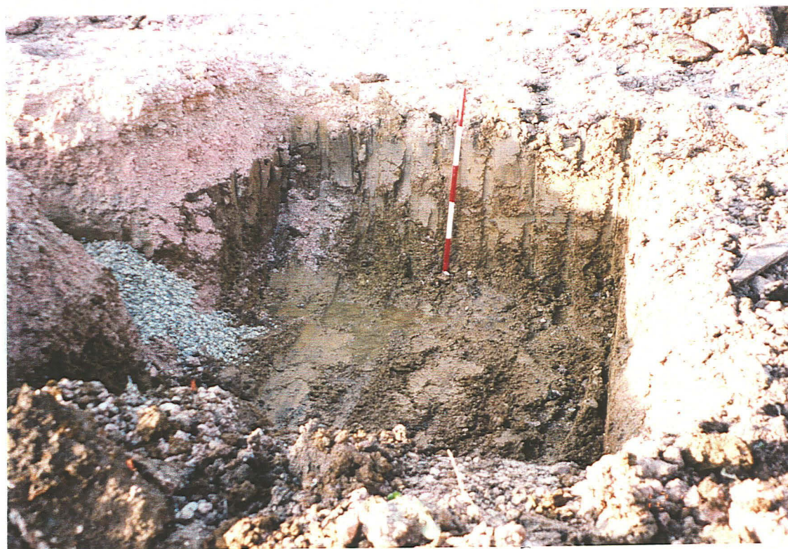
P2. General stratigraphy as exposed in manhole trench at north end of main sewer