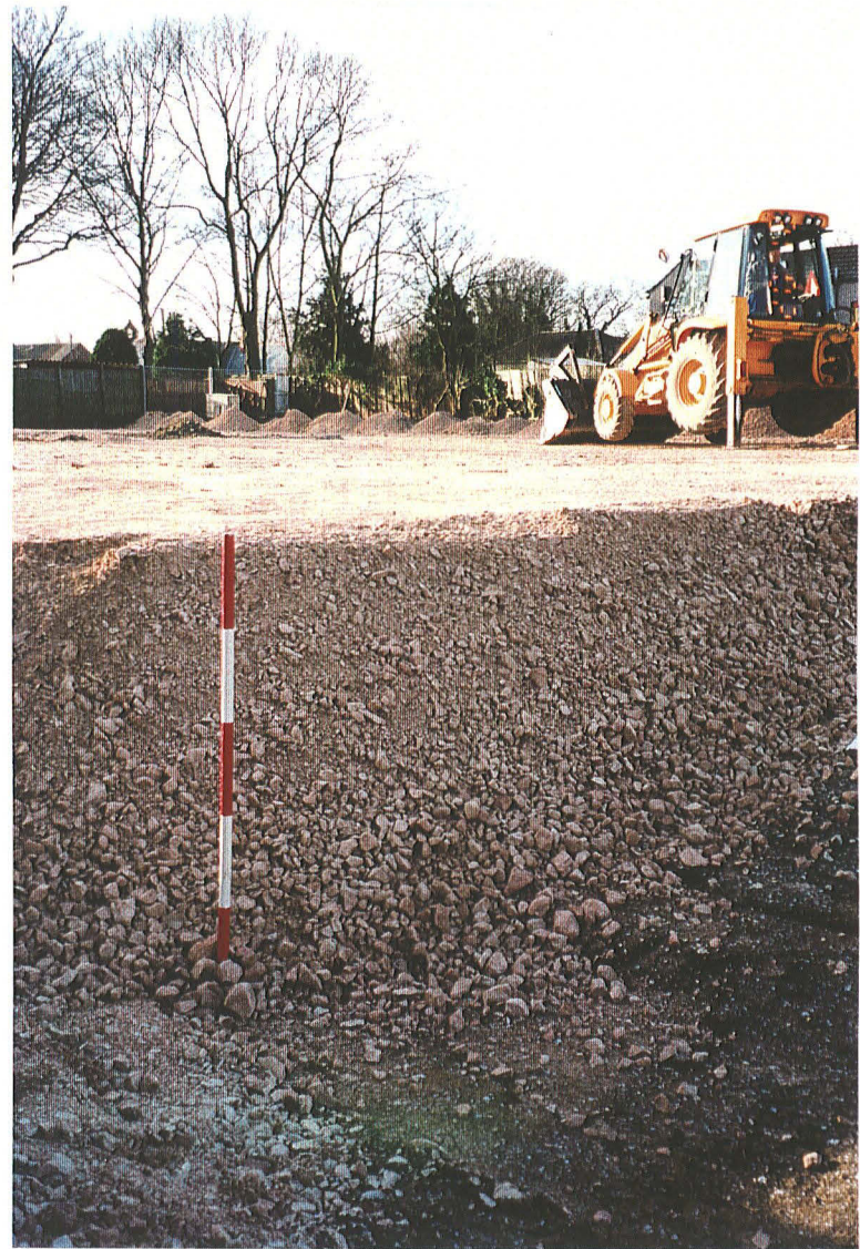
P4. General view showing depth of hardcore deposits