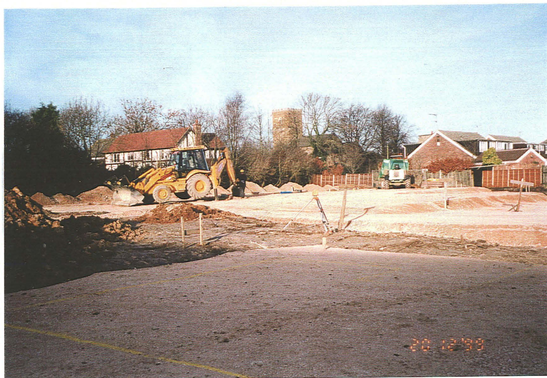
P1. General view of site looking north-west