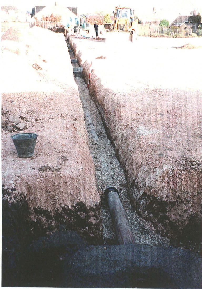
P3. Communal block central sewer trench, looking north