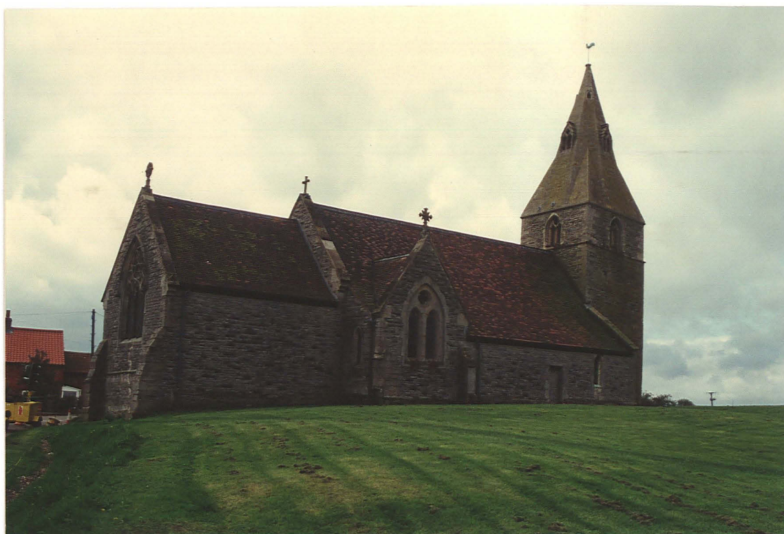
Pl. 1 St. James' Church, Dry Doddington (looking south). Trench 1 was sited at the front left of the photograph, at the base of the slope.