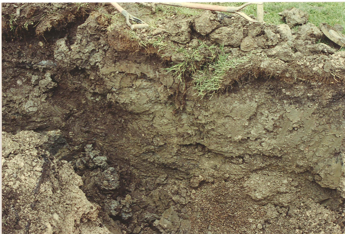
Pl. 2 Clay deposits and backfill of earlier service trenches, in the western side of Trench 1.