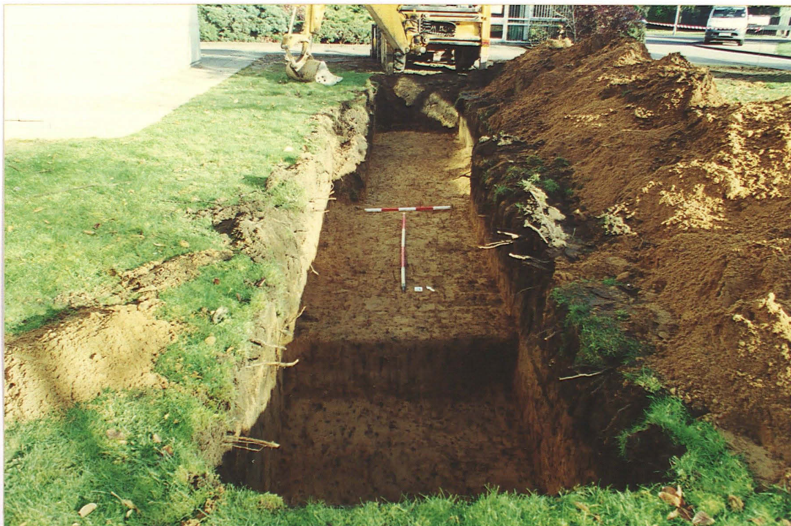
PI. 4 Trench 3, looking north east.