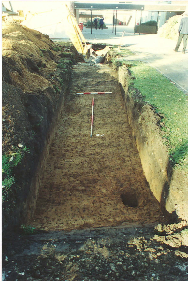
Pl. 2 Trench 1, looking north west.