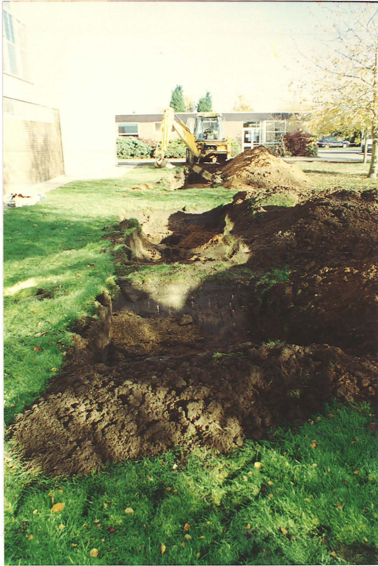
Pl. 5 Concentration of service trenches below the surface, in Trench 4.