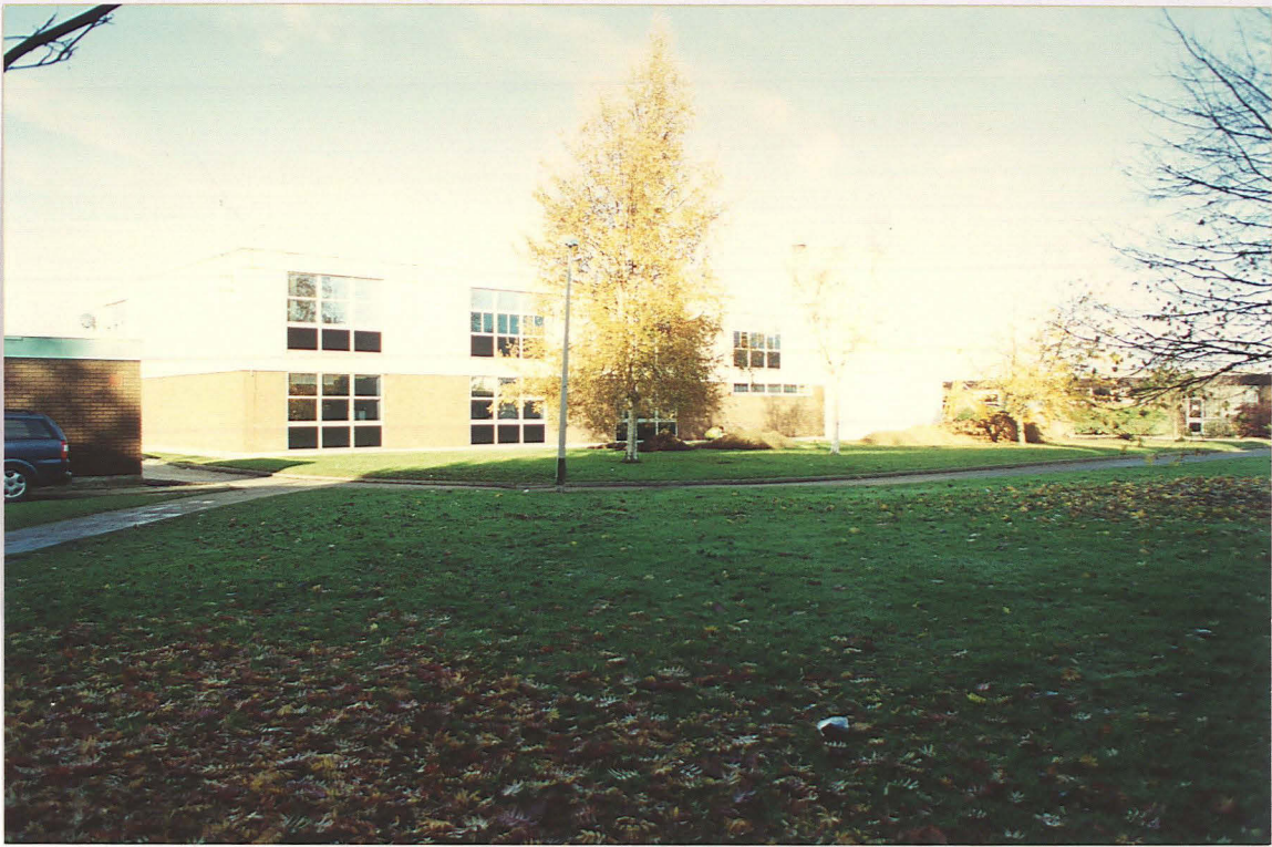
Pl. 1 General view of site looking south.