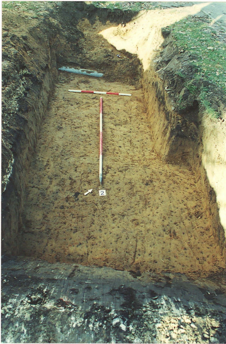
PI. 3 Trench 2, looking north west.