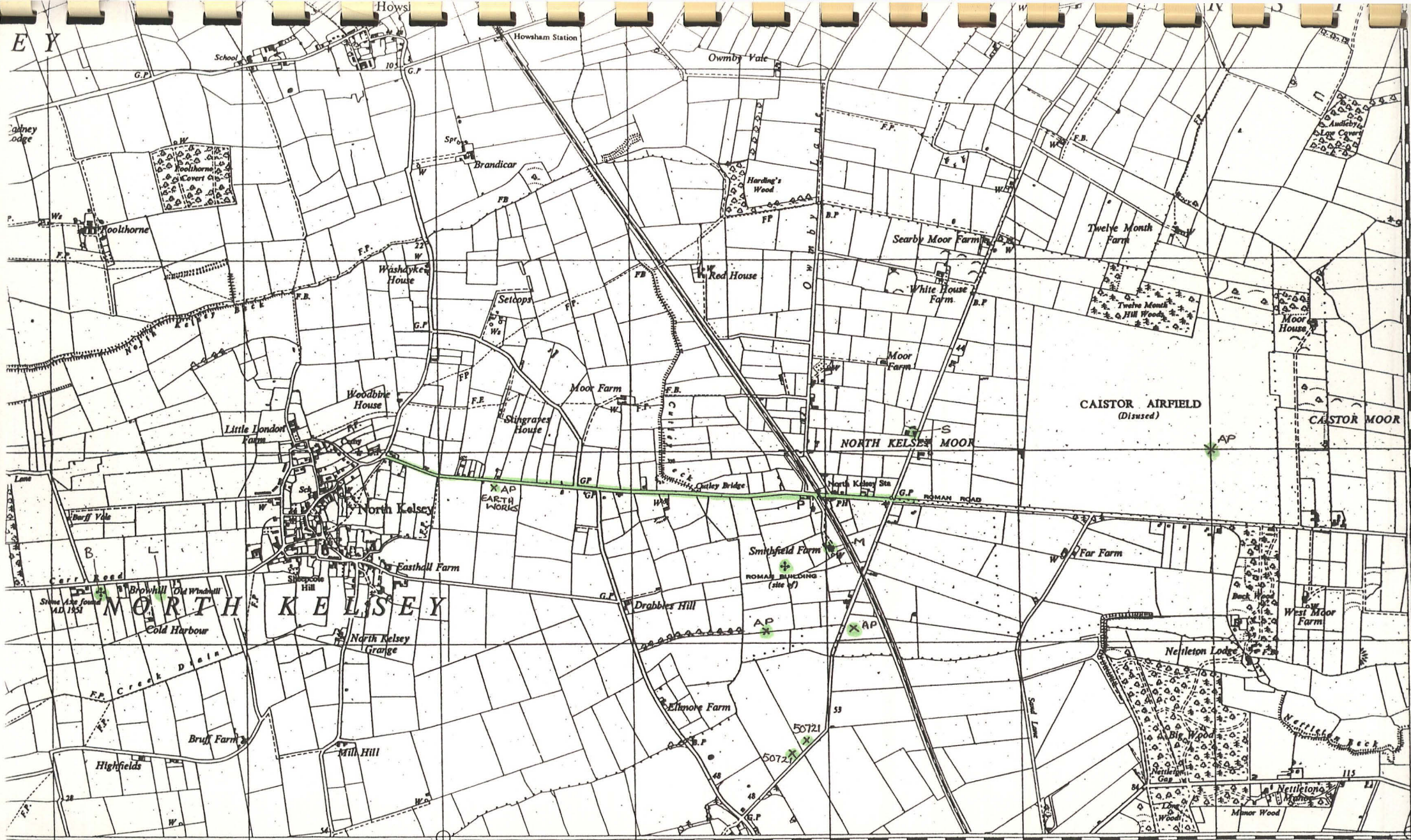
Fig. 1 Location of the North Kelsey Station Road Mains Relay, showing archaeological sites and finds noted on Lincs. Sites and Monuments Record (based on the 1962 Ordnance Survey 1: 25,000 survey, Sheet TA 00 with the permission of The Controller of Her Majesty's Stationery Office, Crown Copyright. Licence No. AL 50424A)