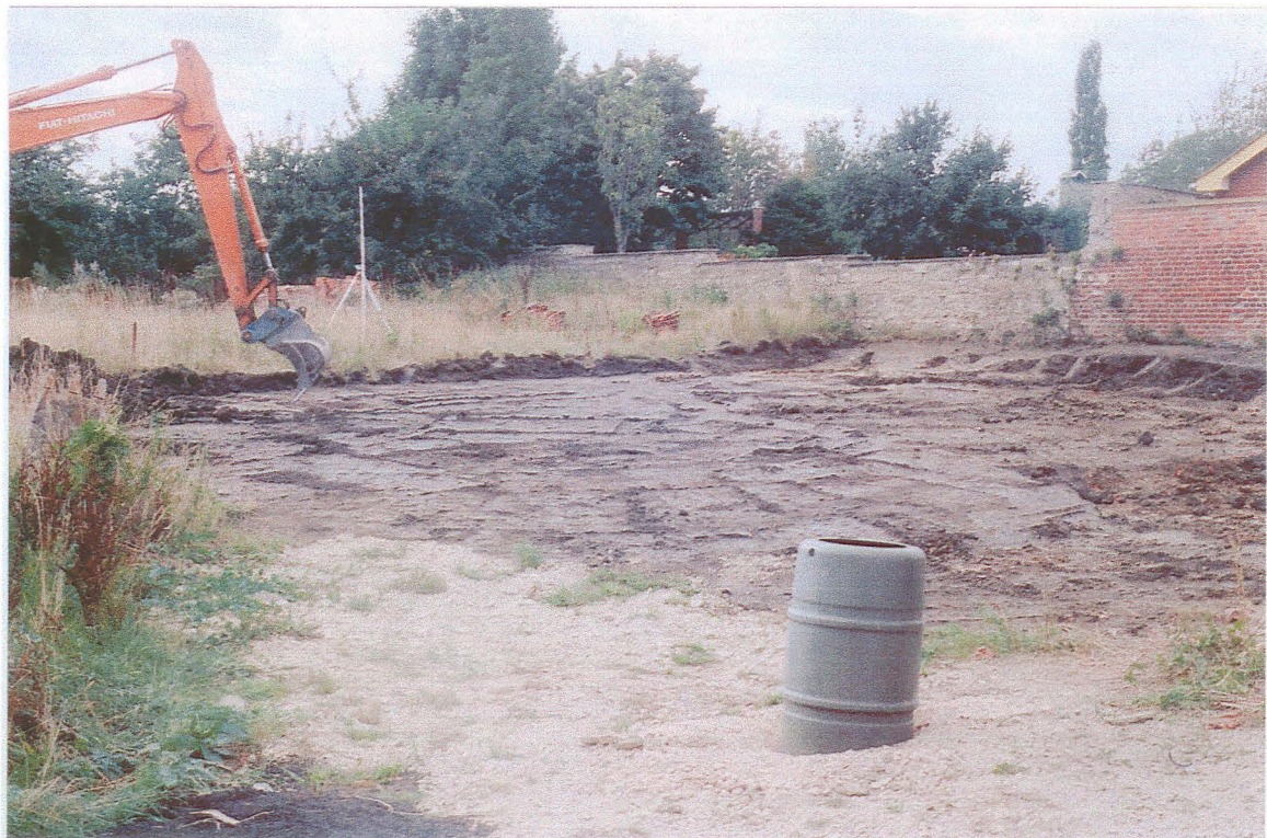
Pl. 2 The rear garden from the side entrance showing stripped area.