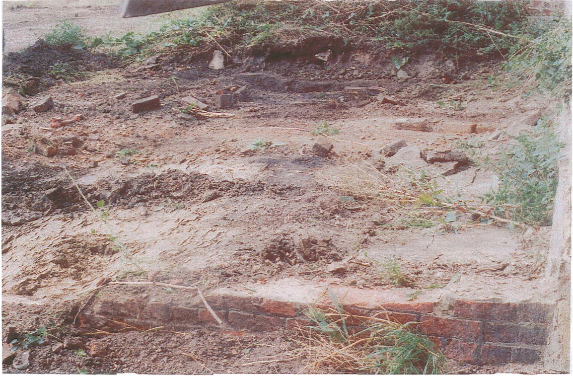
Pl. 3 Early modern brick foundation alongside the retaining wall on the north boundary of the property.