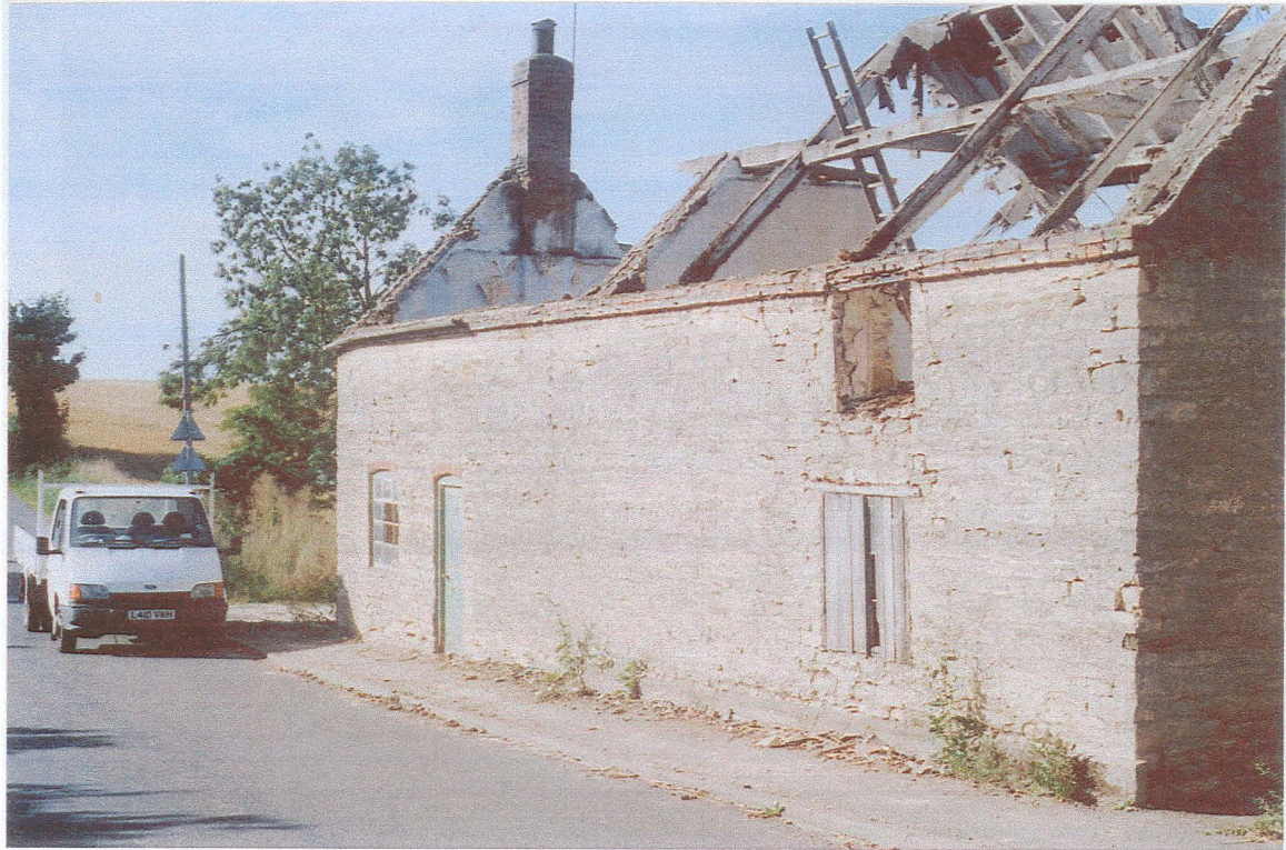
Pl. 1 No 1/1A taken from the northeast.