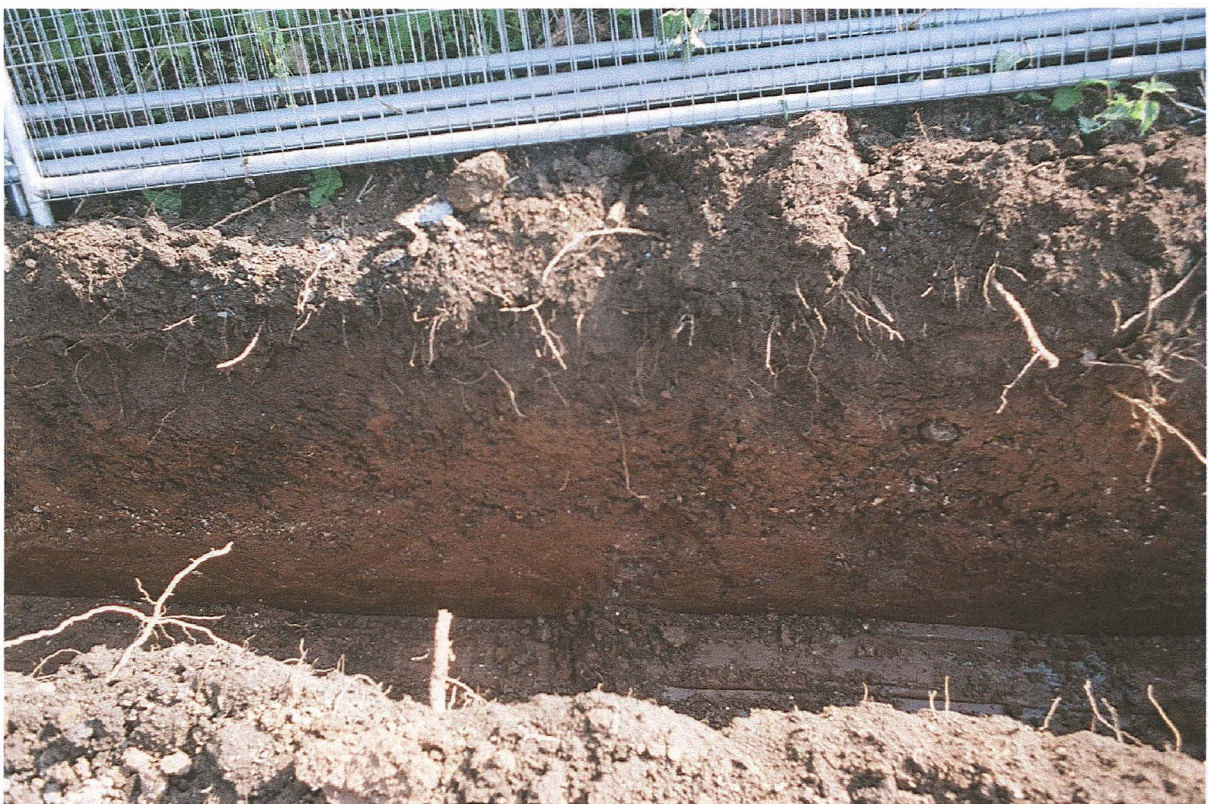
Pl. 4 A typical trench section showing topsoil 100 overlying natural red/brown boulder clay 101.