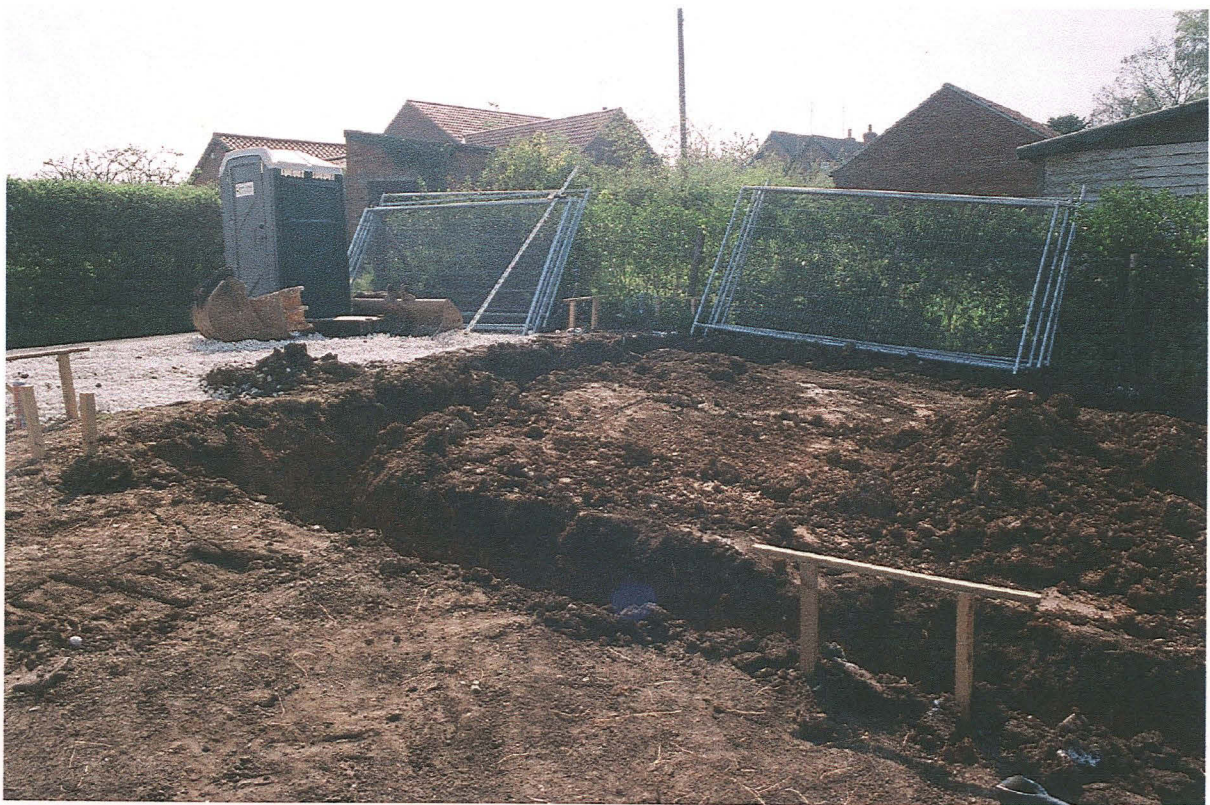
Pl. 6 Fully stripped and excavated garage plot looking south-east.