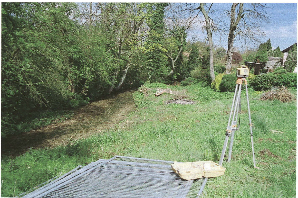
Pl. 2 View of site showing site falling away towards the stream to the west.