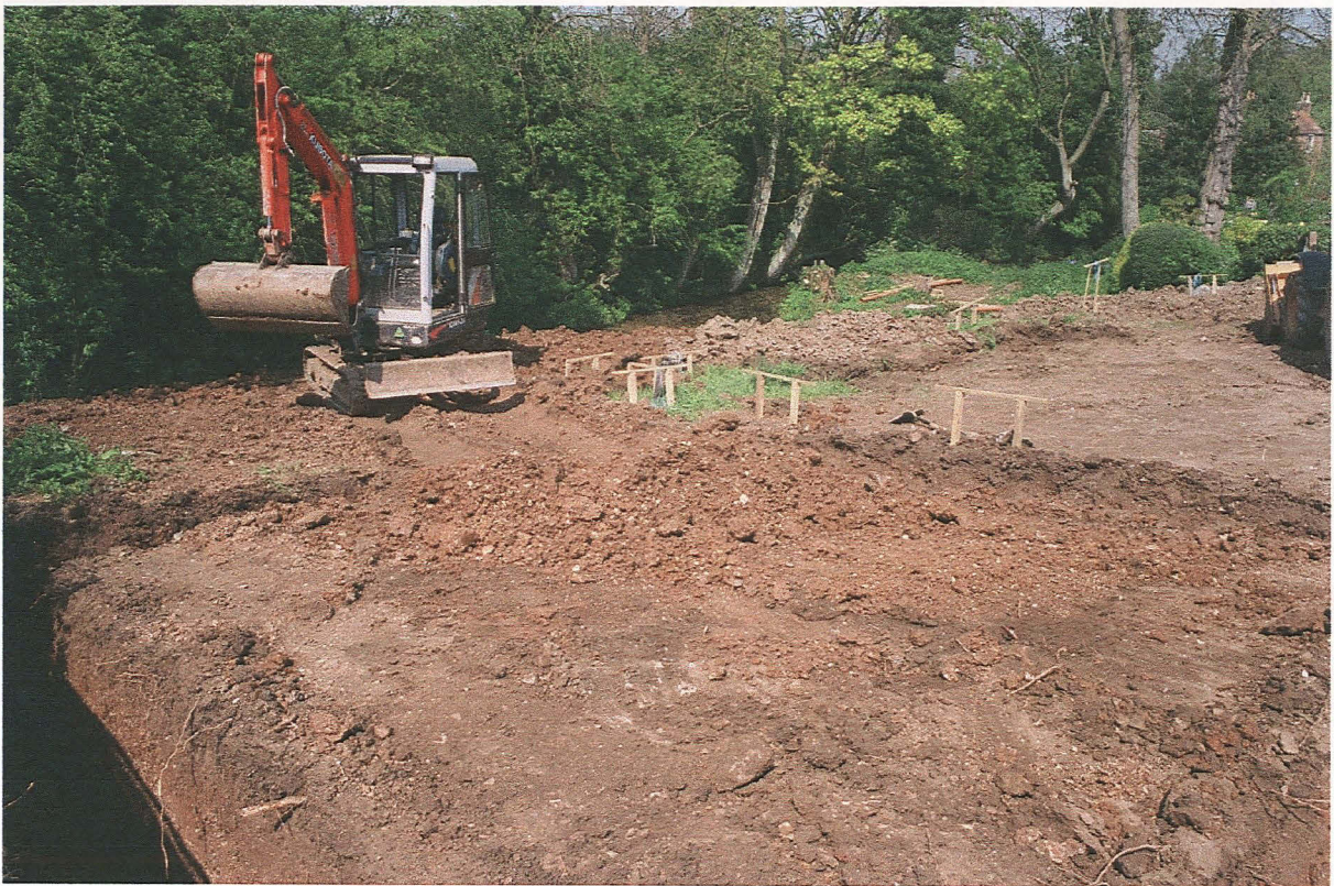
Pl. 5 Looking north-west across the site after topsoil stripping.