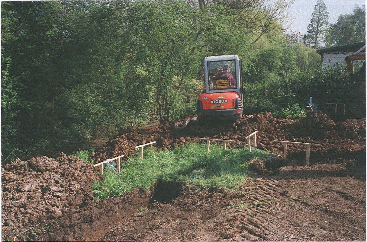
Pl. 3 Material excavated from the foundation trenches being used to level the ground, looking north-west.