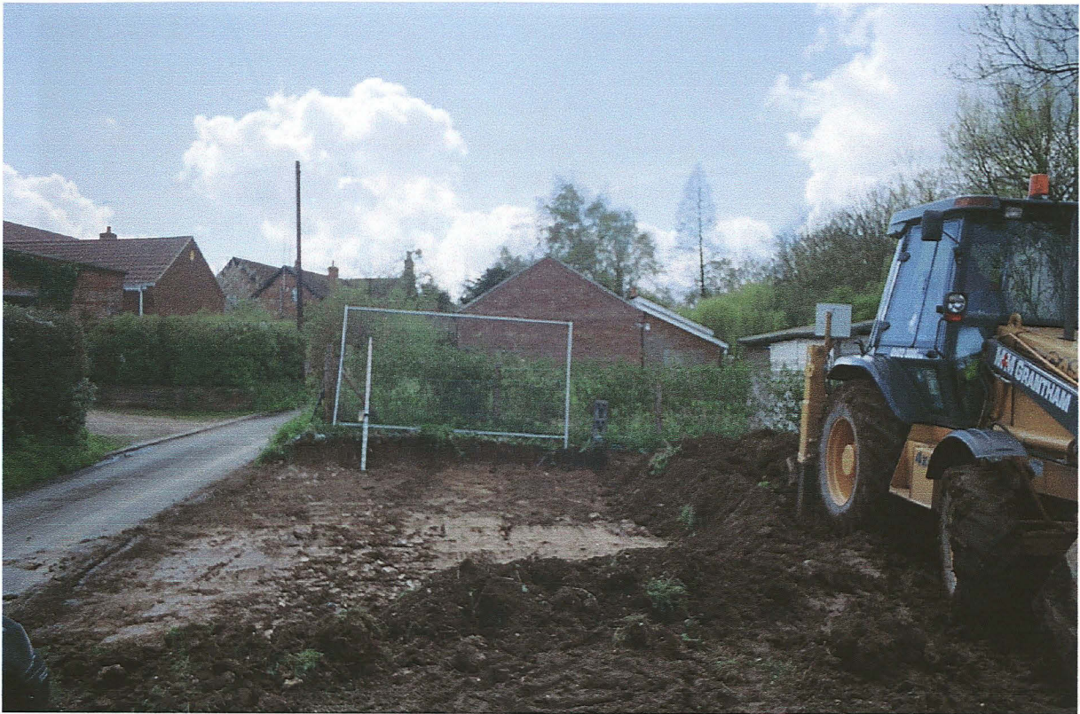
Pl. 1 View looking south across partially stripped area.