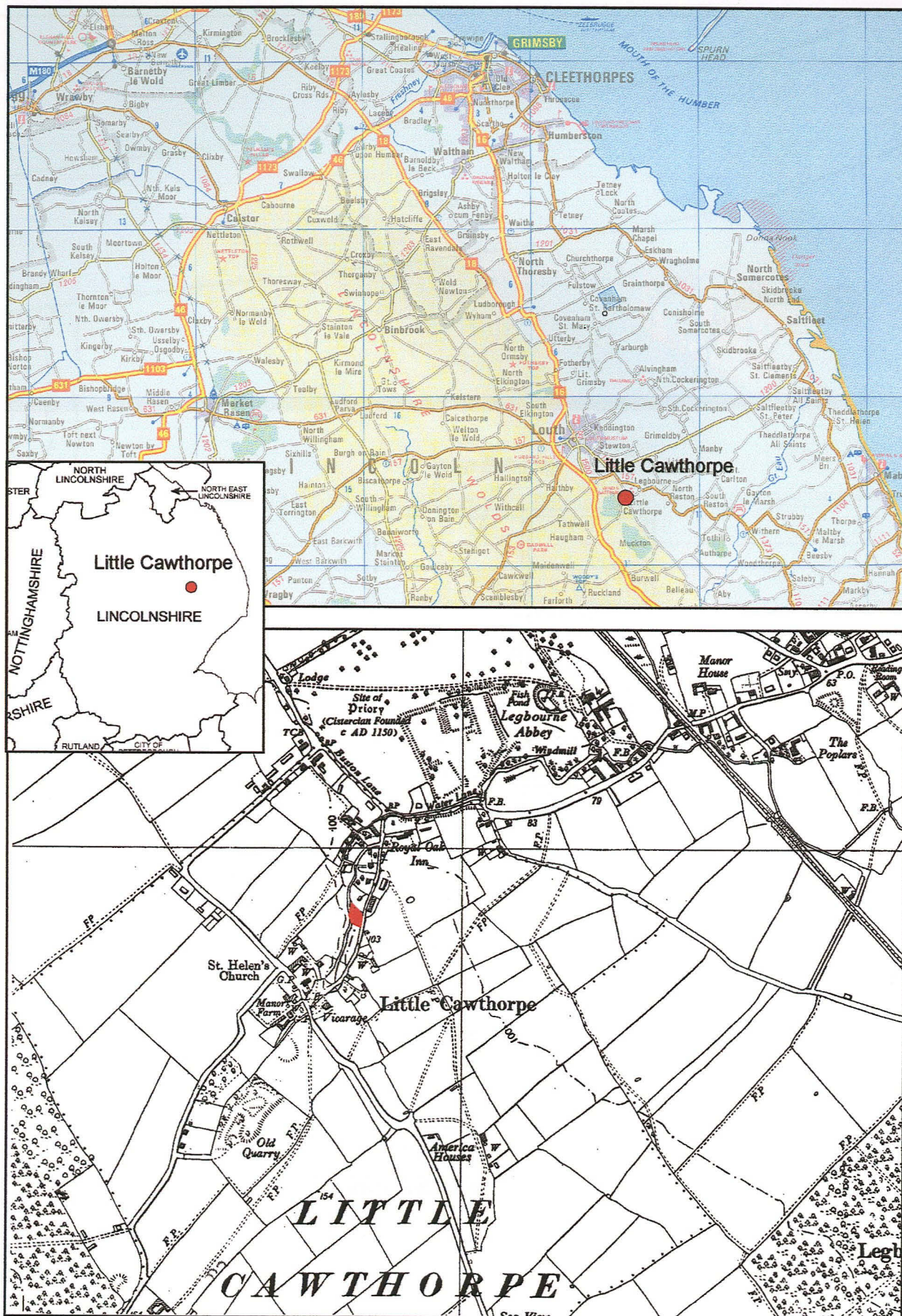
Fig.1 Location of Little Cawthorpe (c based on the Ordnance Survey 1:25,000 Explorer map Sheet 283. Crown copyright, reproduced with the permission of the Controller of HMSO. LAS Licence N°. AL 100002165).