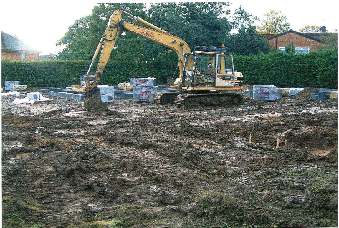
Plate 1. Site looking south east.