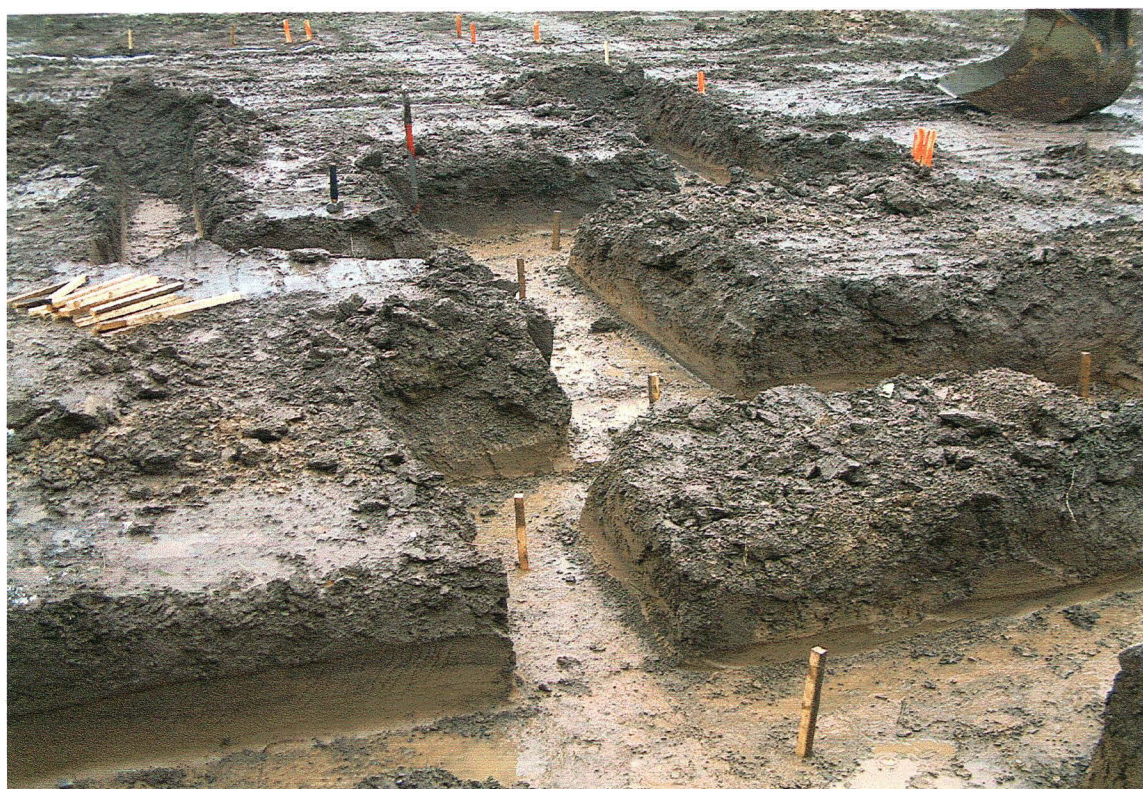
Plate 5. Footings in Plot 2 looking east.