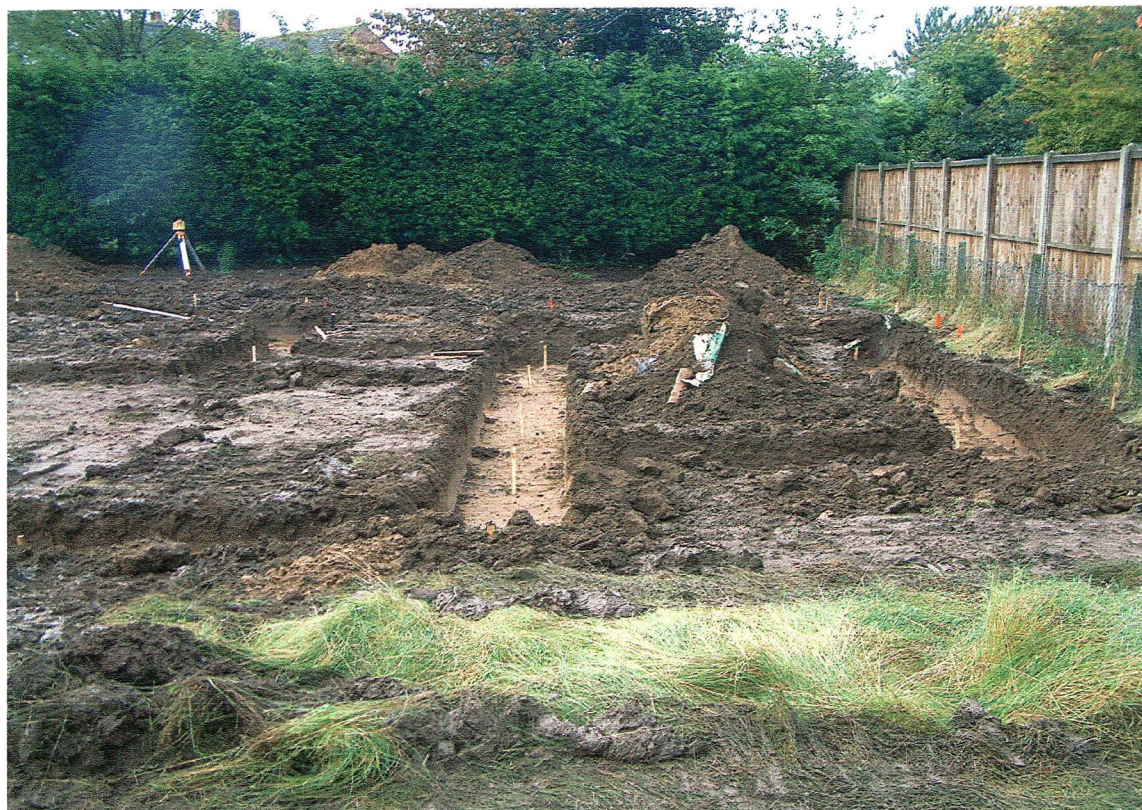
Plate 3. Plot 3 showing general shot of footings.