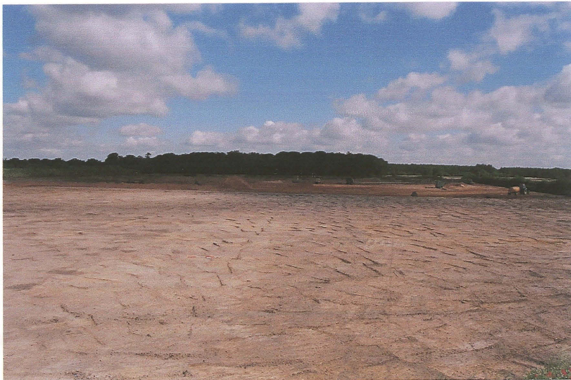
PI. 1 Quarry extension area after topsoil removal (foreground, looking north across the previous extension phase to Tonge's Plantation).