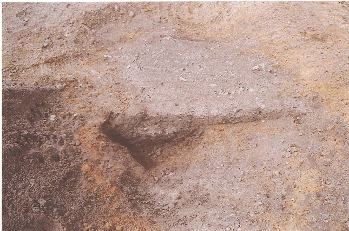
PI. 4 Partial excavation of the feature revealed irregular shape and depth, and it was interpreted as a hole left by an uprooted sapling.