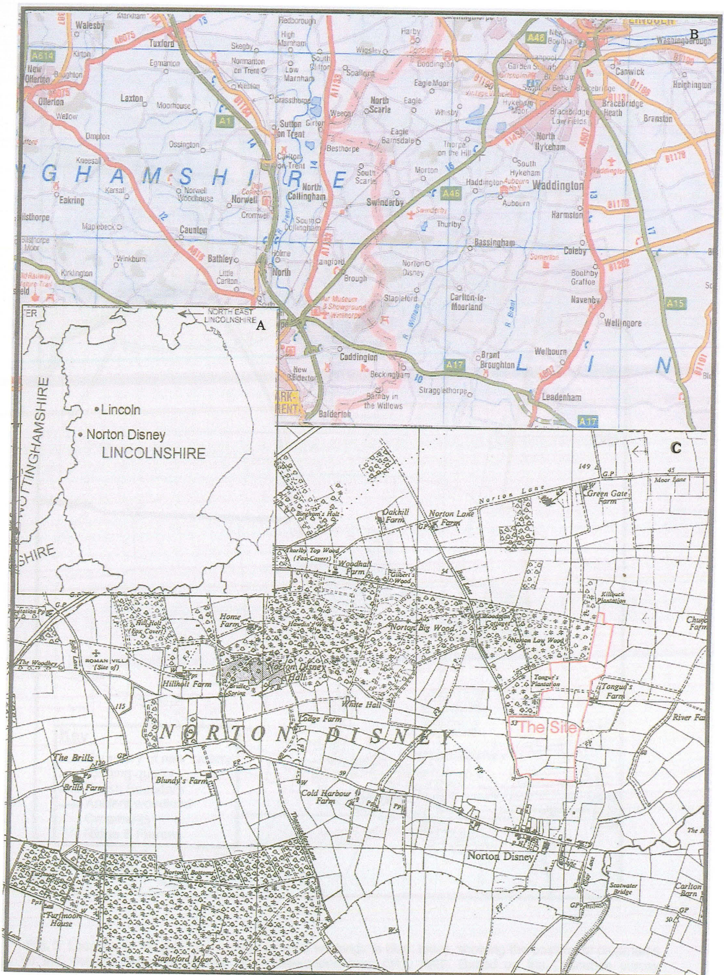
Fig. 1. Location of Norton Disney plan (inset C based on the 1953 Ordnance Survey 1:25000 map Sheets SK 85 and SK 86)