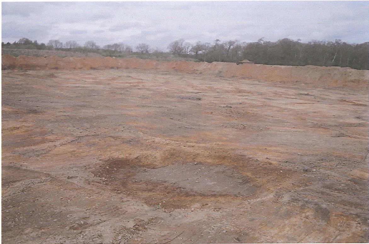
PI. 3 Irregular feature filled with grey sand, near the northern side of the stripped area (looking north-west).