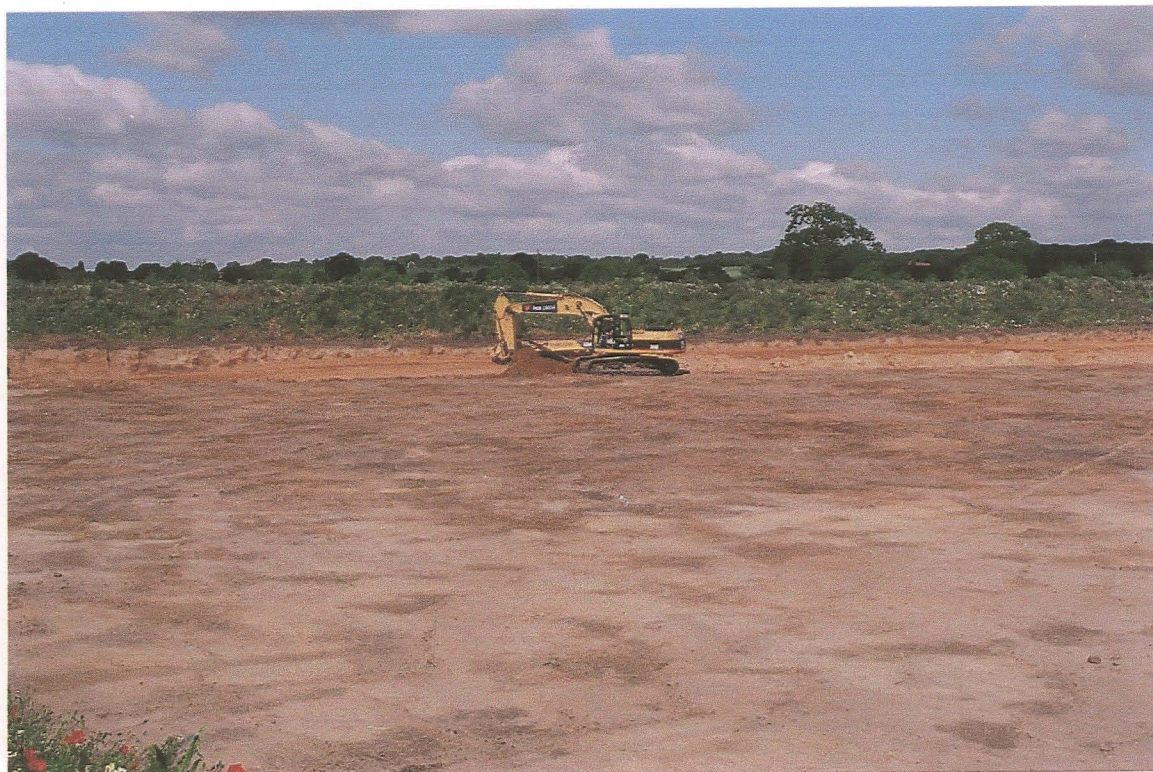
PI. 2 Regular faint west-east striations of lighter soil in the stripped surface reflect the bases of medieval plough furrows (looking west to the bund beside Butt Lane).