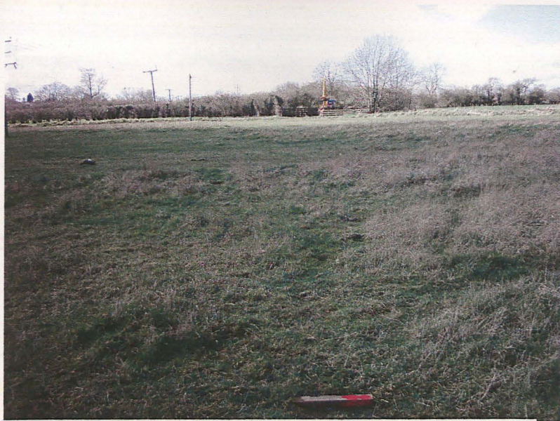
Trench 34, Pre excavation (looking northwest)