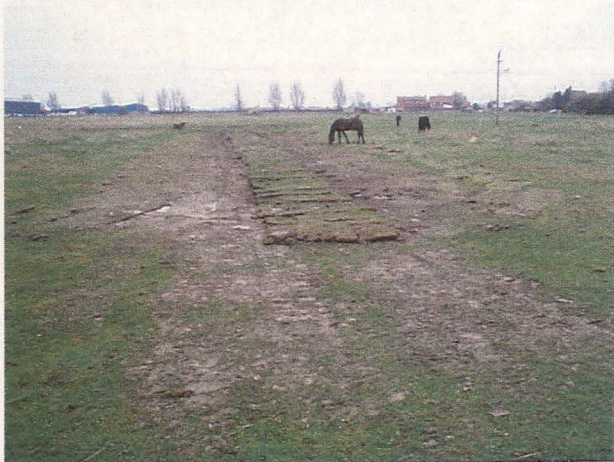
Trench 30, post excavation (looking south east)