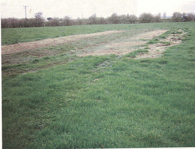
Trench 36 post ex