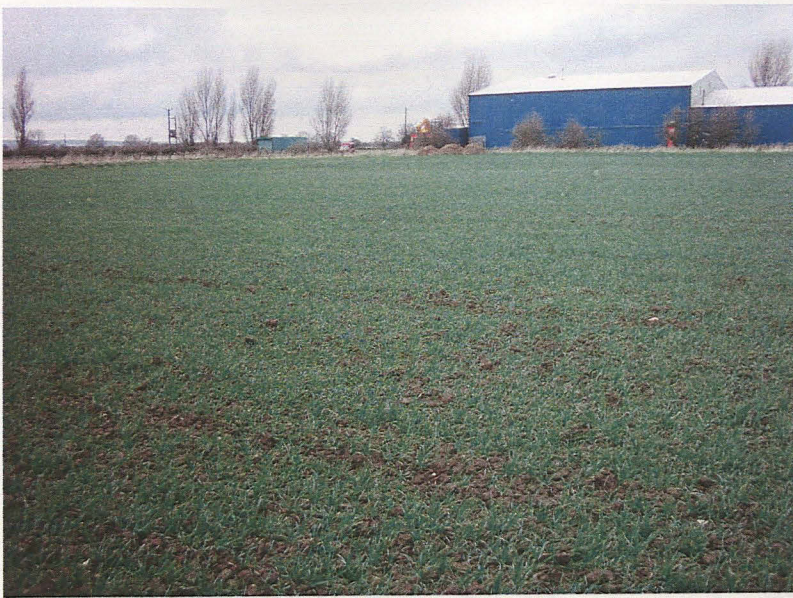
Trench ,34-35 pre excavation Looking north east