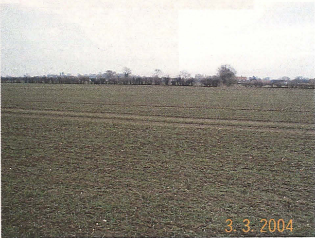
Trench 22, Pre excavation (looking north)