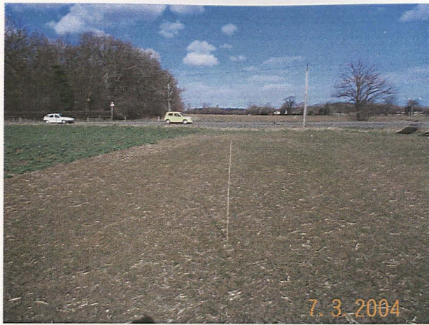
Trench 1, Pre excavation (looking north)

Trench 3, pre excavation (looking north east)