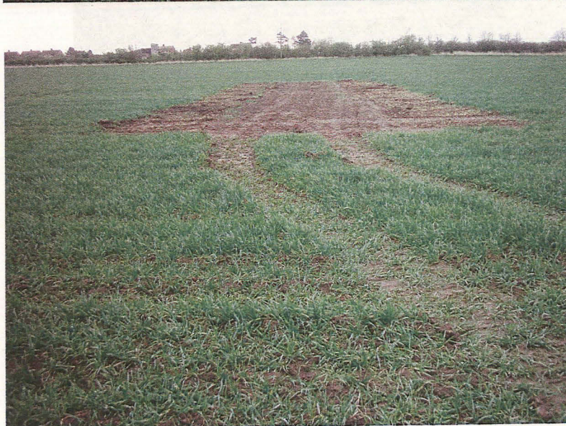
Trench 35 Post excavation (looking south)