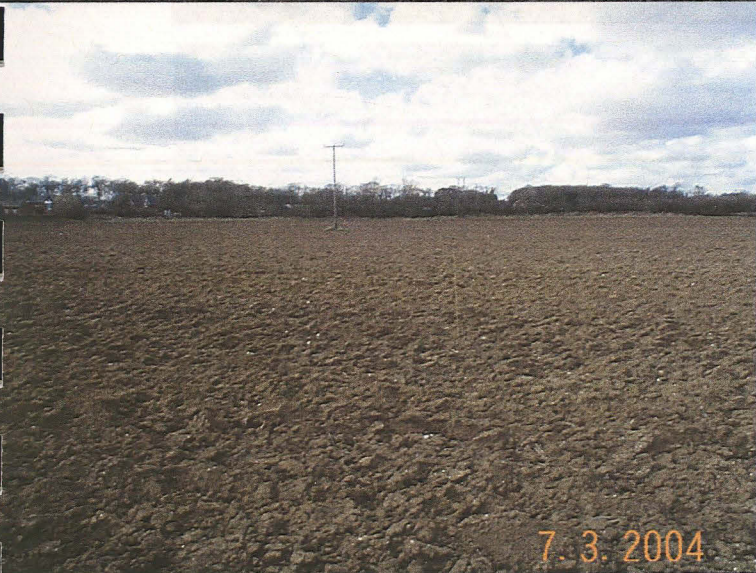
Trench 6, Pre excavation (looking east)