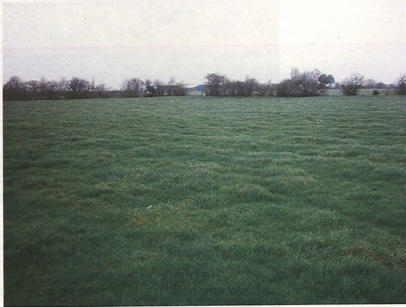
Trench 36 looking NE Pre ex