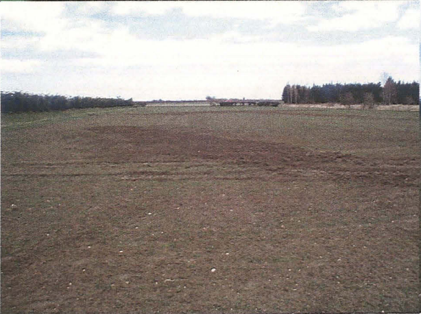
Trench 18, (below left) looking east and 19-20 (below right) looking east.