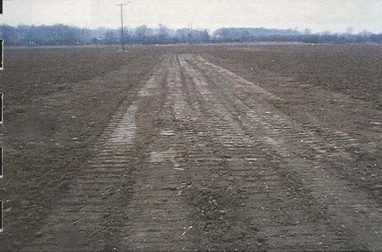
Trench 5, Post excavation (looking east)