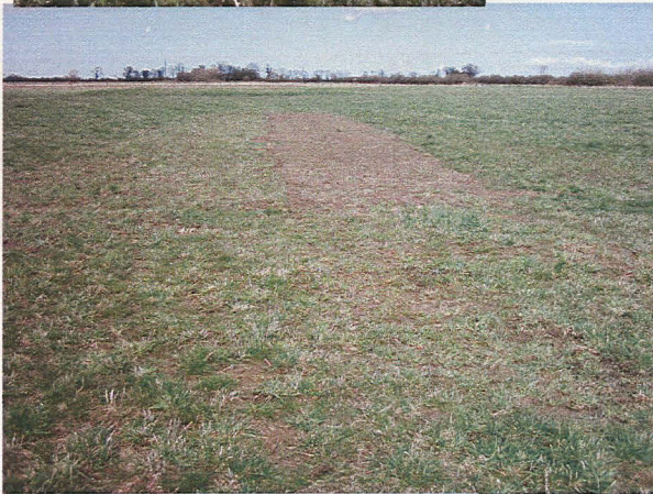
Trench 25, Post excavation (looking northeast)