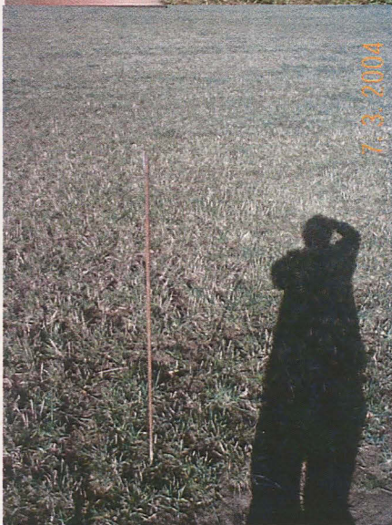
Trench 24, Pre excavation (looking east)