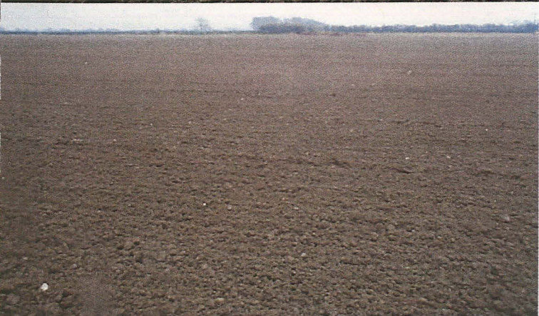
Trench 6, Post excavation (looking west)