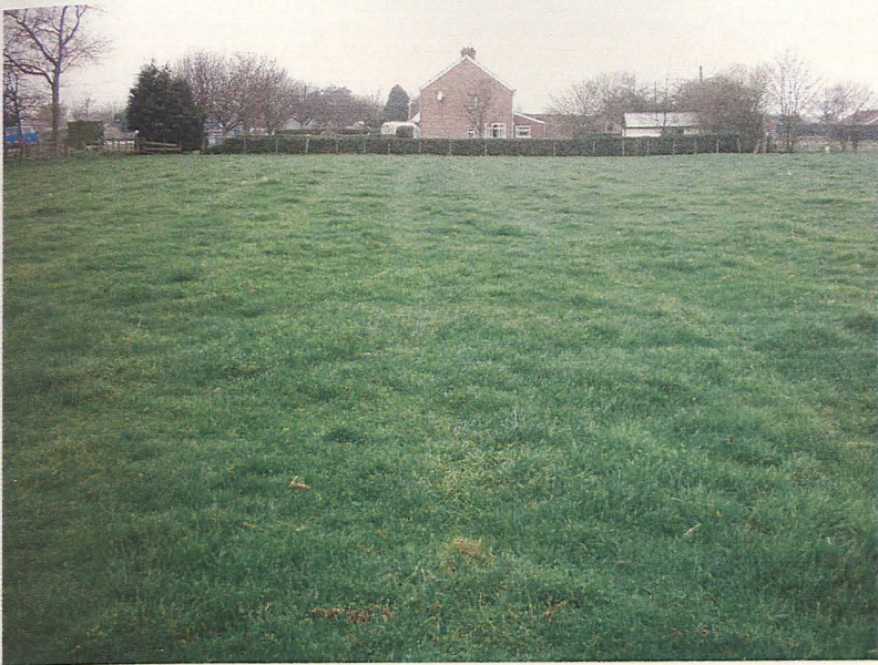
Trench 37, pre ex