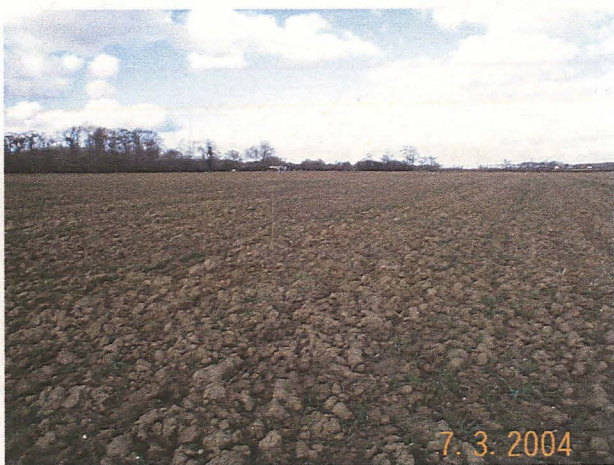
Trench 4, pre excavation