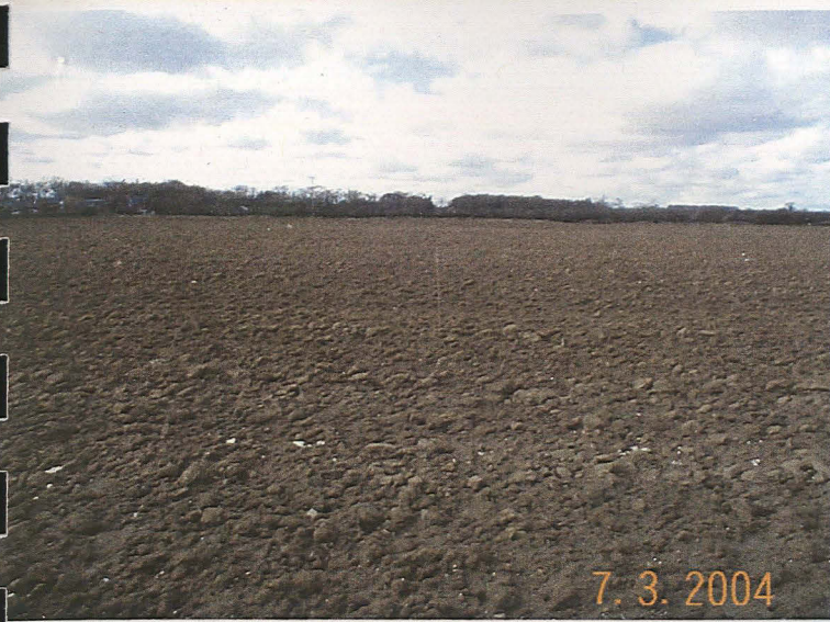
Trench 5, Pre excavation (looking east)