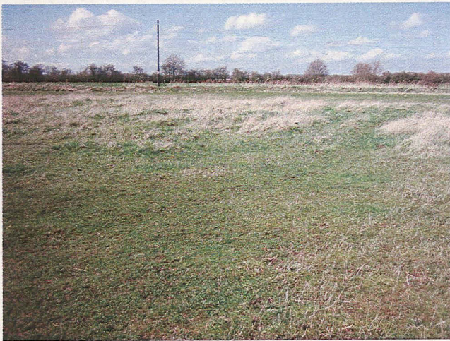
Trench 30, Pre excavation (looking west)