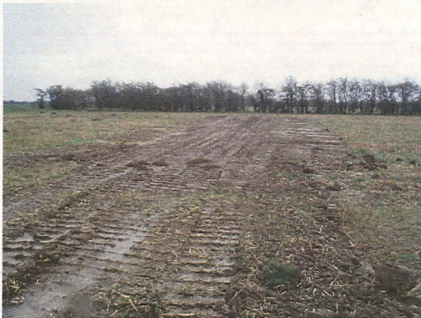
Trench 8 post excavation (looking southeast)