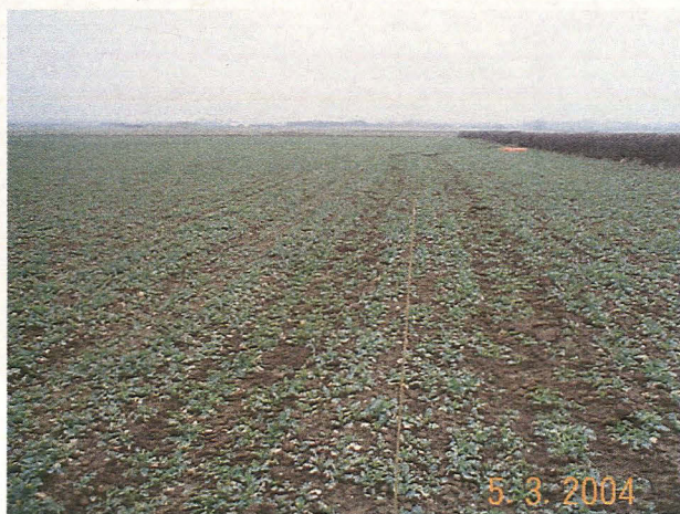
Trench 12, Pre excavation (looking north west)