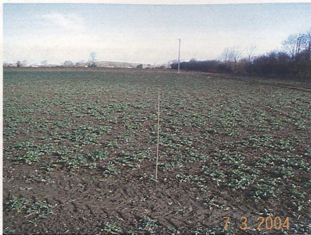
Trench 3, pre excavation (looking north east)