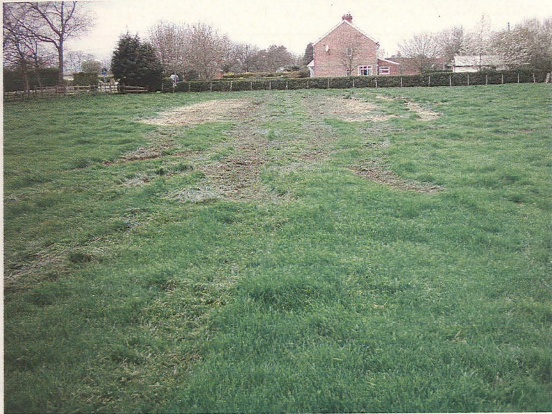
Trench 37, Post ex (looking west)