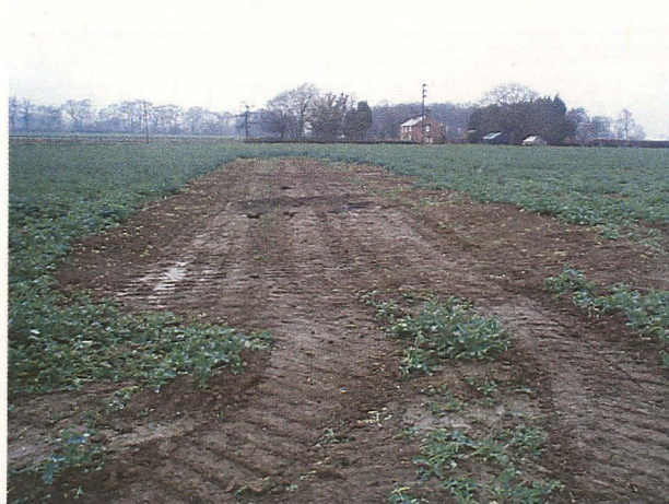
Trench 2, post excavation (looking north)