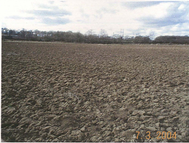
Trench 7, Pre excavation (looking northeast)