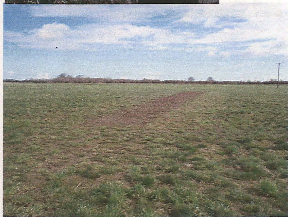
Trench 24 Post excavation (looking east), Trench 23 visible in background