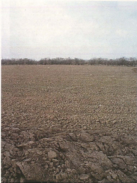
Trench 10 pre excavation (looking north)