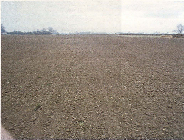
Trench 7, post excavation (looking southwest)