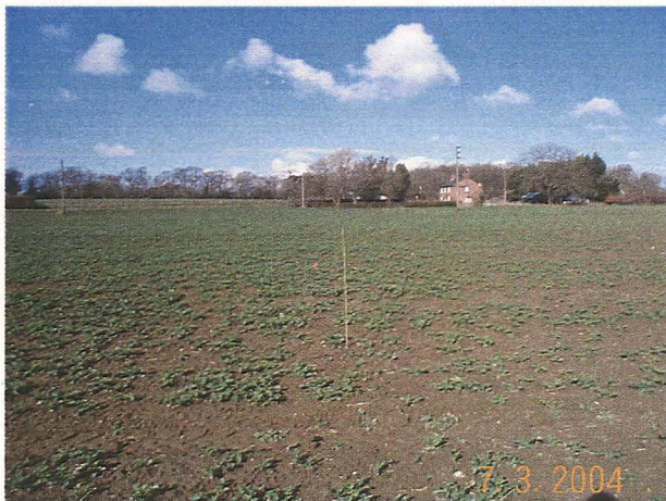
Trench 2, Pre excavation (looking south)