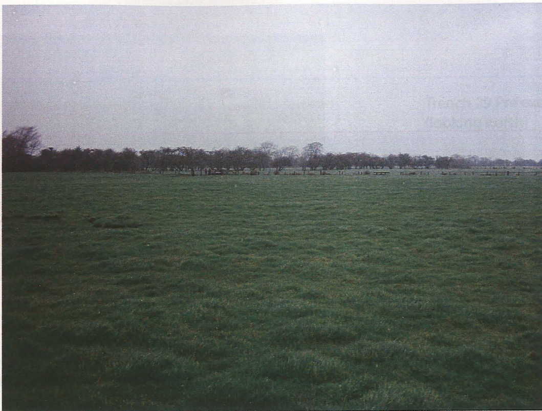
Trench 28 pre excavation (looking west)