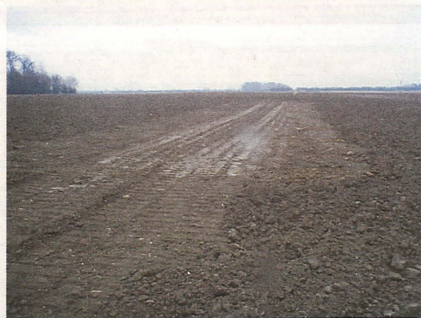
Trench 4 post excavation