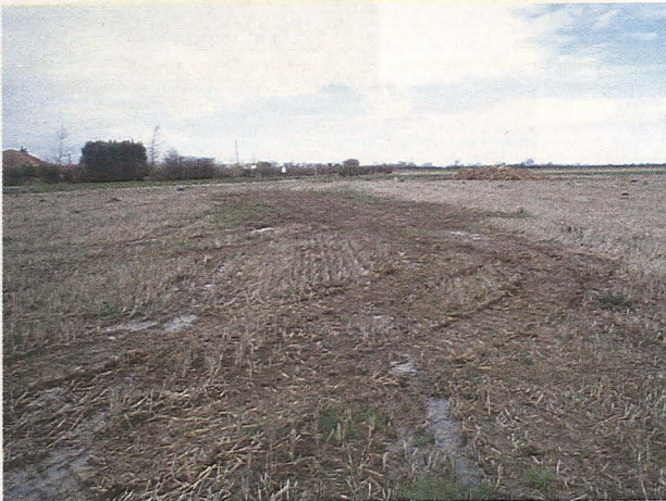
Trench 21, Post excavation (looking north)

Trench 23, Pre excavation (looking west)