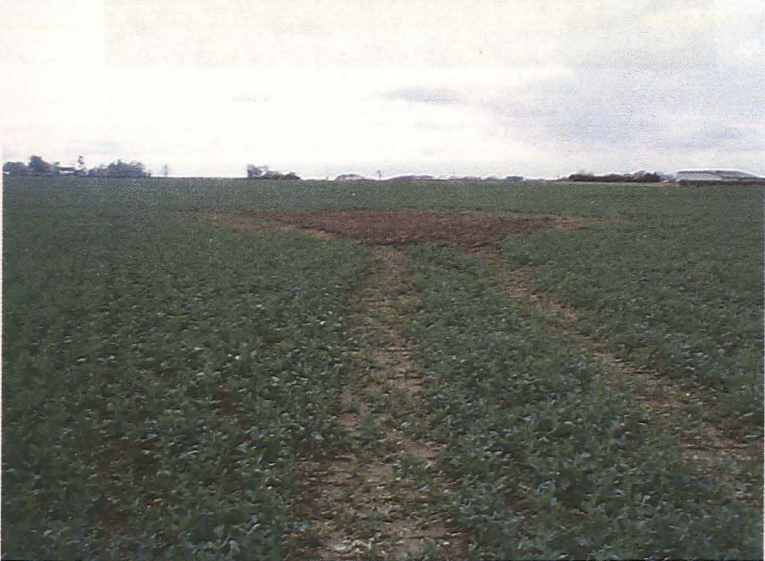
Trench 14, Post excavation (looking northwest)