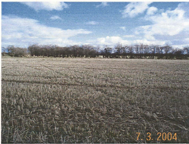
Trench 8, Pre excavation (looking southeast)