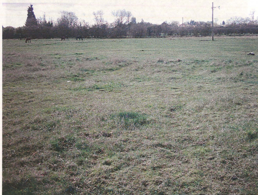
Trench 32, Post excavation (looking north)