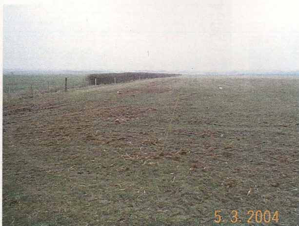
Trench 11, Pre excavation (looking south east)

Trench 13, Pre excavation (looking south west)