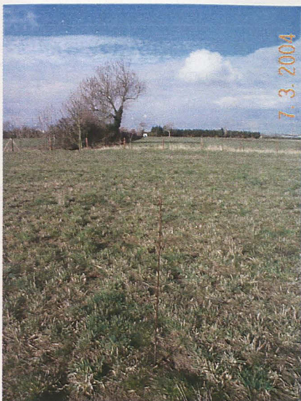
Trench 23, Pre excavation (looking west)