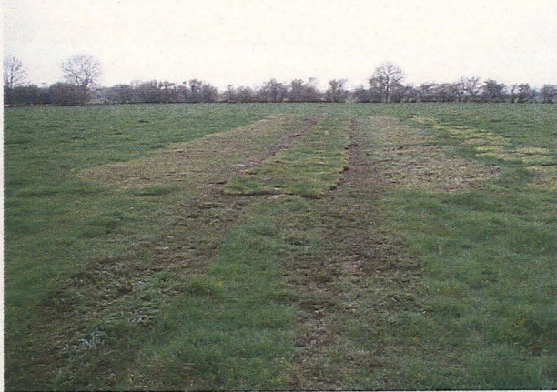
Trench 29, Post excavation (looking west)