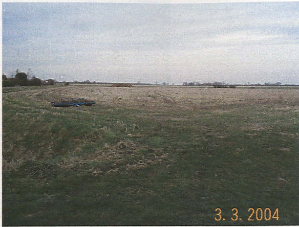
Trench 21, Pre excavation (looking north)

Trench 23, Pre excavation (looking west)