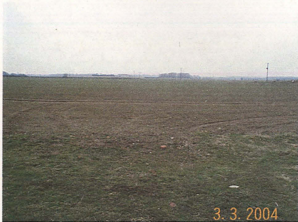
Trench 15-16, Pre excavation (looking east)