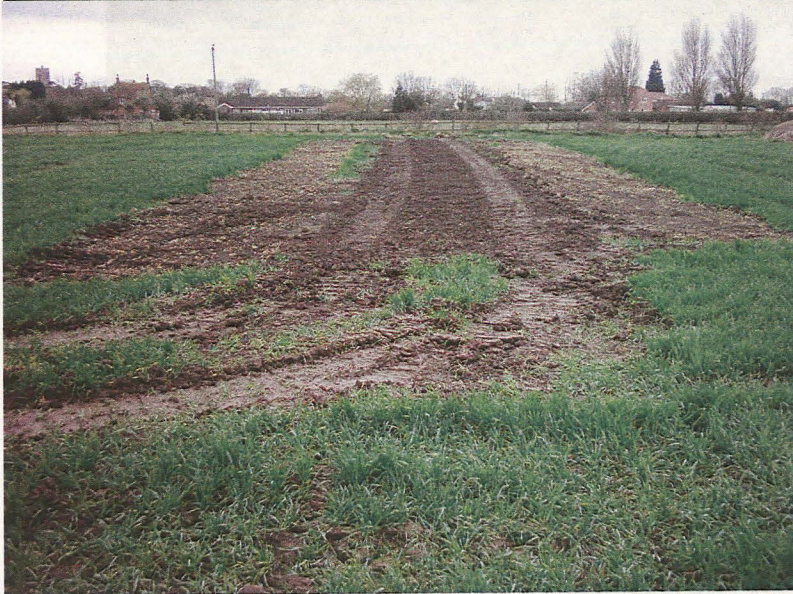
Trench 34 Post excavation (looking west)