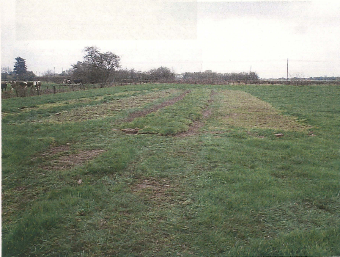
Trench 28 post excavation (looking east)