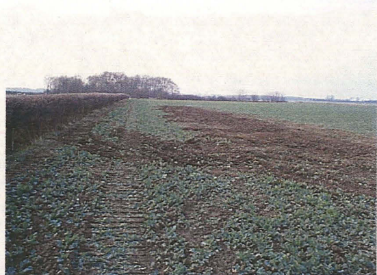
Trench 12, Post excavation (looking south east)