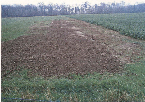
Trench 1, Post excavation (post excavation)

Trench 3, pre excavation (looking north east)