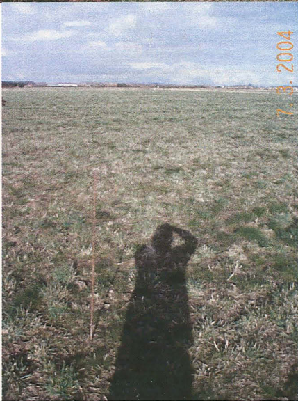
Trench 26, Post excavation (looking southwest)