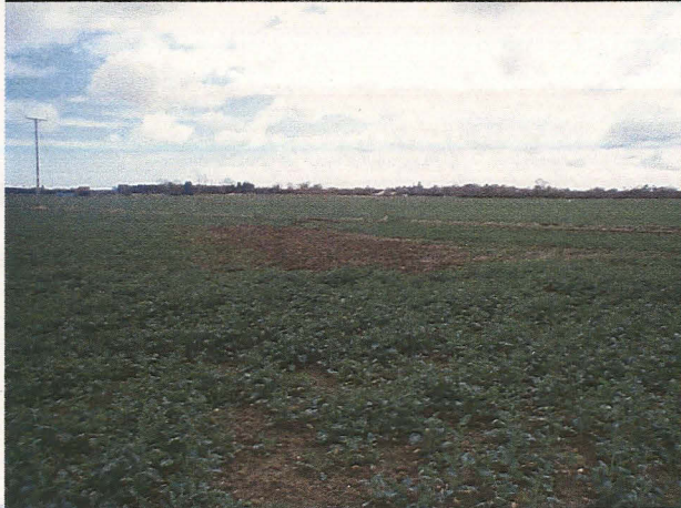
Trench 15 (below left) looking east and 16 (below right) looking east.