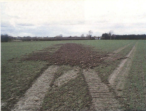
Trench 22, Post excavation (north east)

Trench 24, Pre excavation (looking east, Trench 22 visible in background)