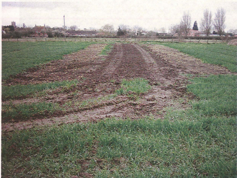
Trench 34, Post excavation (looking northwest)