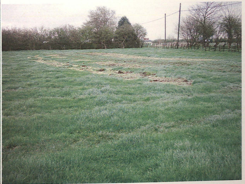
Trench 38, below left pre ex, post ex below right