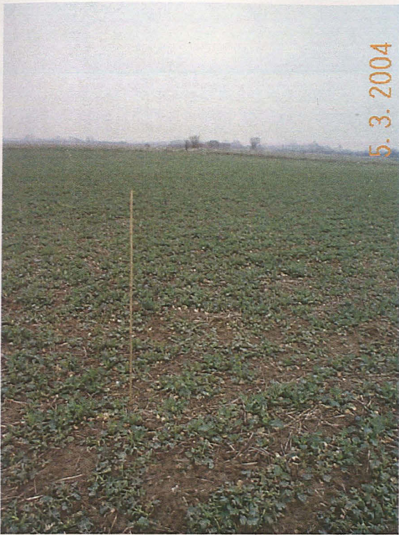
Trench 13, Pre excavation (looking south west)