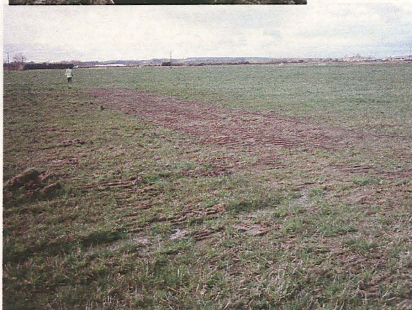
Trench 26, post excavation (looking southwest)