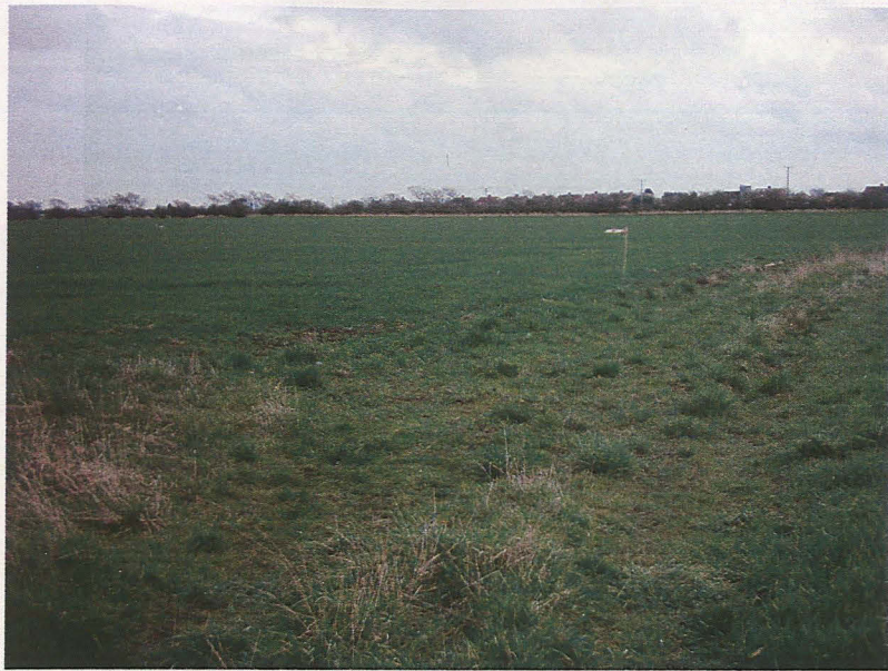
Trench 34, Pre excavation (looking northwest)