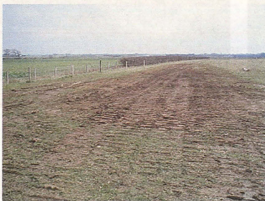
Trench 11, Post excavation (looking south east)