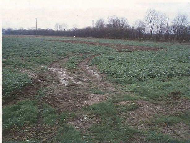
Trench 3, Post excavation (looking west)