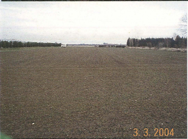
Trench 18-20, Pre excavation (looking east)