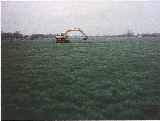
Trench 29 Pre excavation (looking north)