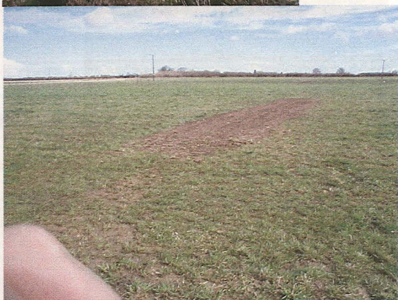
Trench 23, post excavation (looking east)