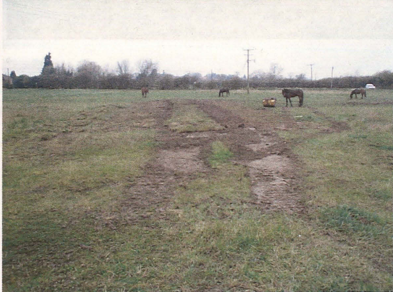
Trench 31 Post excavation (looking southwest)