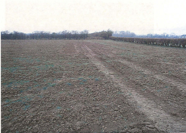
Trench 10 post excavation (looking north)