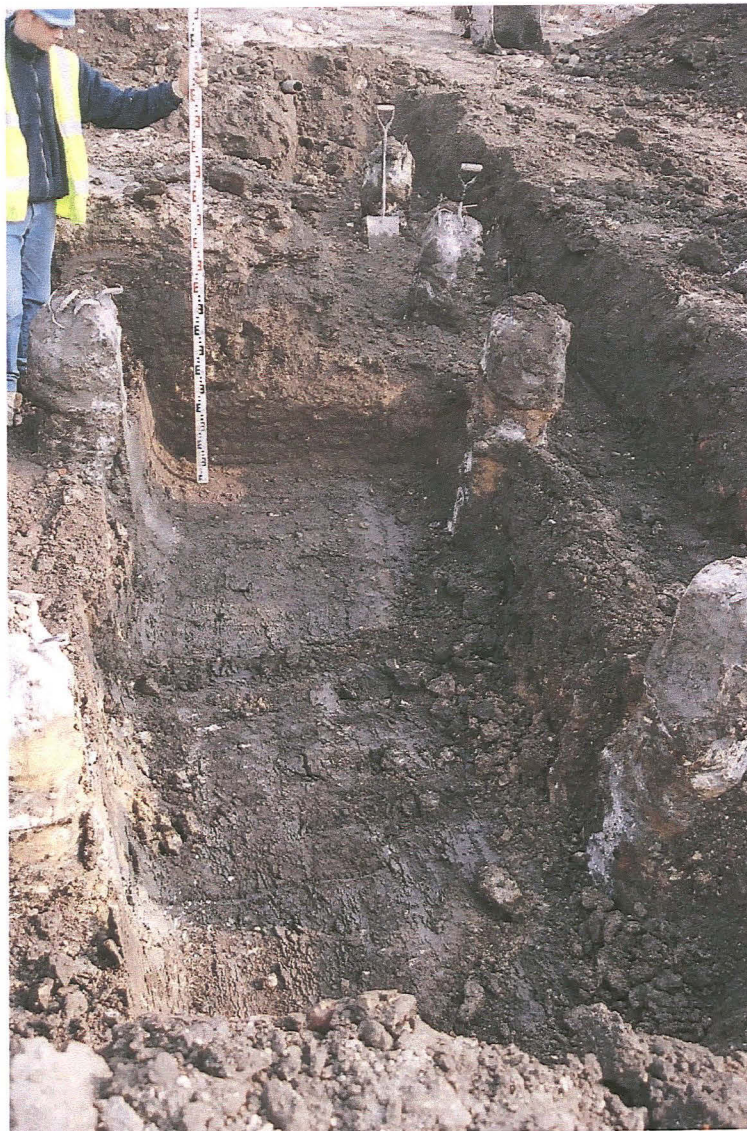
Pl.2. The lift shaft looking north