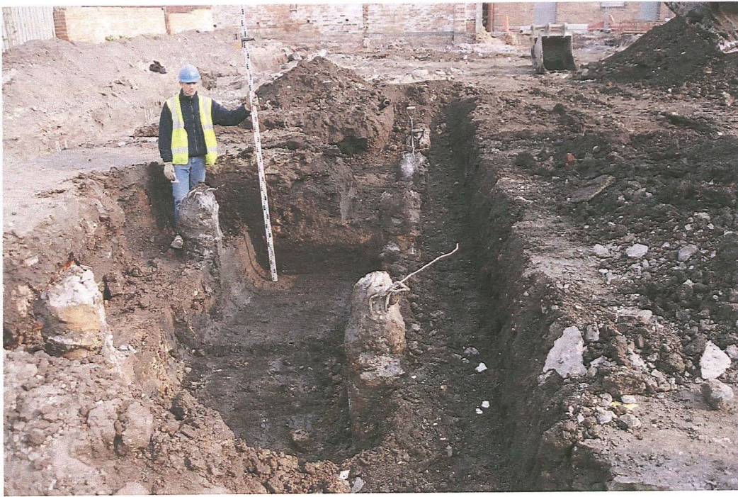
Pl.1. The lift shaft looking north