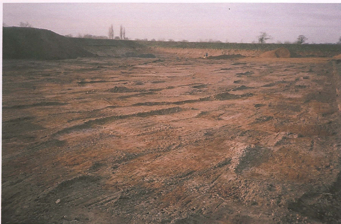
Pl. 3 Phase 3, north end, stripped of topsoil. Looking south-west.