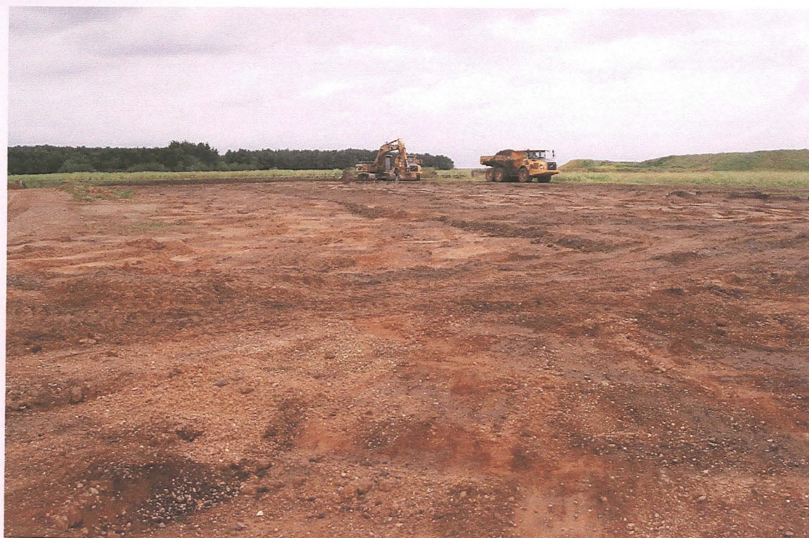
Pl. 4 Phase 3, south end, stripped of topsoil. Looking west.