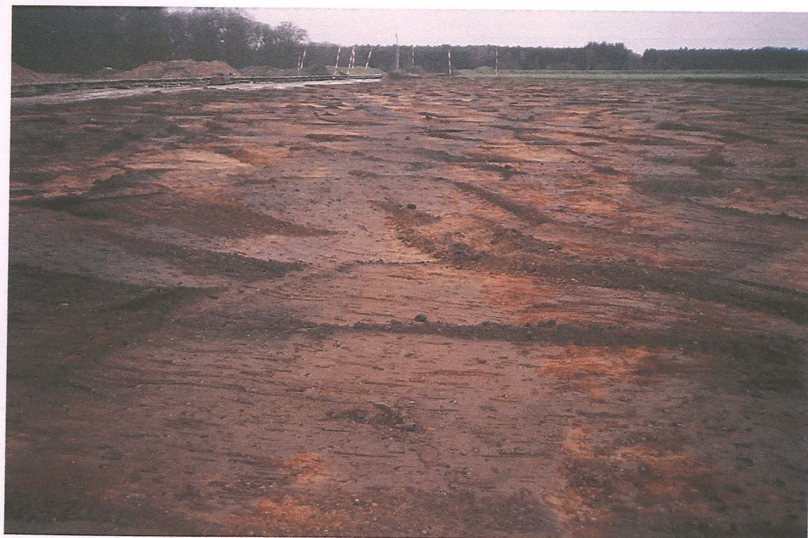
PL. 2 Phase 3, north end, stripped of topsoil. Looking north west. Note pipe in foreground ditch.