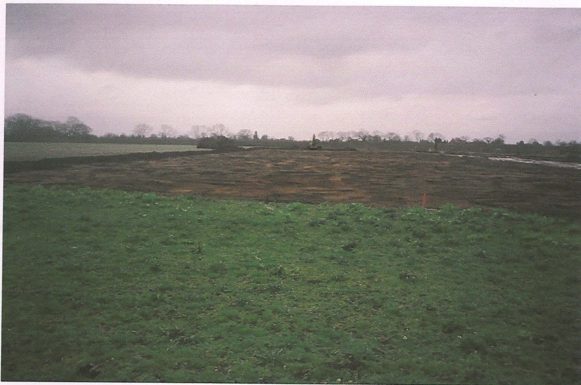
PL. 1 Phase 3 topsoil stripping in progress. Looking south.